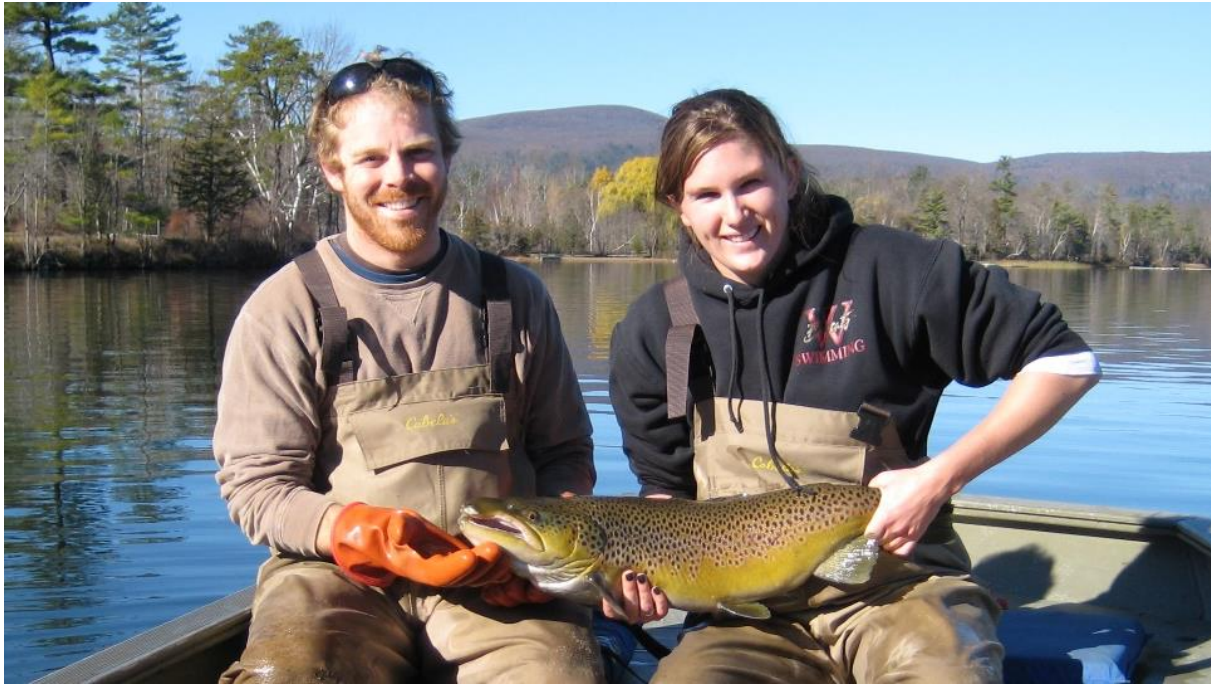
Hold-over trout tend to be highly prized due to their size and beauty