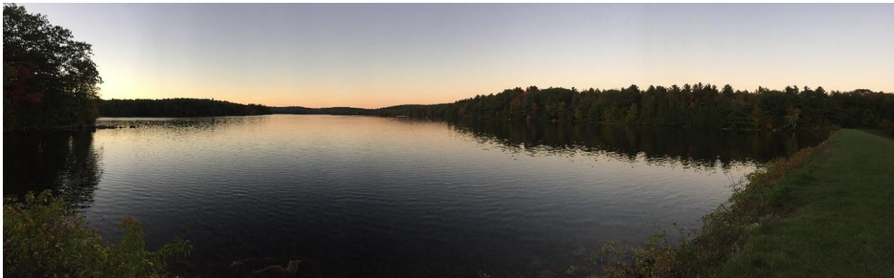
Trout fishing at dawn is a perfect way to de-stress and start the day