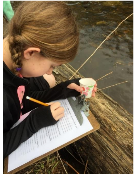
The Salmon-in-Schools program has introduced thousands of students to the life history and restoration efforts of the Atlantic Salmon within the Connecticut River Watershed. Eggs to support the classroom rearing of Atlantic Salmon fry are provided by the Kensington Fish Hatchery

Connecticut River strain Atlantic Salmon from the Kensington State Fish Hatchery are also used for research by many partners. All other Atlantic Salmon produced at hatcheries in New England are either aquaculture stock or part of the Gulf of Maine Distinct Population Segment, which is listed as federally endangered and therefore are generally not available for distribution and use.