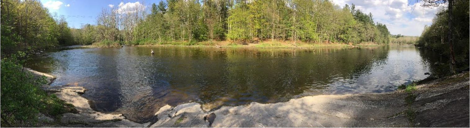
Fishing is dependent upon public access to the water. Public land and fishing easements (legal access within a land deed) are the best ways to ensure large sections of water are available to fish