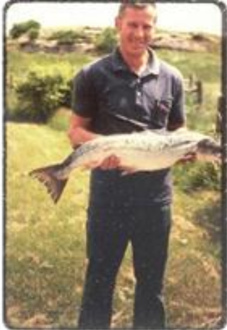
One of the first captured “returning” Atlantic Salmon

To maintain a legacy population of Atlantic Salmon in Connecticut, the Fisheries Division plans on annually stocking approximately 250,000 newly-hatched salmon fry into selected streams within the Farmington and Salmon River watersheds. Atlantic Salmon fry will be stocked to ensure all life stages of the species are represented in the Connecticut River watershed. The intent for this level of stocking is to have limited runs of returning Atlantic salmon.