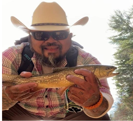
Recent angler surveys indicate that many anglers prefer to release their fish (versus take home a daily limit)

Until the early 1990's trout management consisted almost entirely of put-and-take stocking of yearling and adult-size hatchery-reared trout (Brook, Brown, Rainbow and the hybrid Tiger Trout ). In stocked streams, statewide harvest regulations (five fish per day creel limit, no length limit) were designed to distribute the harvest of stocked fish amongst the greatest number of anglers. Based upon changing angler preferences and desires, the Fisheries Division created the first catch and release Trout Management Area (Willimantic River in 1976), Broodstock Atlantic Salmon Areas (1991), and the first Wild Trout Management Area (Tankerhoosen River in 1993).