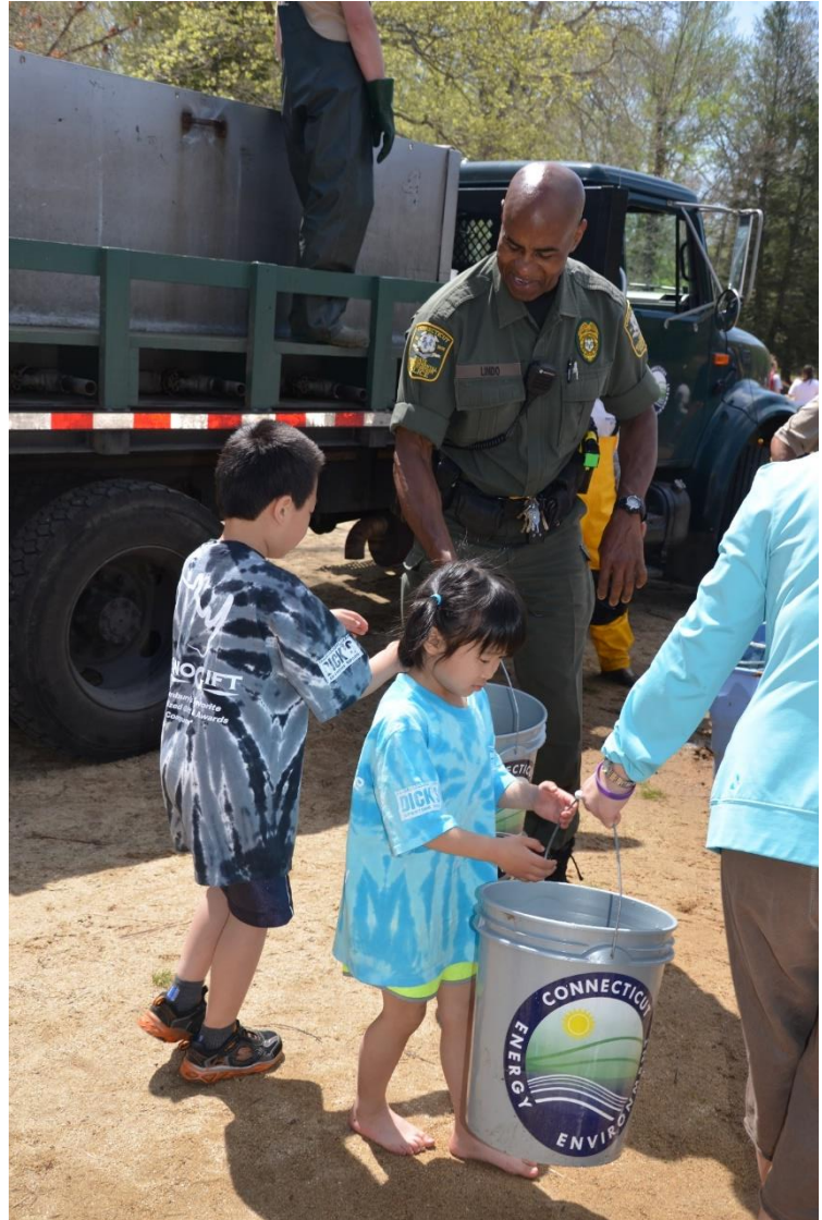
Annual events where the public are invited to “stock with DEEP” are very popular and help to increase awareness of Connecticut’s trout fisheries

Since 2011, the Fisheries Division has been investing resources to develop and implement programs to Recruit new anglers, Reactivate lapsed anglers, and Retain existing anglers ( R3 ). The Fisheries Division R3 coordinator will continue to work in conjunction with fisheries biologists and staff with DEEP's office of Environmental Justice in order to implement campaigns, programs, and policies that will increase equitable access to, awareness of and participation in salmonid fishing opportunities.