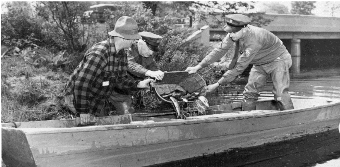
The State of Connecticut began mass producing adult-sized trout, after World War 2, to support the growing number of anglers and their desire to catch and keep trout

Invasive - Generally describes a non-native fish that becomes established and has a negative impact on one or more native species or habitats.