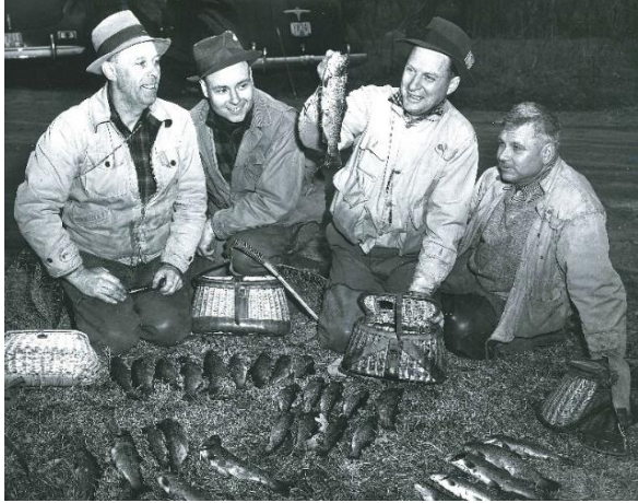
Hatchery production was necessary to support angler demand for catching a "limit" of trout