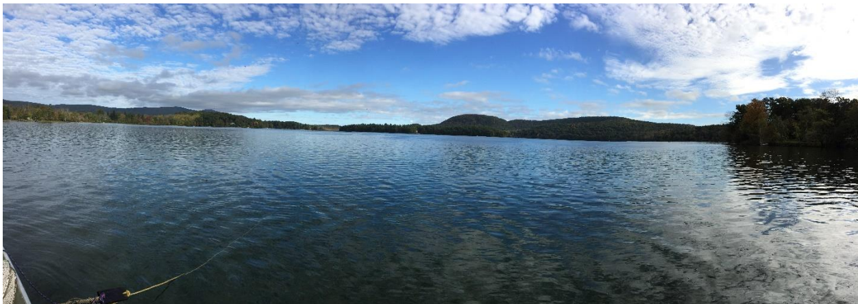
Connecticut stocks nearly 100 lakes and ponds providing quality fishing from boat or shoreline

One of Connecticut's most well know Trout Mangement Area is on the West Branch Farmington River in the towns of Hartland, Barkhamsted, and New Hartford