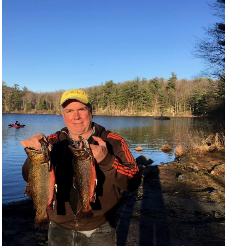
Specialty fish, like the production of large Brook Trout, are very popular with anglers. The fish are grown longer within the hatchery, which take space and resources, however, when caught are quite memorable

“Specialty Fish” are grown within our hatcheries longer than the standard-size trout. These fish are raised with specific applications in mind (put and take or to increase the potential to “hold-over”). Many of these fish are greater than 12 inches and weigh over a pound or more. Some examples include the “Survivor” Brown Trout, fall stocked large Brook Trout, Tiger Trout, retired spawning stock, and Seeforellen strain Brown Trout.