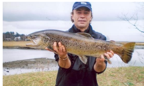
The Fisheries Division has made multiple attempts since the 1950's and 1960's to create a robust sea-run Brown Trout fishery. While there have been some occasional returning fish, there has never been enough to support significant fishing pressure