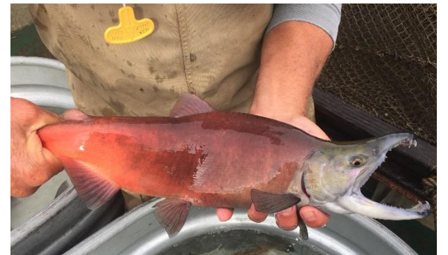
Kokanee fisheries have been established in several Connecticut lakes since the early 1960's (top photo). To sustain the fishery adult salmon, ready to spawn, are collected each fall (middle photo) and spawned by hand at the Burlington Hatchery (bottom photo). The resulting young fish are stocked the following spring at a size of 2-3 inches