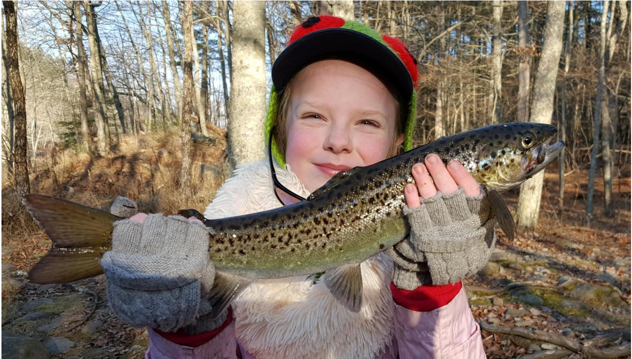
The Fisheries Division began releasing surplus Atlantic Salmon adults into the Naugatuck River and Shetucket River in 1991. This quickly became a popular fishery, which continues to draw anglers from around the region to take part in this unique fishery