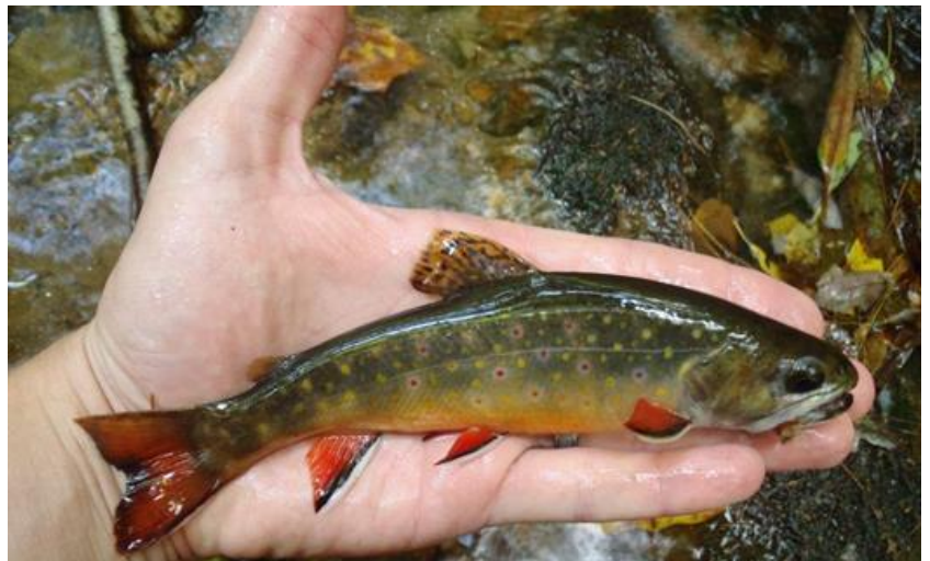
Brook Trout were on the brink of extirpation in the mid-1800's according to reports of the CT Fish Commission. With Connecticut's landscape changing from agriculture to forest, the Brook Trout remains a fixture in many of our small and cold waters

Due to the changing landscape and environmental conditions, a comprehensive management strategy will be required to protect and sustain Connecticut's wild trout populations. This will include identifying