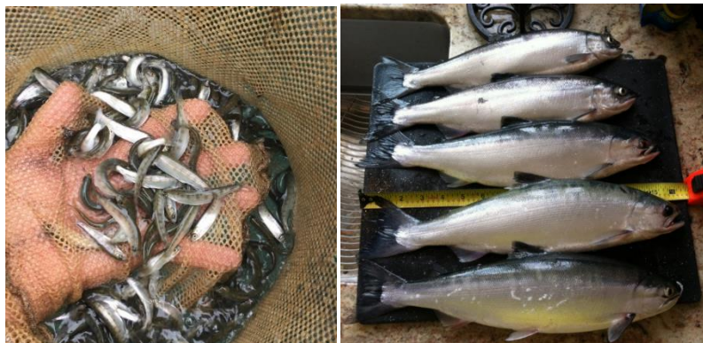
Stocked as fry (2-3 inch) the Kokanee take 3-4 years to grow to 14-20 inches. The adult fish (right) are silver until the fall when they transform both physiologically and morphologically