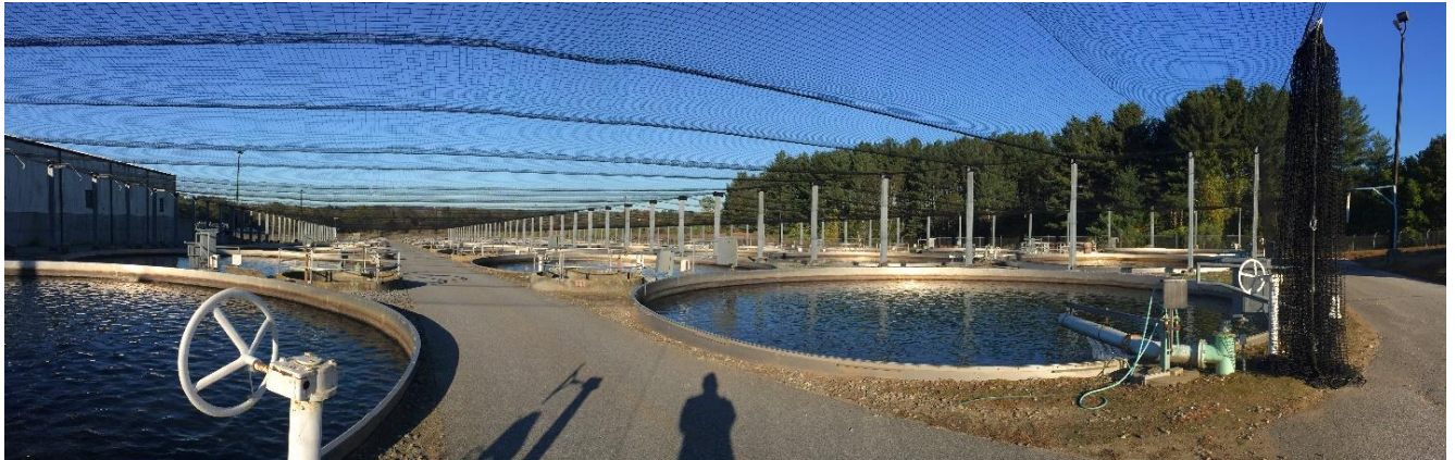
Brought online in 1971, the Quinebaug Hatchery was the largest fish hatchery east of the Mississippi River. Today this facility produces the majority of our standard-size trout for the state