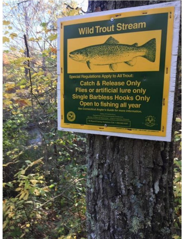
Many of CT's small waters contain wild trout. Those where there is good public access and enough fish to support angling are part of the Wild Trout Management program

Evaluation of growth and survival over the past decade has indicated that in many cases the juvenile or fry Brown Trout grow to be brightly colored, wild-looking fish. It has also been documented that these stockings can produce fishable densities of catchable-size trout, while some fish also migrate out from their “nursery” stream to become part of the Housatonic River TMA fishery.