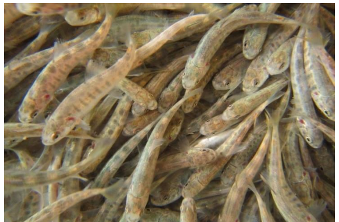
Brown Trout fry have been stocked into WTMA class 2 and 3 for close to two decades. These fish have the potential to survive for several years and become part of the fishery