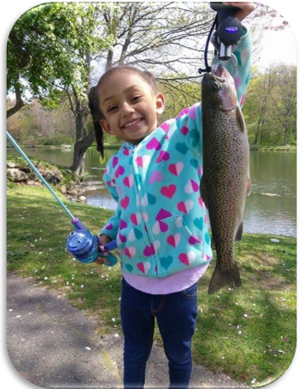
Trout fishing in Connecticut has a long tradition of bringing families together to enjoy our natural resources

To help develop this plan, the Fisheries Division emailed a survey seeking angler preferences for trout and salmon fishing to over 50,000 fishing license holders, hosted six trout and salmon forums around