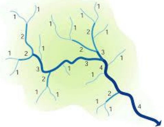
A network of streams is similar to that of a tree. The "order" assigned to a particular waterbody starts with "1", a single unbranched water. When two waters of the same "order" merge, the number is increased by one. Two first order streams join to make a second order stream. In Connecticut, the majority of self-sustaining wild Brook Trout waters are classified as first or second order. Many of these being located on privately owned land

Regionally, the identification and management of wild trout populations by state, federal, and non-governmental organizations is increasing as cumulative changes to the environment create conditions that are not favorable for native salmonids. In addition, there is an increasing interest in the fishing