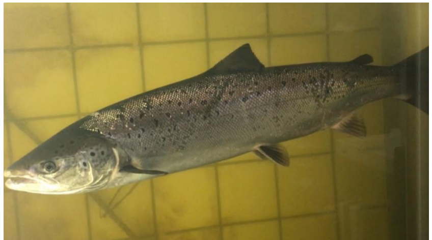
A returning adult Atlantic Salmon as seen moving through the Rainbow Fishway in 2017. The Fisheries Division no longer captures these upstream migrants, but instead, allows free passage through the fishway

For over 45 years, biologists have been breeding adult salmon that have returned to the Connecticut River as part of the restoration program. Fish that were originally stocked to support restoration came from Maine, but over time the genetic identity of the strain shifted as fish adapted to their new river. The current strain is the southernmost population of Atlantic Salmon and it is important to maintain this strain, not only to support CT’s Atlantic Salmon Legacy program but also to preserve this unique genetic resource, the importance of which may go beyond the boundaries of Connecticut.