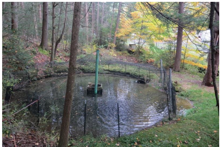
Hatchery operations vary greatly in CT ranging from Quinebaug's interior contoled environments (top) to Burlington's hand-dug sand lined ponds (bottom)