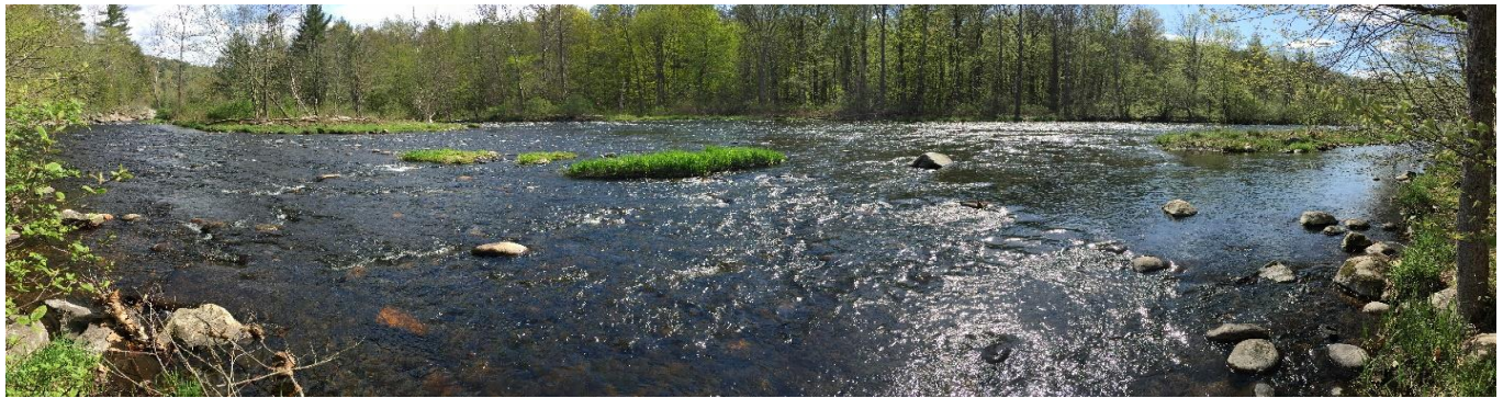
Nearly 200 different rivers and streams are stocked with trout