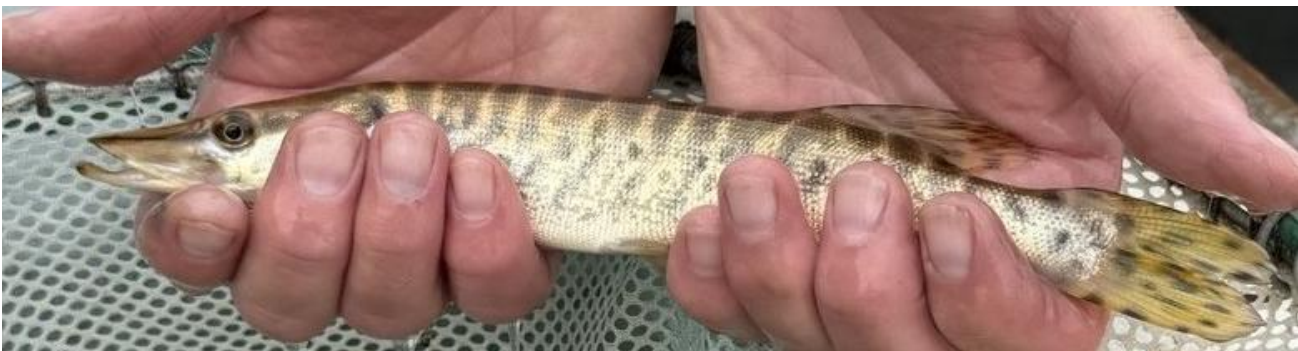
The Fisheries Division stocked young tiger muskies (about 8-11 inches) into West Thompson Lake and Lake Lillinonah in mid-summer 2025. These tiger muskie were surplus production offered free of charge by the Charles O. Hayford State Fish Hatchery in Hackensack, New Jersey.