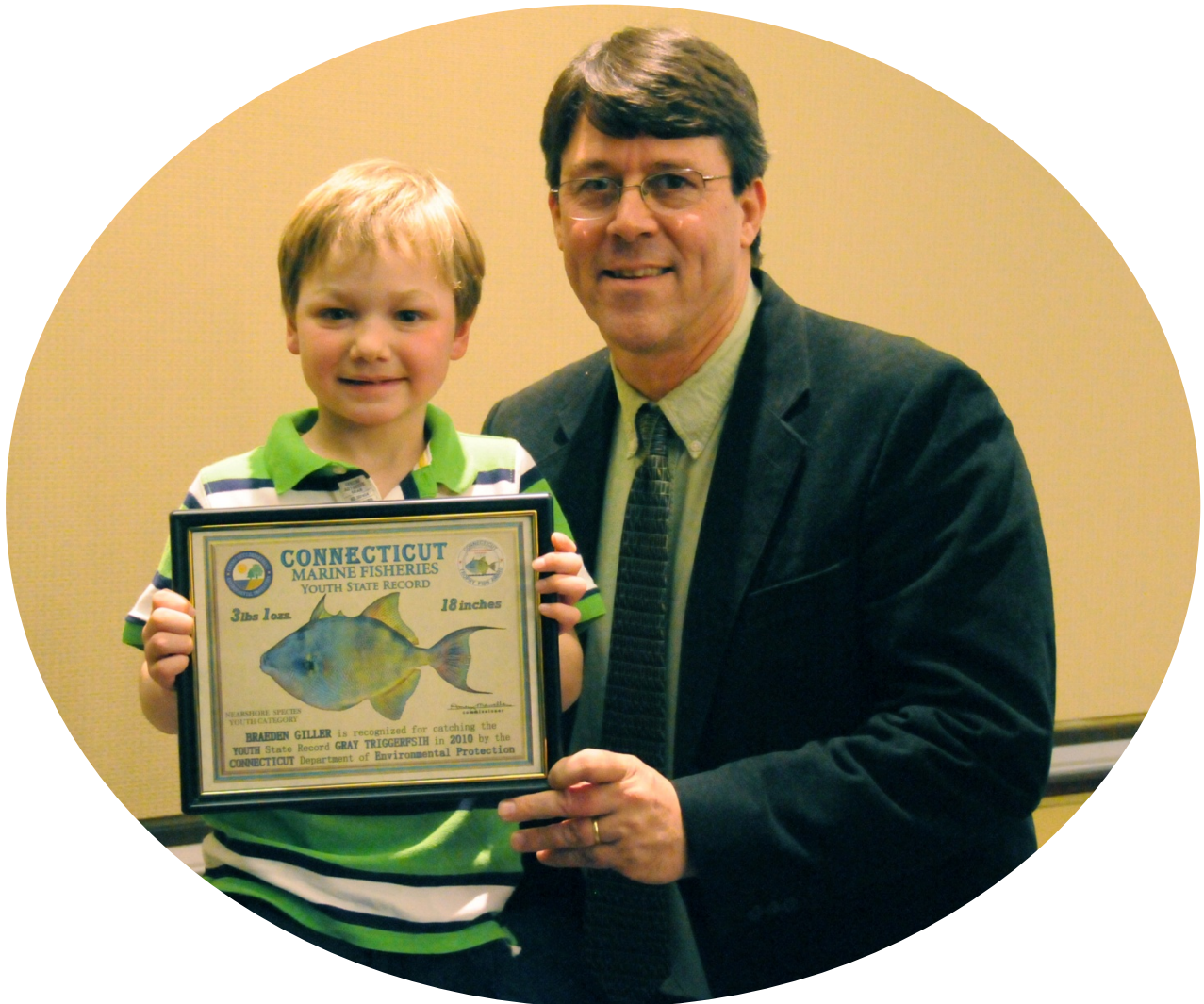
Figure 6.1: Northeast Fishing and Hunting Expo, Hartford CT, February 2011 Trophy Fish Award Ceremony.