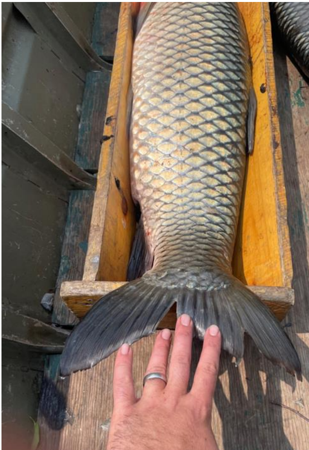
Grass carp have broad tails and make powerful runs. Anglers trying to land grass carp can be in for a big surprise splash of water when they take off on another run.

Fighting the Fish: When hooked grass carp will make an explosive initial run; grass carp in Candlewood lake can exceed 30lbs and put far more strain on tackle than bass. It is recommended to fish with a relatively light drag to avoid breaking the line or pulling the hook. After the initial run, grass carp will settle down, and though they will feel heavy on the line they can be gradually brought in, but that does not mean the battle is over. When grass carp get close to the boat or shore, you can expect them to make another powerful run and will often soak unsuspecting anglers with water thrown by their broad tails. You can expect to repeat the run and retrieve cycle a couple times before a grass carp is ready to be landed. Grass carp can be challenging to land without a large landing net.