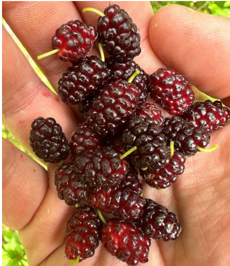
Mulberries are a favorite food for both grass and common carp during June and July.

Hunting for Berries: There are a variety of trees and shrubs that produce berries; these include mulberry trees, some varieties of cherry trees, autumn olive, and porcelain berry among others. When these plants hang over the water their berries fall into the lake where they are favorite food for both grass and common carp. Finding a berry tree can be a challenge, but once located the rewards are worth the effort. Grass carp will often sit directly under a tree that is