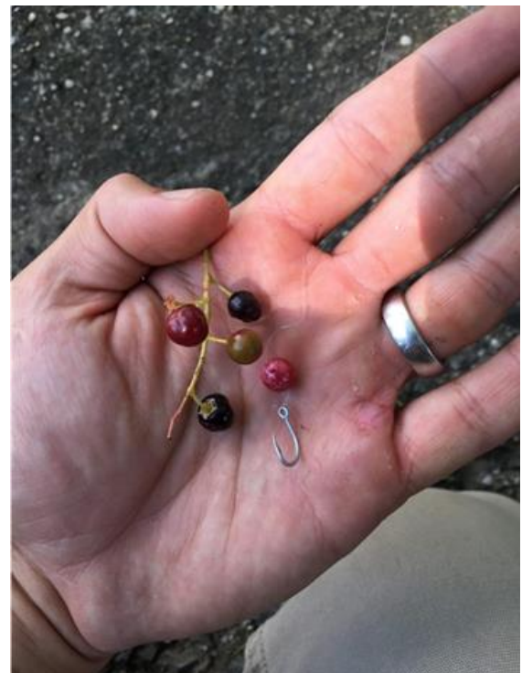
Black cherries are also relished by carp. This photo provides an example of the size hook that can be used for grass carp as well as how egg beads can be used to imitate berries.

Tackle: Even though grass carp are a large fish, a comparatively small hook is needed to catch them. They have small mouths and will reject baits that don't look or feel natural. A small but reasonably stout hook (size 4-6) is recommended. For line, 10lb braid connected to a long 8-10lb monofilament leader offers a good compromise of breaking strength and enhanced casting distance. The monofilament leader also helps baits float on the surface. A 7-9ft medium weight rod equipped with a 3000 class (small to medium size) spinning reel will allow anglers to cast light baits but have enough strength to handle a large grass carp. Catching a big grass carp is an exciting challenge for fly fisherman as well. A 9-10 weight fly rod provides the backbone necessary to handle these fish. Fishing berry patterns is probably the best bet for connecting with a carp on the fly.