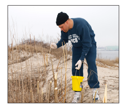
A dune restoration project at Mitchell Beach, New London, consisting of the removal of invasive plants and replacement with native plantings and protective snow fencing, will restore a 1.5-acre dune system located adjacent to a 600 foot long sandy beach. Here, a volunteer applies herbicide to invasive plants in the dune. For more information about this project, see Issue No. 29 of Sound Outlook.