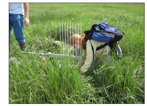
DEP staff use a surface elevation table (SET) to monitor sea level changes in a tidal marsh.

Remember, it is climate change, not global warming. We are currently in a phase of more frequent nor'easters, and storm intensity is predicted to increase, so don't put away your snow shovels yet. Recent projections predict milder winters with slushier snow, but with weather and ocean circulation patterns changing, no one is positive what the future will hold. Through sentinel monitoring, we hope the indicators of change will help us strategize to better protect Long Island Sound and its vital habitats and resources. For more information on sentinel monitoring in LIS, contact Jennifer Pagach at 860-424-3616 or at jennifer.pagach@ct.gov.