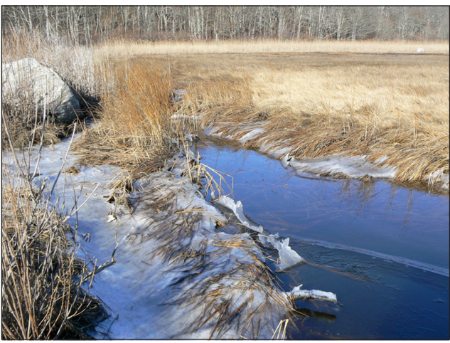
The emergent structures of salt marsh plants decay beneath winter's ice and snow.

Black ducks are notoriously shy, preferring relatively undeveloped watersheds within parks, state conservation lands or refuges. Yerkes