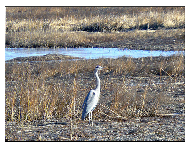
The winter salt marsh remains a productive habitat. Great blue heron.

on the marsh surface and some is flushed into surrounding tidal waters. In either case, as the plant material decays, it releases nutrients that sustain the marsh and provide food for crabs and other wetland animals.