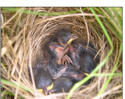
A nest of saltmarsh sharp-tailed sparrow hatchlings in the tidal marsh.

A research study to further scientific knowledge of survival, habitat use and post-fledgling movement of saltmarsh sharptailed sparrow, a tidal wetland bird species of special concern in Connecticut. Here, a researcher holds an adult sparrow.