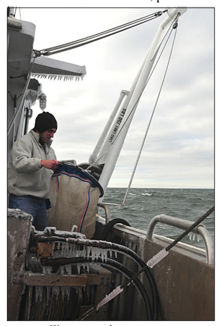
Winter sampling cruise on DEP's R/V John Dempsey.

hen water temperatures drop and even the hardiest boaters have pulled out and battened down for the winter, the Sound's commercial lobster fleet gears up in pursuit of our favorite crustacean, the American lobster. The largest catches of lobster occur just after the animals shed their old shells to uncover new larger shells, and leave their burrows in search of food. The major shed is in late spring, but following a second shed in the fall, cool conditions in December and January are just right for lobsters to resume mating and feeding to get them through the later winter months until spring. During the coldest months of winter, lobsters become less active and spend almost all of their time in their burrows. Females incubate their eggs, which are attached to the underside of their abdomen, throughout the winter with fewer losses due to disease, parasites and disturbance.