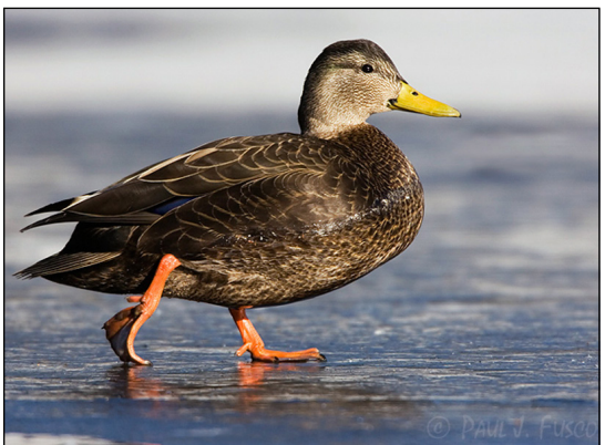
American black duck.

Mummichogs (Fundulus heteroclitus), small omnivorous finfish,