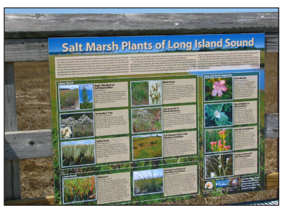
One of 14 educational signs installed at Hammonasset Beach State Park describing various coastal and marine plants and animals, as well as natural coastal processes.