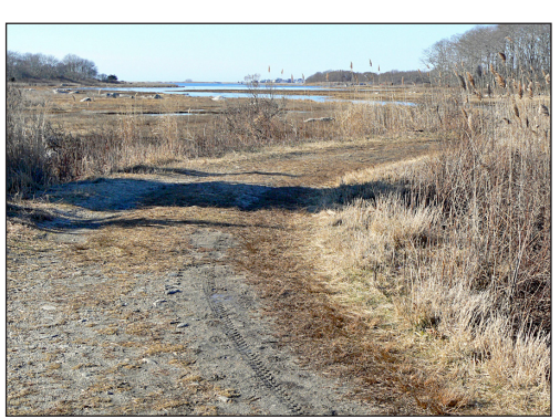
Dike road at Barn Island Wildlife Management Area, Stonington, overlooks Little Narragansett Bay.

Theil at Halos Ecum State Pauls Creater leads to