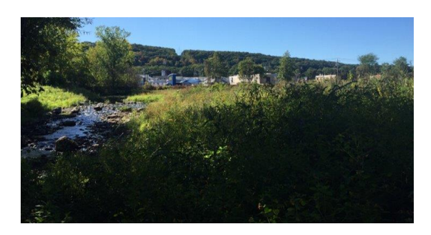
Figure 2. Before dam removal (left) and after dam removal (right) on the West River in the Westville neighborhood of New Haven.

This is not a theoretical concern. In May of this year, one such high hazard dam collapsed in Michigan, causing an estimated $175 million in damages. 40 Additionally, the cost of maintaining any dam is about $2,000 annually. Repairing or replacing a collapsed dam costs between $10 and $500 million dollars.