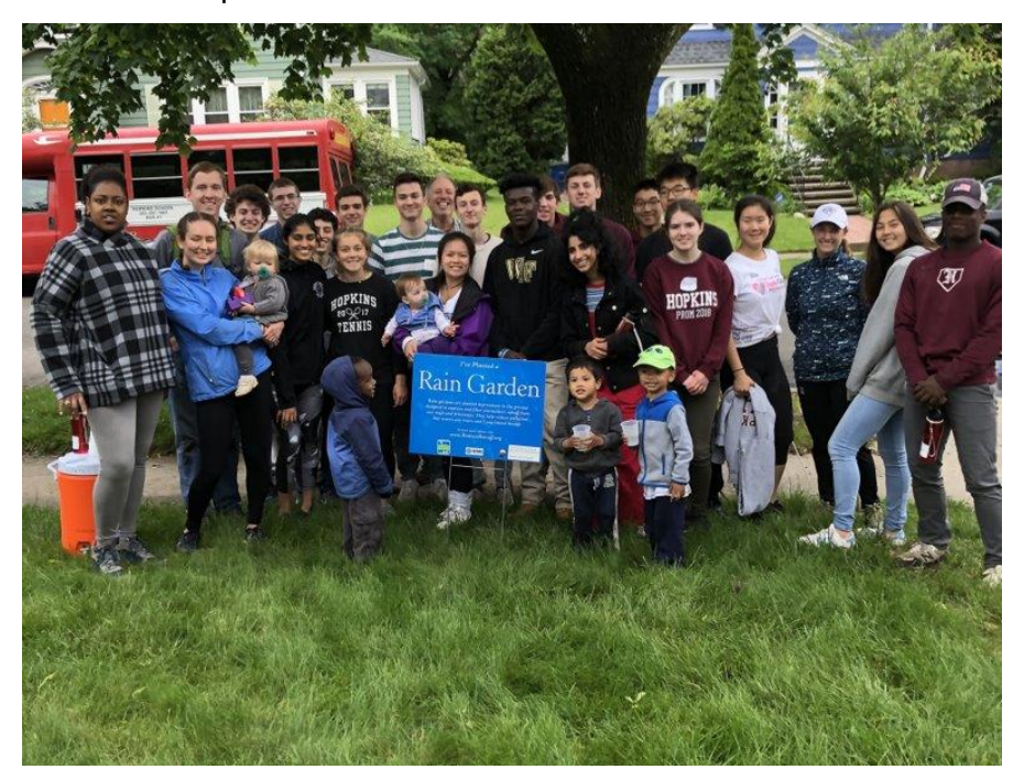
Figure 5. A group of Connecticut residents pose for a picture after planting a rain garden for their neighborhood.

We suggest there be a small amount of state funding designated for long term monitoring the efficacy of these nature-based projects. This data will pay dividends in providing evidence of effectiveness and improving design and approaches. Moreover, to further ensure efficacy, we recommend that the Long Island Sound Study or DEEP provide incentives and leadership in coordinating a regional community of experts on urban, coastal and riverine based nature-based projects, with a priority of including and fostering diverse leadership and participation. The river restoration working group, formed under the Long Island Sound Study has been a highly a successful model that has allowed practitioners and agency experts to learn and improve restoration techniques.