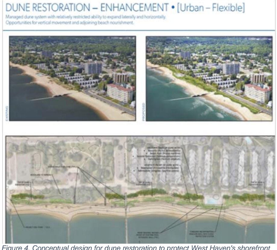
Figure 4. Conceptual design for dune restoration to protect West Haven's shorefront community.

be enhanced, the habitat is improved for its wildlife, and the community has a visibly more beautiful waterfront. West Haven is a low-moderate income suburb. Its public beaches are visited and enjoyed by the wide diversity of community members from the greater New Haven area. This has funding support from the Army Corps and federal match.