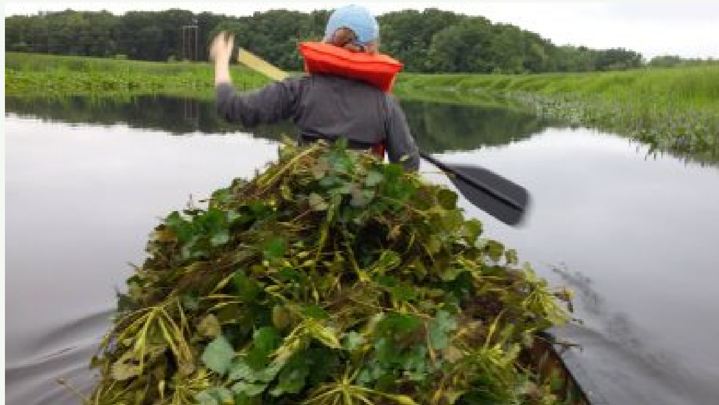
Help remove harmful aquatic invasive water chestnut for the health of communities and ecosystems along the Connecticut River.

Grants to Sustainable CT have focused on their equity work in their eastern Connecticut communities, where they serve over half of the Foundation's towns and 109 in total across the state. Each town committee determines their certified actions to improve resiliency on a local level.