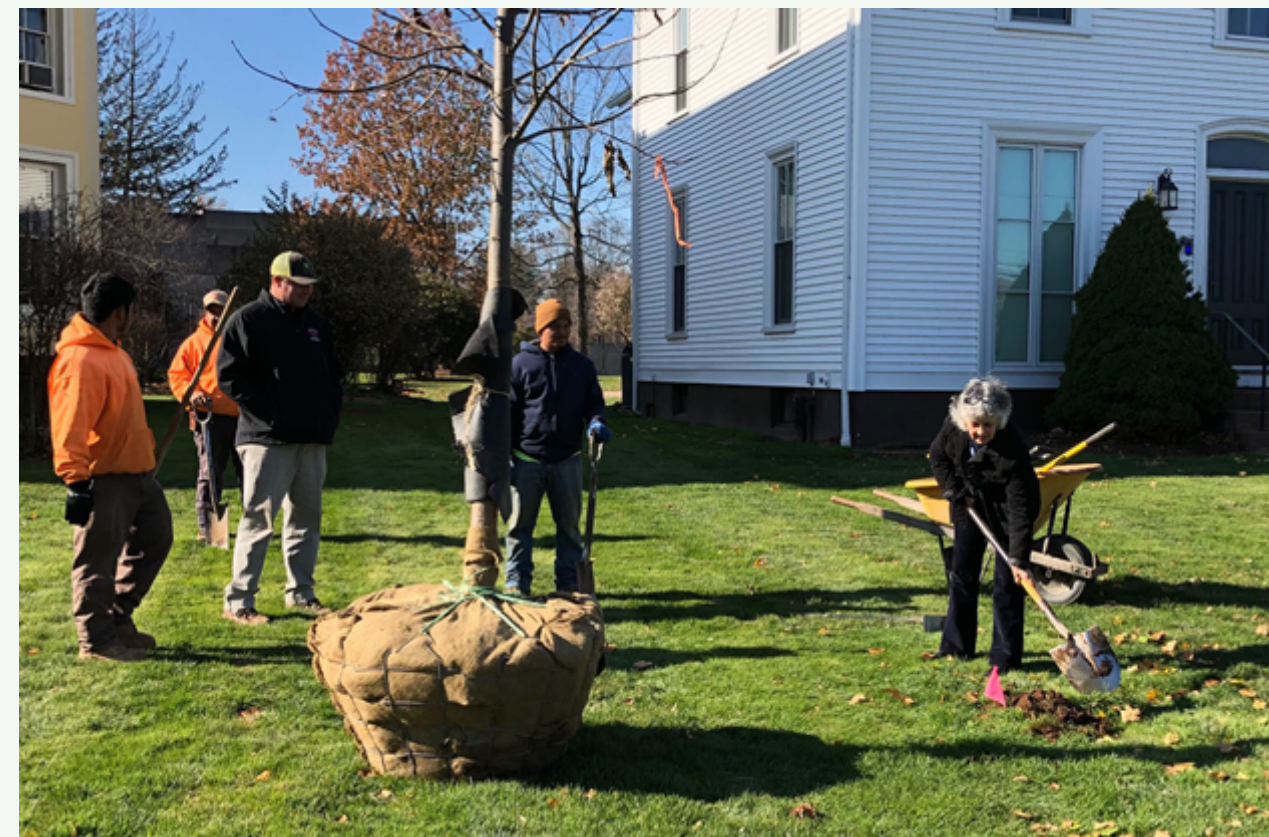
Fight climate change and beautify your town by launching a tree planting effort.