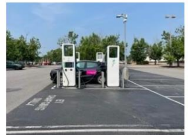
Strip Malls/Big Box