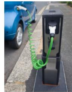
Urban/Commercial Street Parking