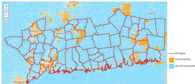
EJScreen - IRA