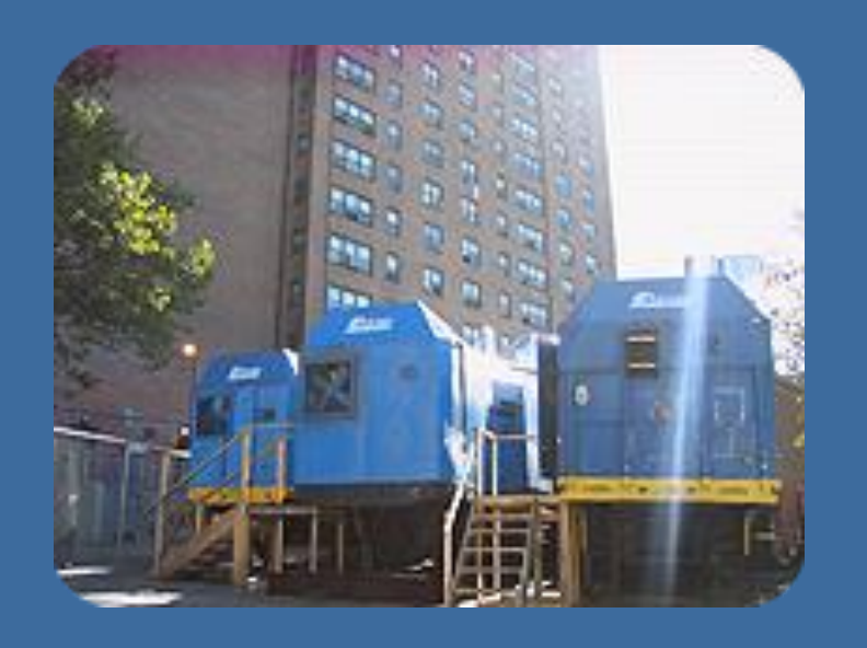
BOILER NOT SUBJECT TO THE RULE

A temporary boiler is defined as any gaseous or liquid fuel boiler that is designed to, and is capable of, being carried or moved from one location to another by means of, for example, wheels, skids, carrying handles, dollies, trailers, or platforms.