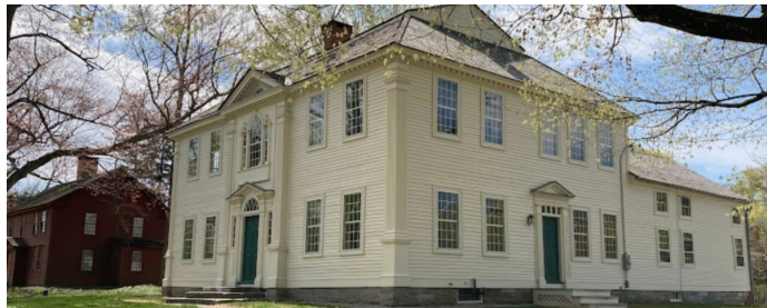
Prudence Crandall Museum, Canterbury CT