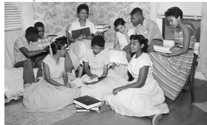
MimiJean Brown, Elizabeth Eckford, Ernest Green, Thelma Mothershead, Melba Pattillo, Gloria Ray, Terrence Roberts, Jefferson Thomas, Carlotta Walls, 1957