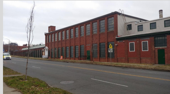
Hartford Special Machinery Company Complex, 287 and 296 Homestead Ave., Hartford