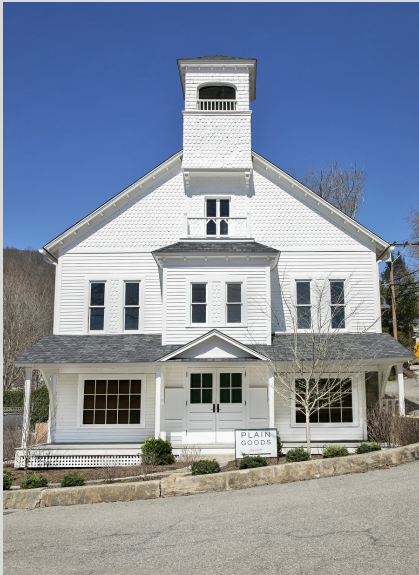
Harry O. Erikson Pavilion Hall, 17 East Shore Rd., Washington