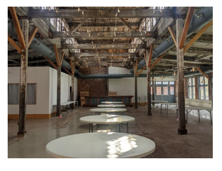
Hilliard Mills, Building 4