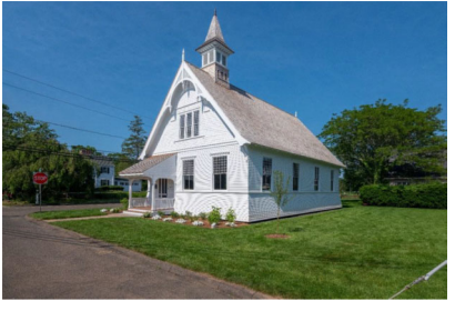
Pine Orchard Union Chapel