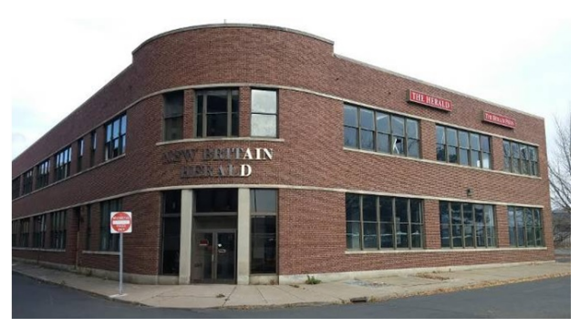
New Britain Herald Building, One Herald Sq., New Britain