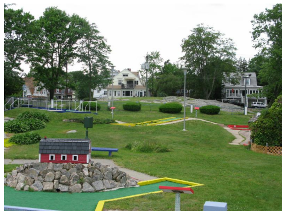
Photo: Ocean Beach Park, New London. Coastal resources are essential to Connecticut's sense of place but are increasingly vulnerable

Last summer the SHPO sponsored a series of charrettes on resiliency planning with several regional councils of governments, or COGs, as part of SHPO's Hurricane Sandy disaster relief program, funded by the National Park Service. The sessions considered ways to recognize historic and cultural resources in local and regional plans, as well as ways to plan