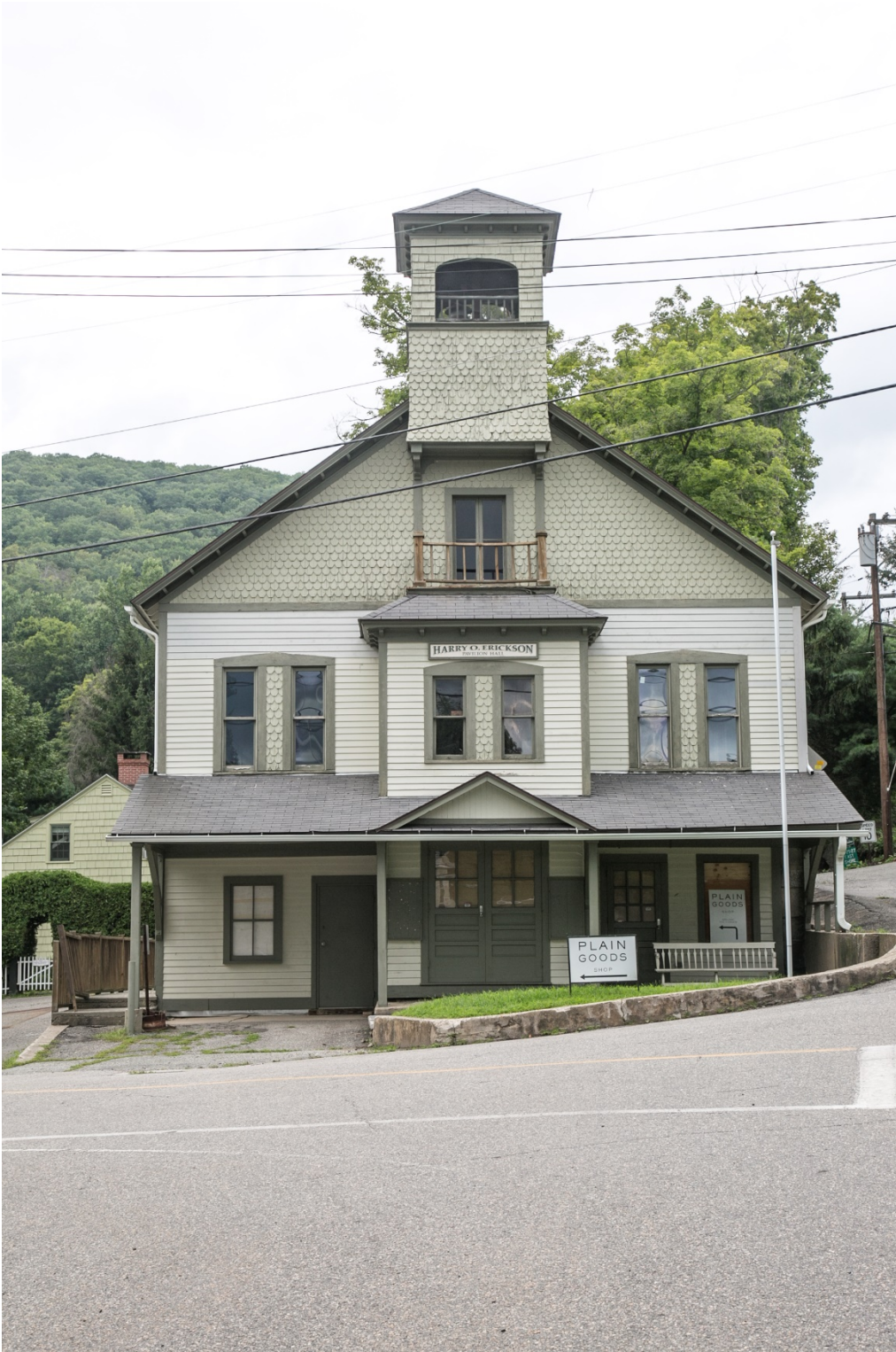
4 of 20. Façade (south elevation), view looking north.