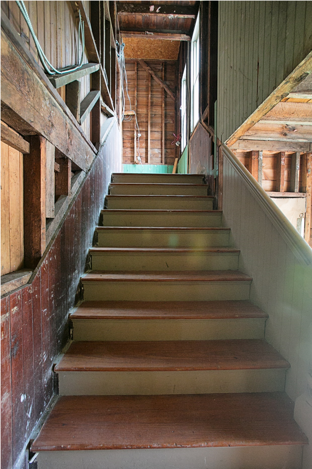
20 of 20. Main Stairway from Lower Level, Looking up.