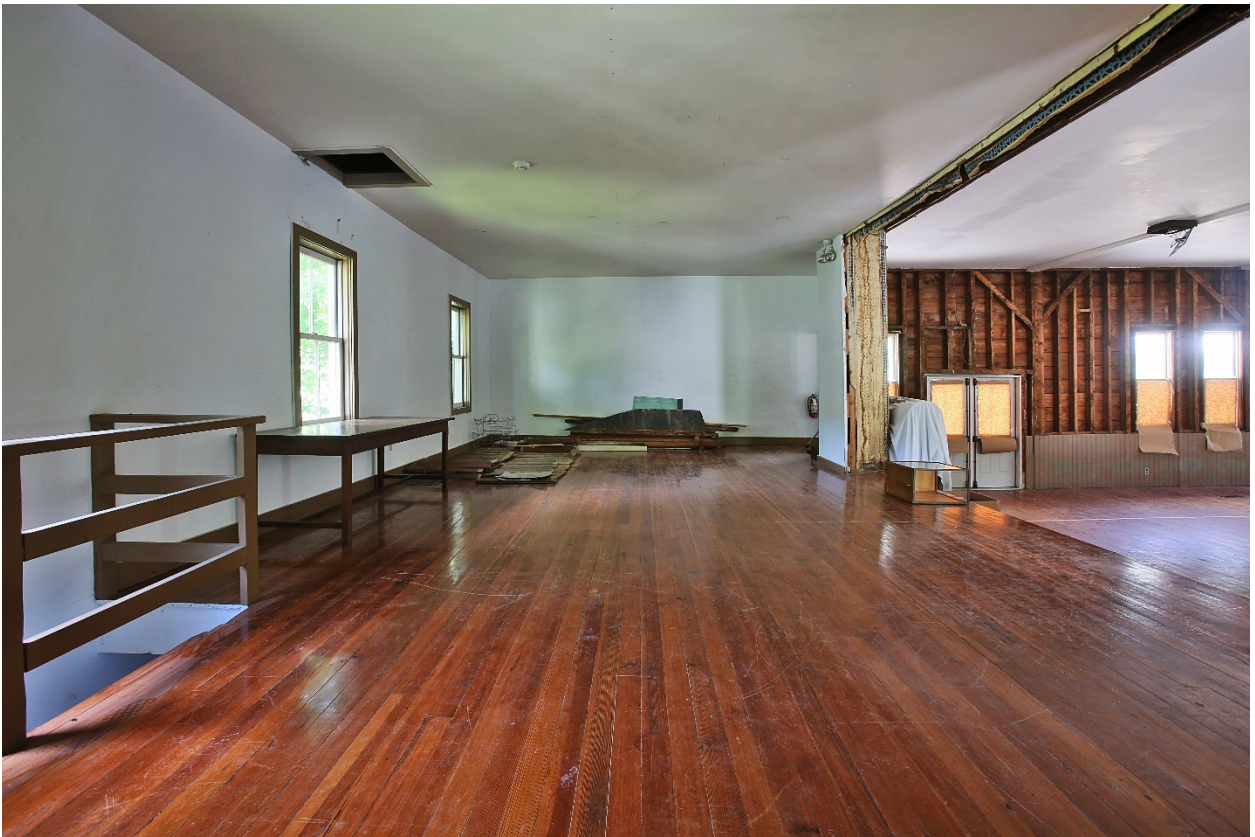
12 of 20. Upper Level – Stage.