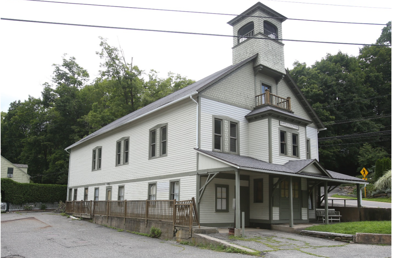
7 of 20. South and west sides of building showing ramp.