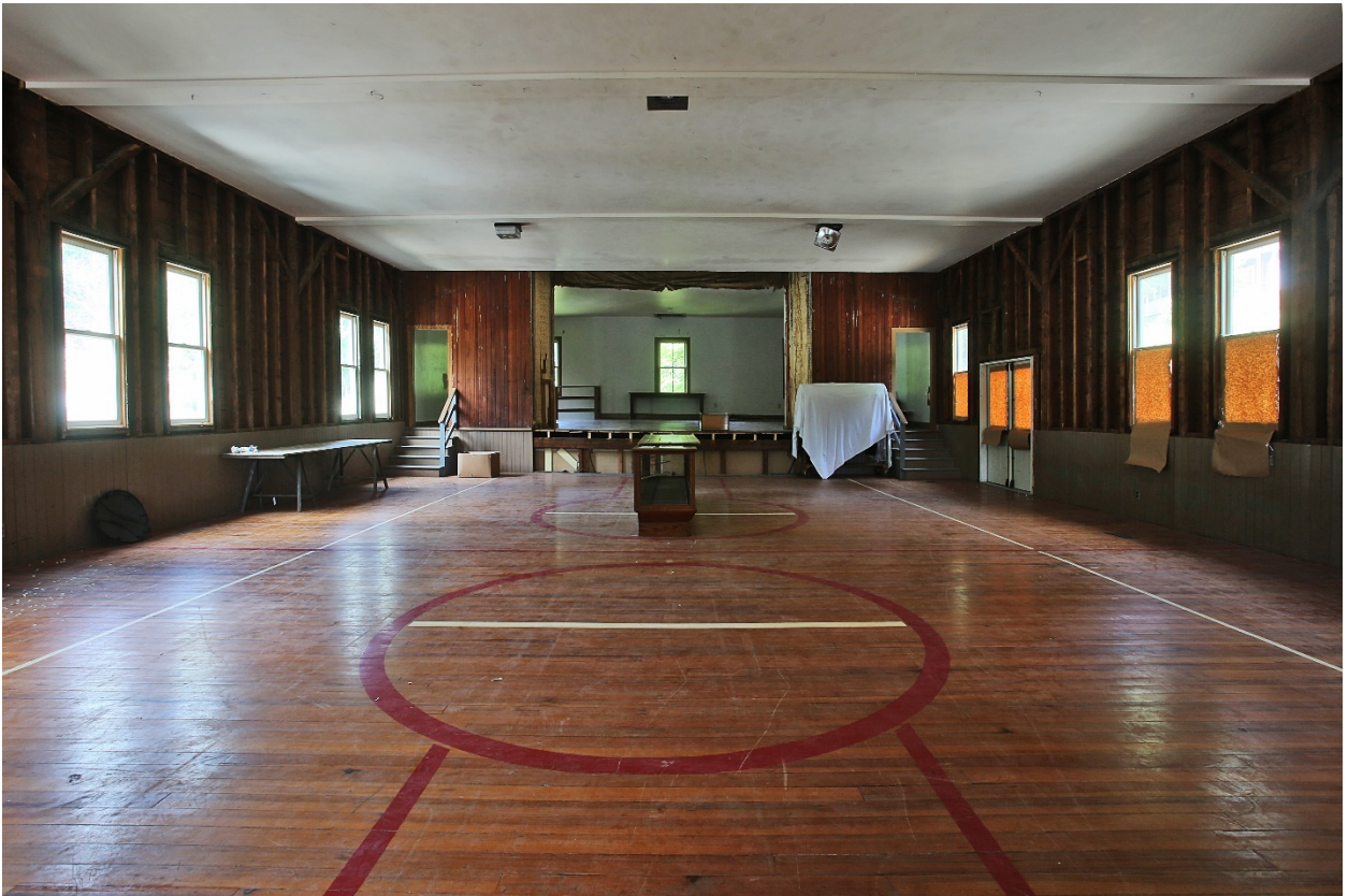
13 of 20. Upper Level - Auditorium & stage. Looking north.