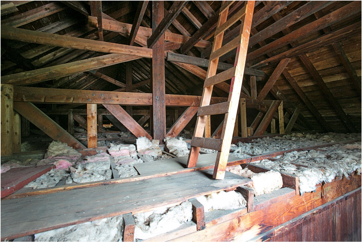
18 of 20. Attic Level – Attic.