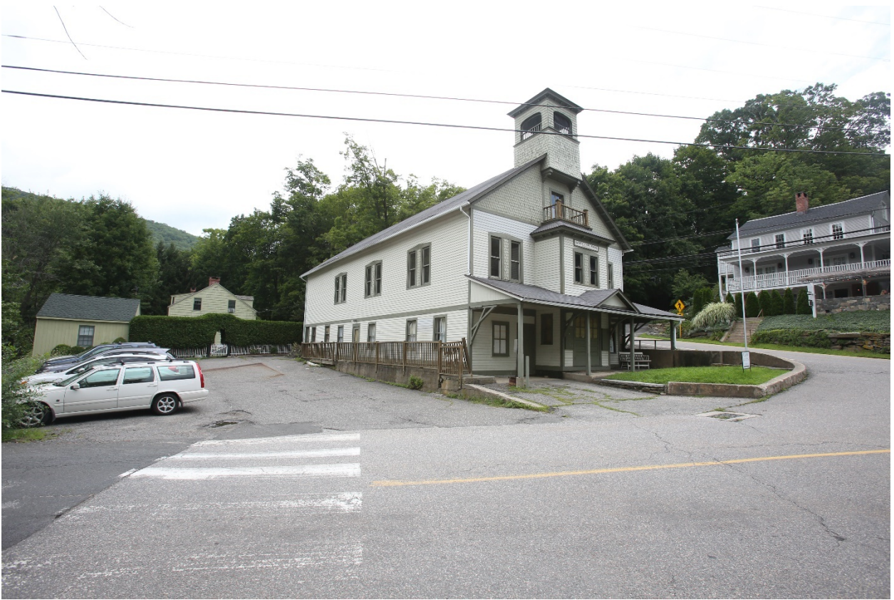
1 of 20. View of Pavilion Hall Front from south.