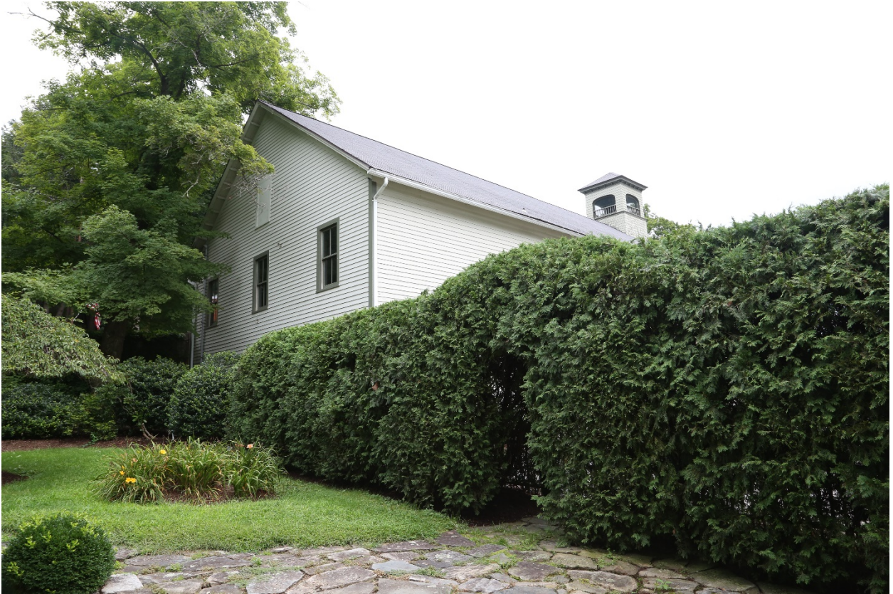
8 of 20. North side of building from neighboring property.