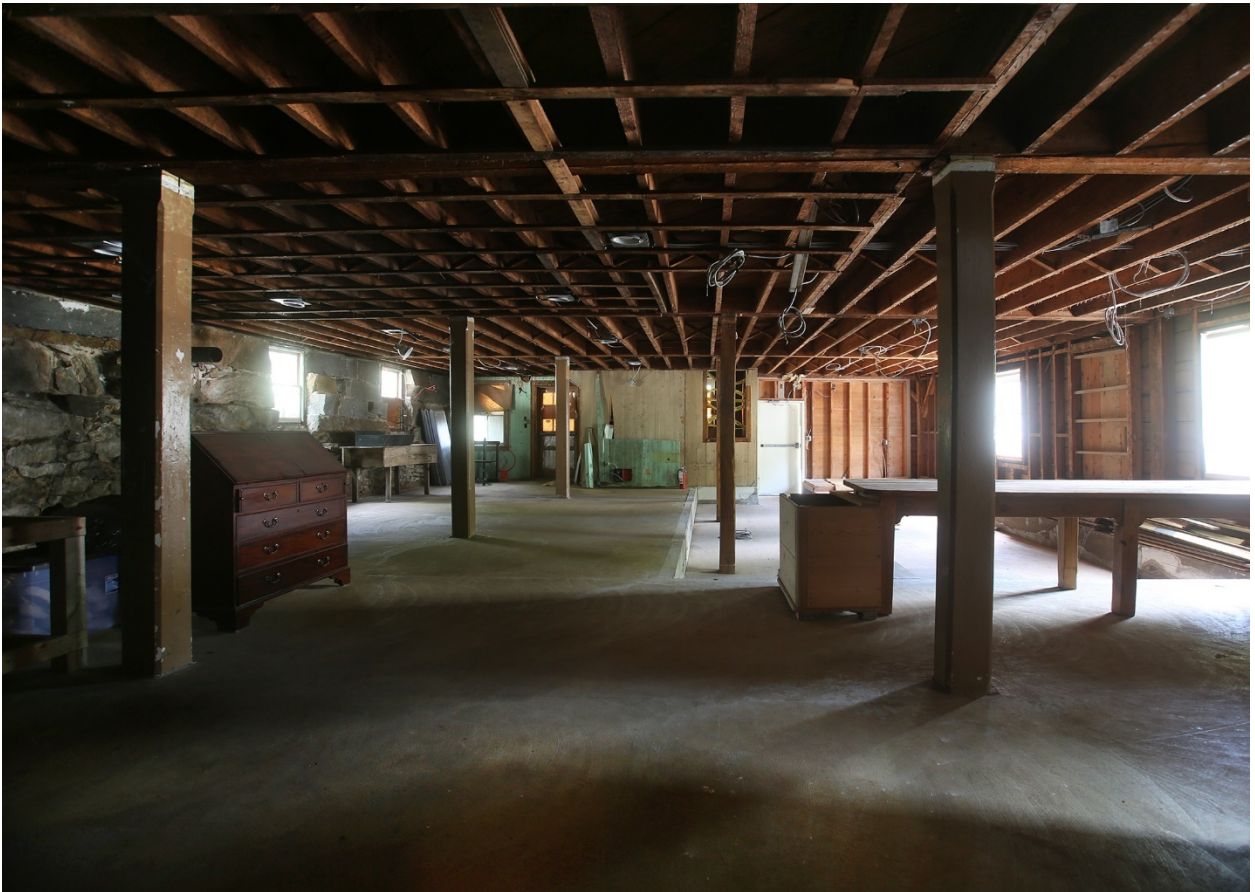
9 of 20. Lower Level from north showing excavated section for fire truck storage,