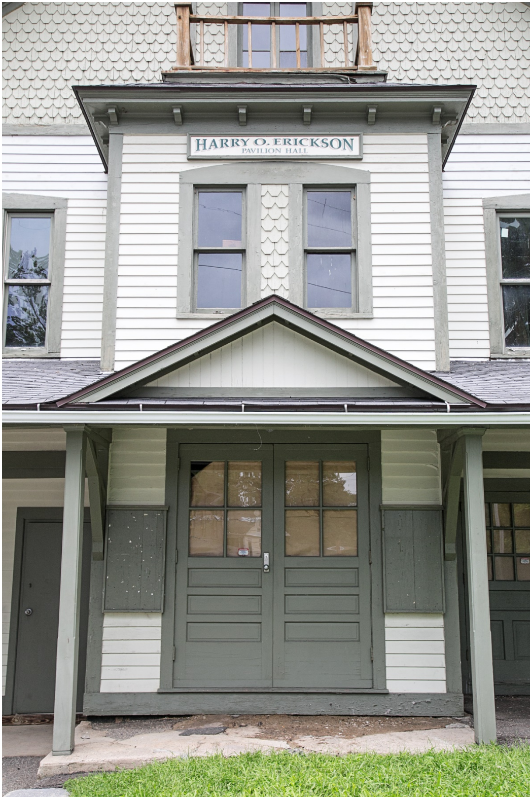
5 of 20. South middle bay entrance.