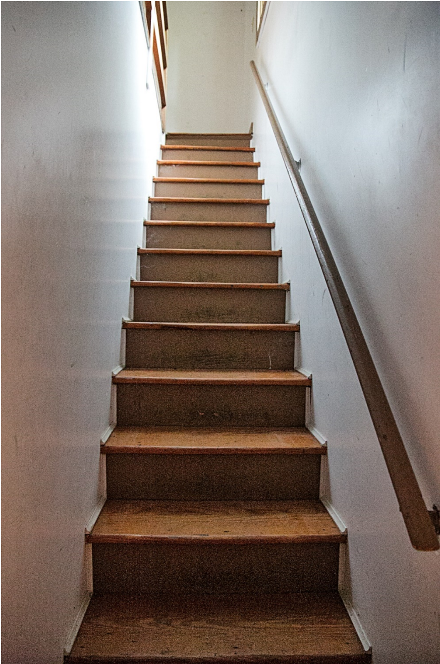
11 of 20. Lower Level stairs to stage at north end of building.