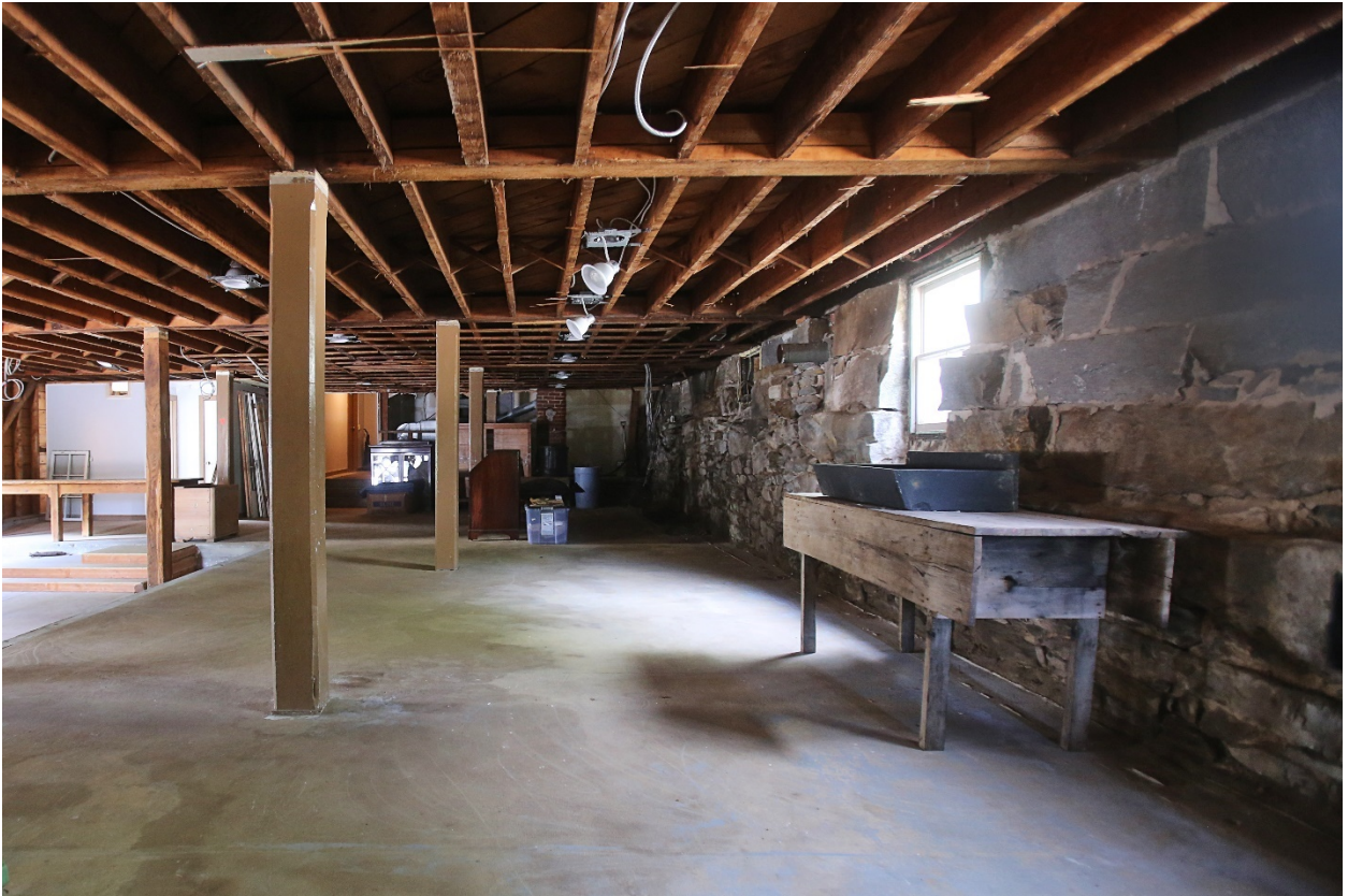
10 of 20. Lower Level showing east wall and modern doorways at south side.

concrete floor, two entrances on either side of main doors (blocked).