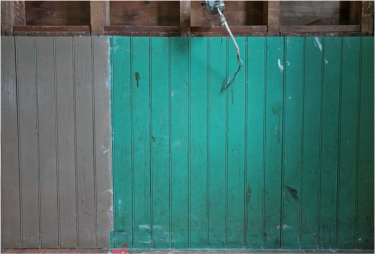
14 of 20. Upper Level - Bead board wainscoting (seen in various places throughout building).