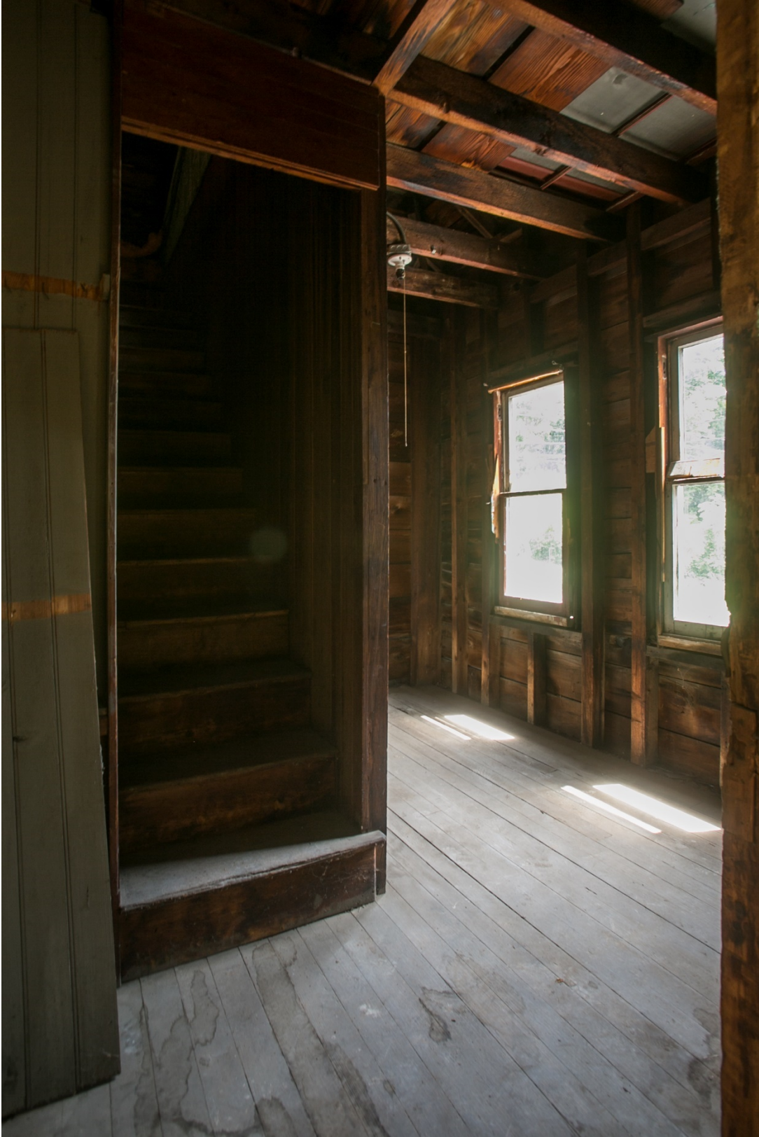
16 of 20. Upper Level - South side, small room at front of building, stairs to attic.