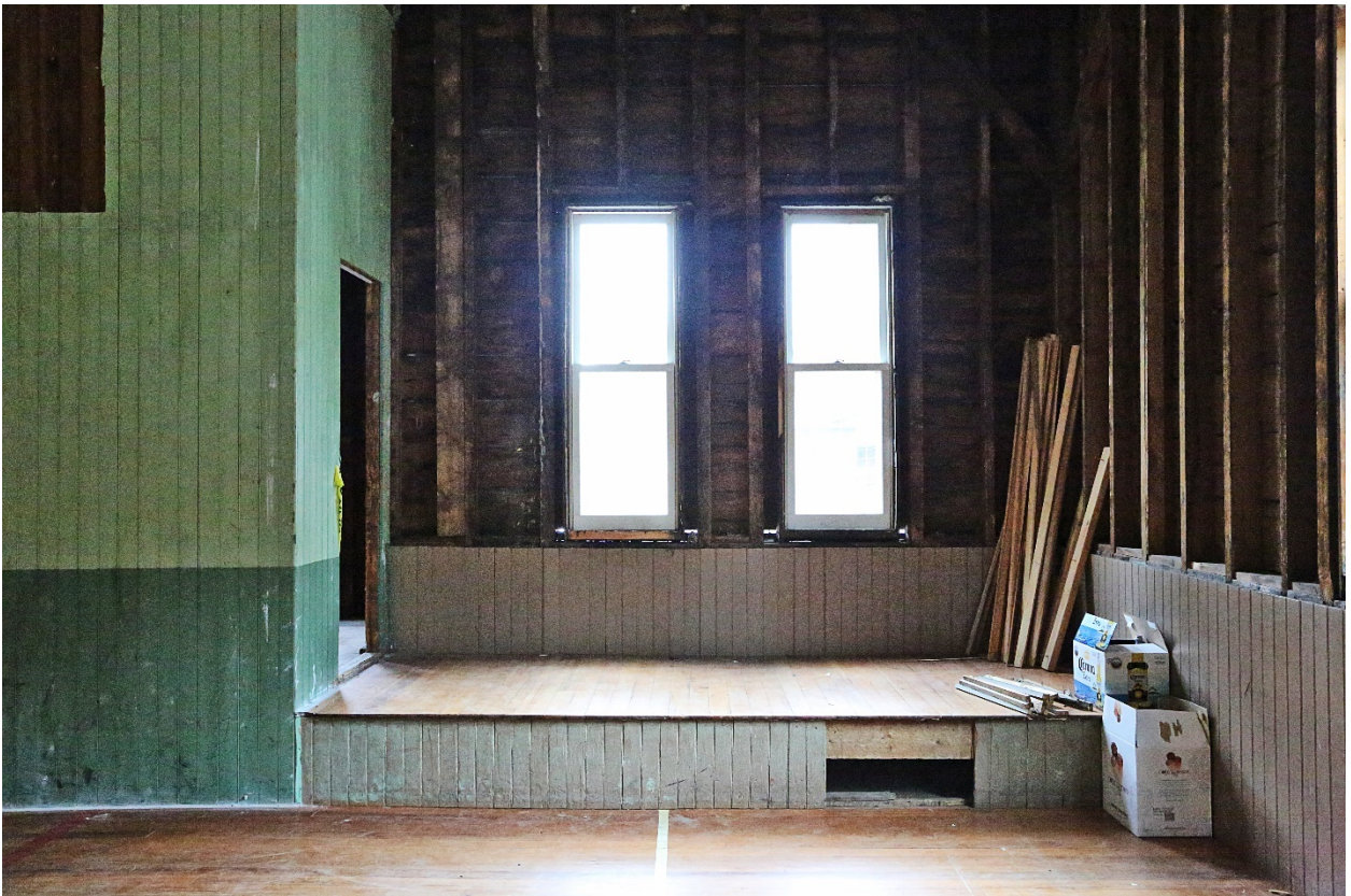
15 of 20. Upper Level - Looking south.