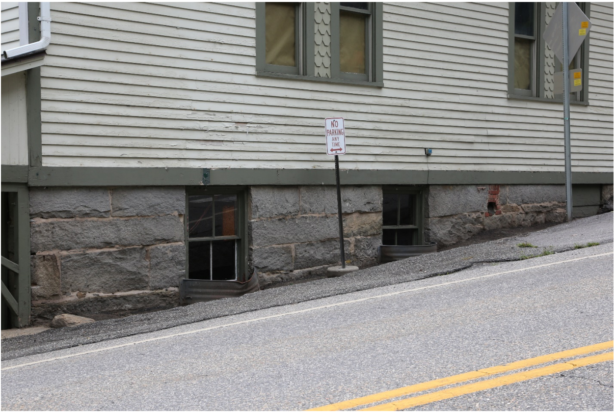
6 of 20. Detail of foundation on east elevation, view looking northwest.