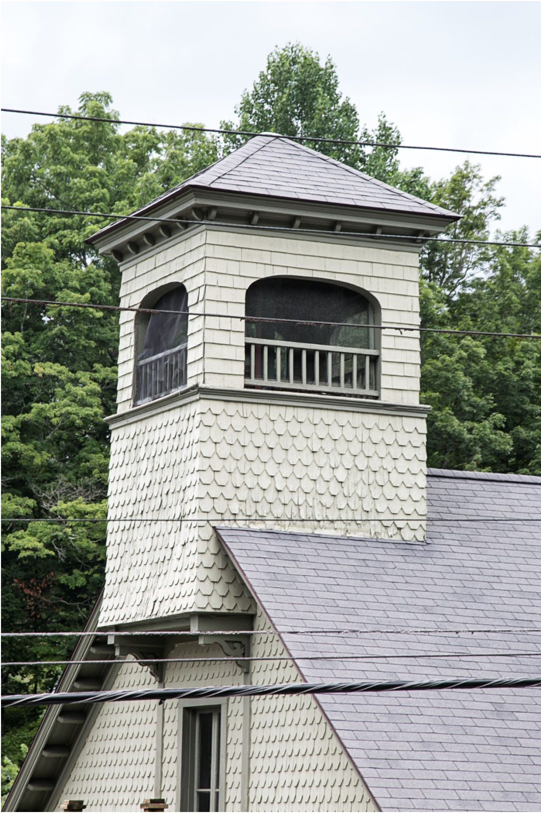
2 of 20. Bell tower detail from east.