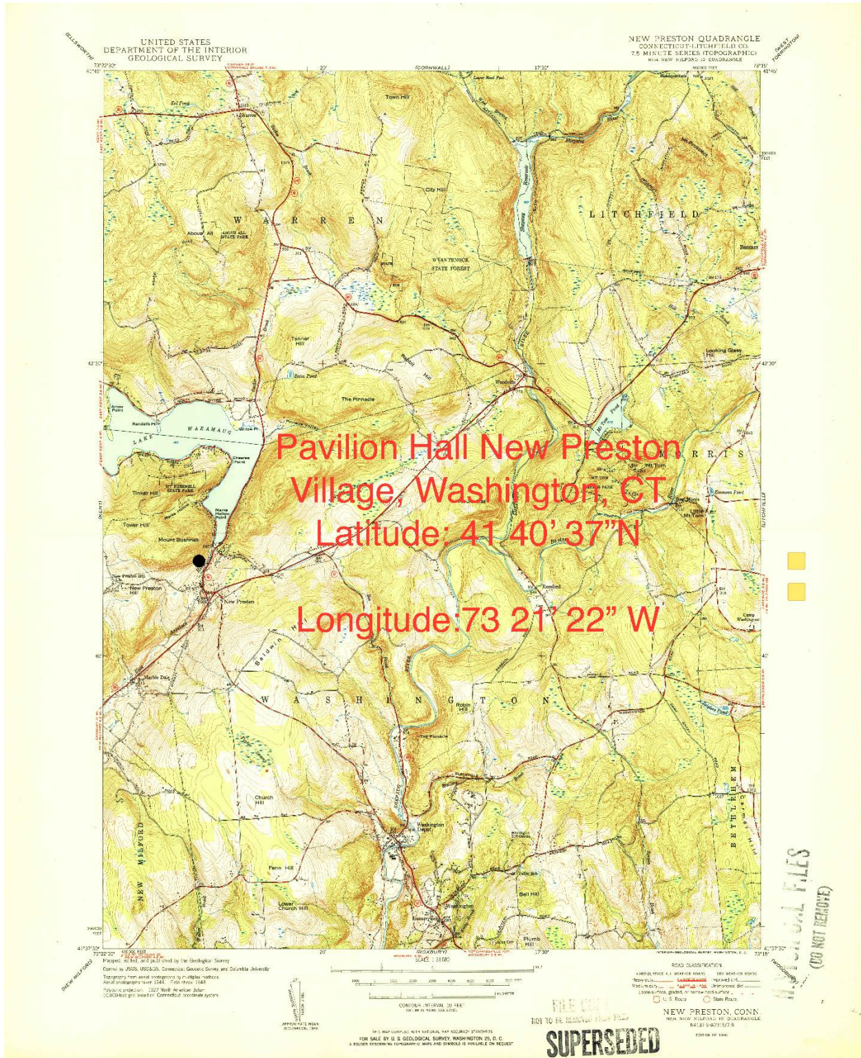
Figure 1. Location Map, Pavilion Hall, 17 East Shore Road, Washington, CT.