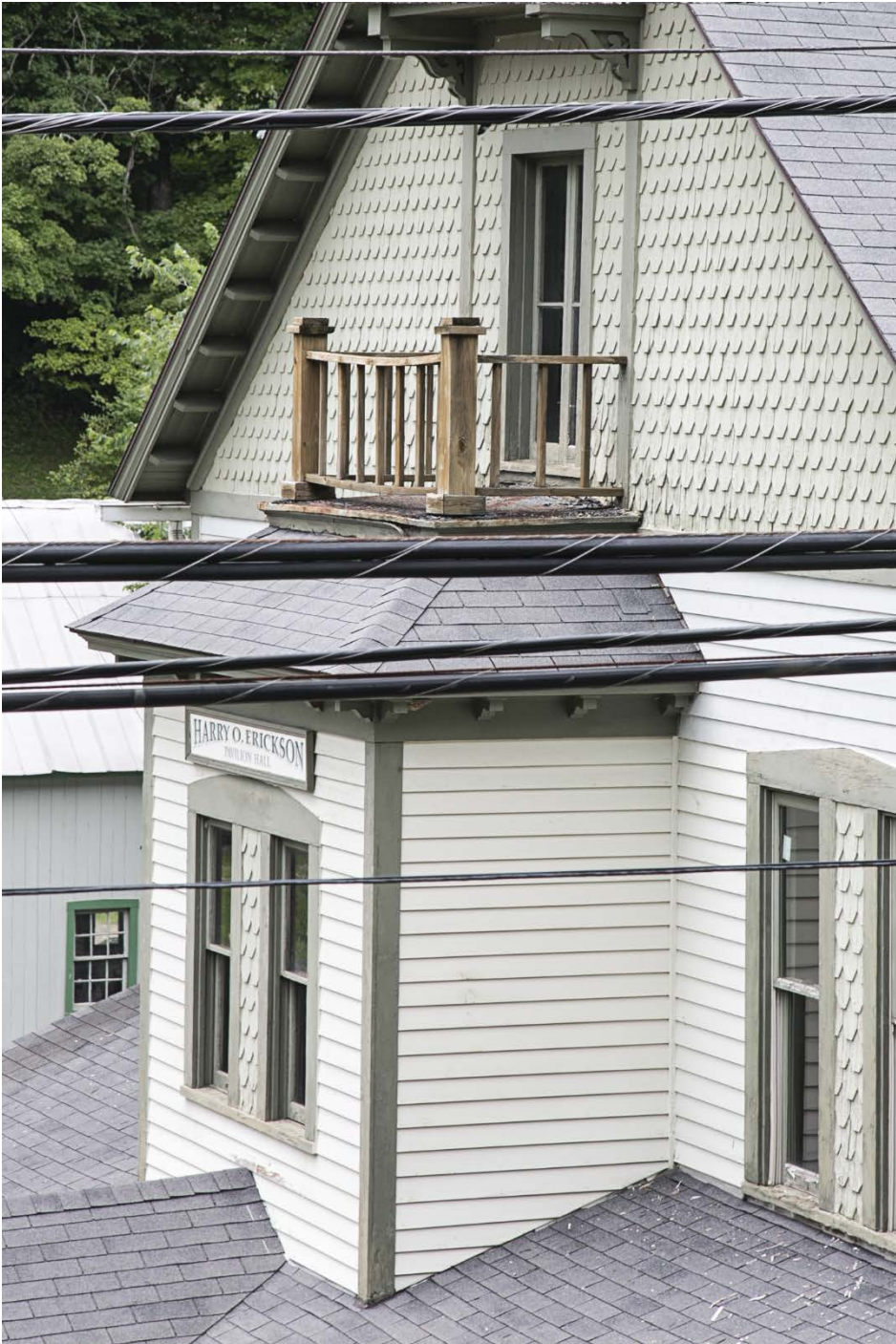
3 of 20. South middle bay and decorative balcony (modern replacement railing).