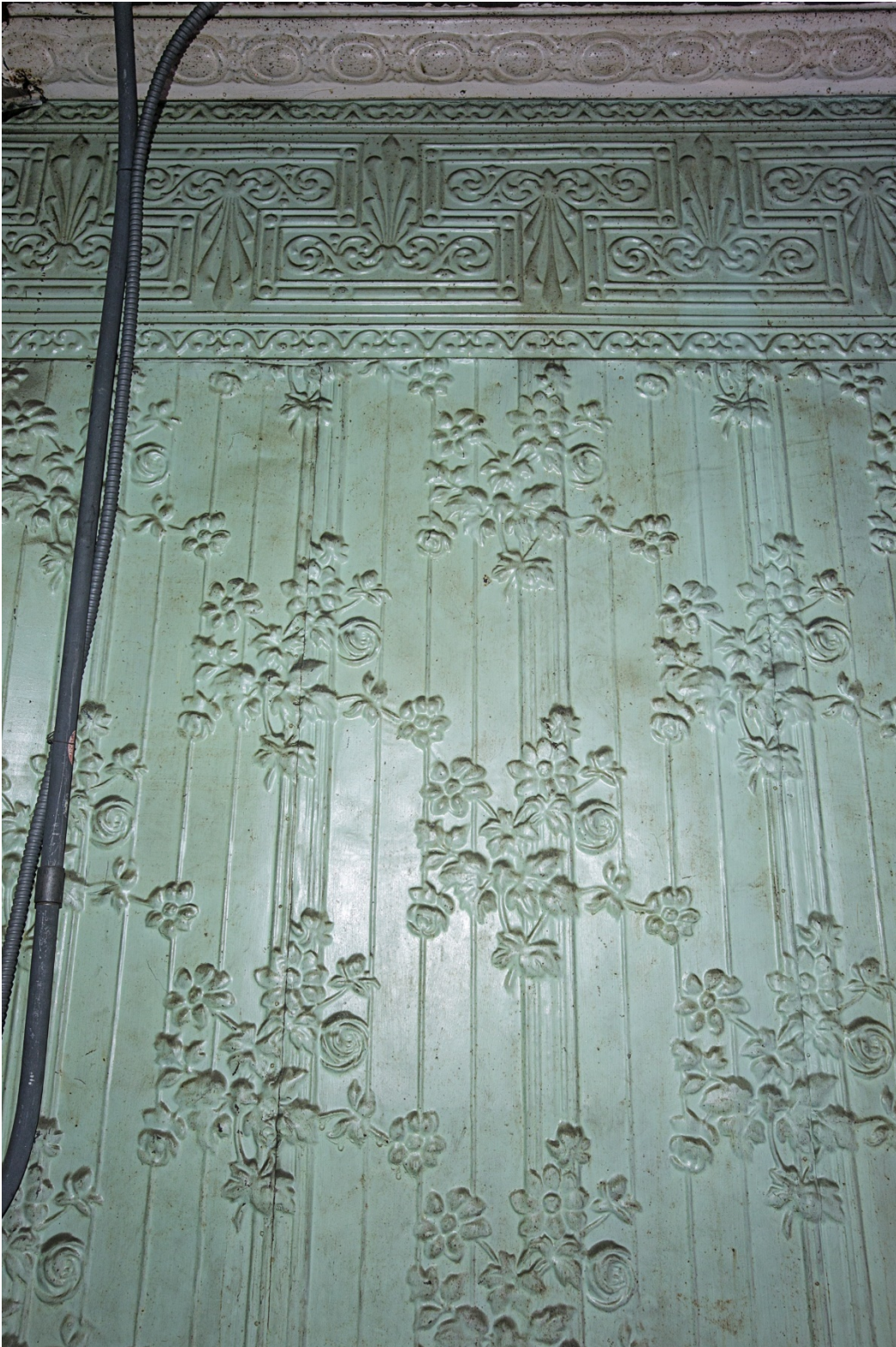
17 of 20. Attic Level - Original tin sheathing.