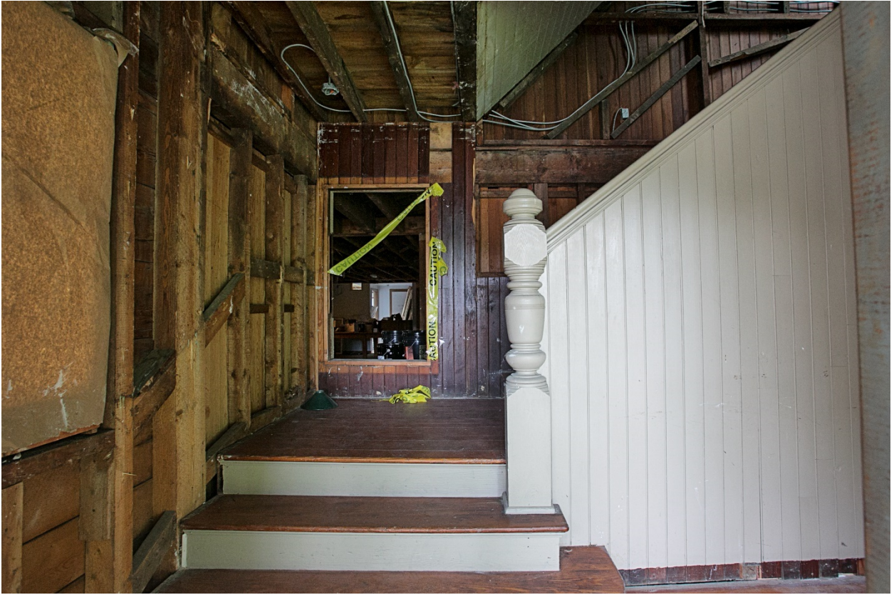
19 of 20. Main Stairway from Lower Level, South side of building.