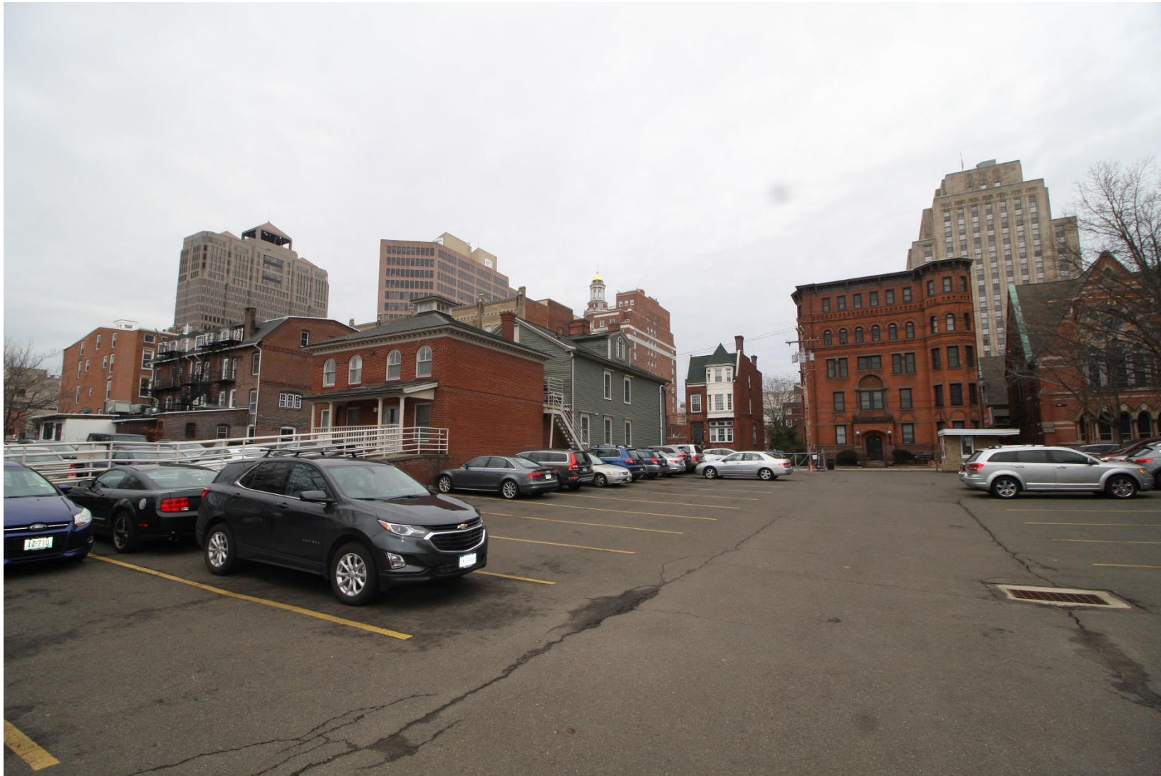
Looking northwest across the proposed site for the Pinto House. It will be located near where the parking lot attendant's booth is located. (1/15/2020)