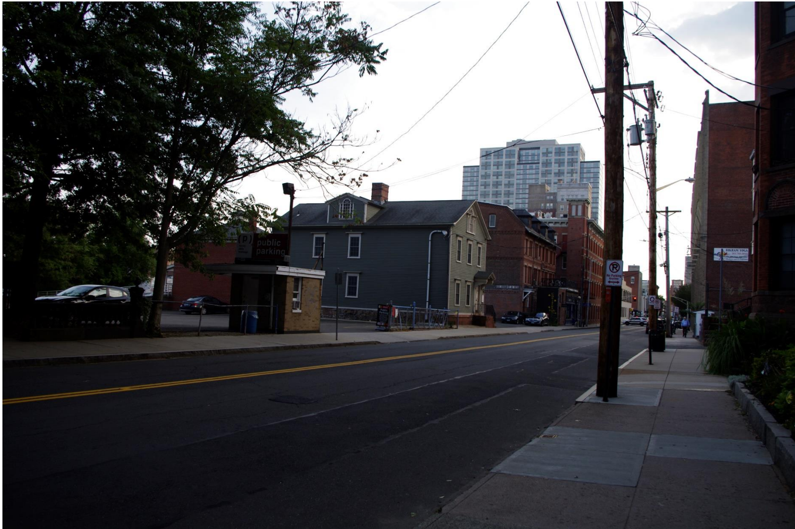
Looking south across the proposed site for the Pinto House from Orange Street. (9/11/2019)