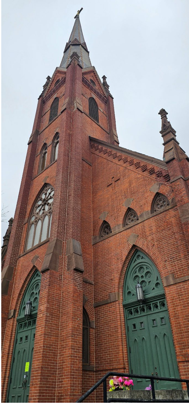
St. Peter's Church, 98 Franklin Square, New Britain, camera facing northeast, March 5, 2025.