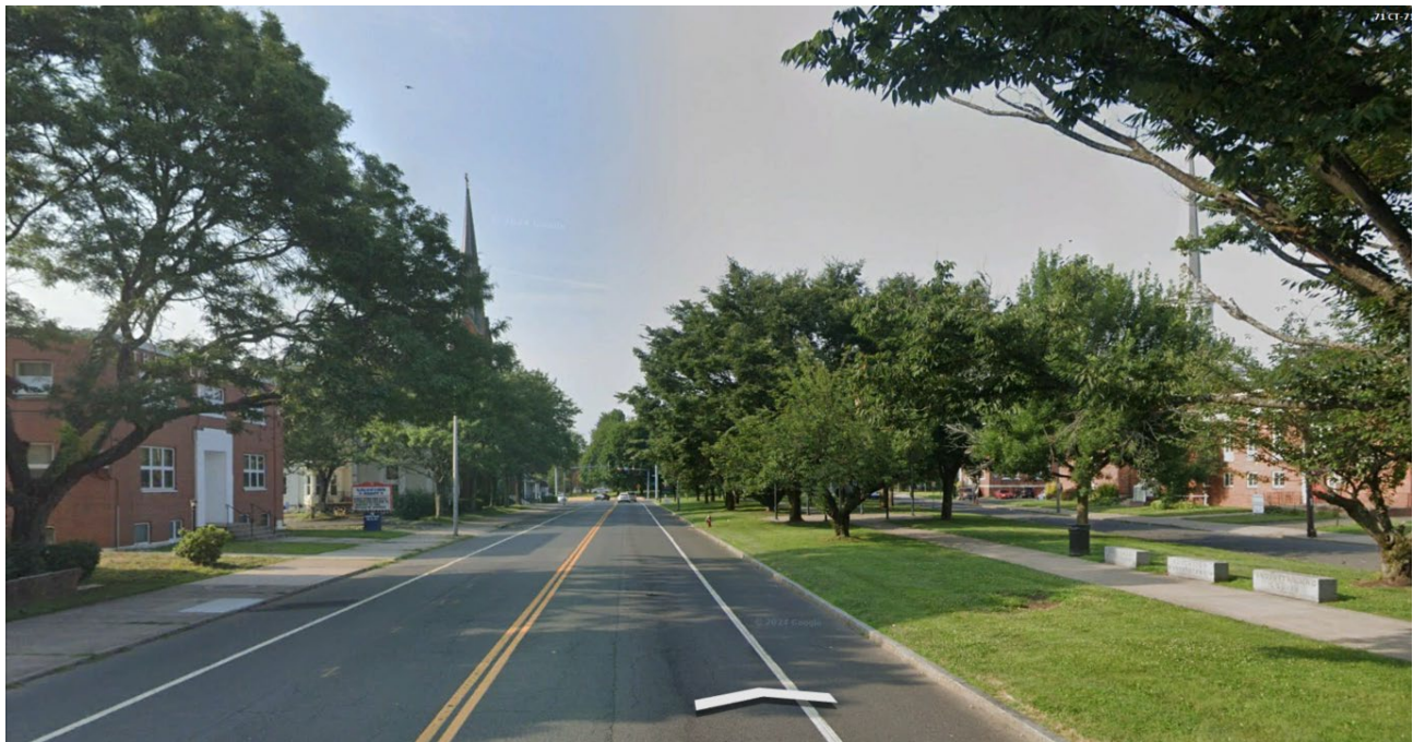
Franklin Square, New Britain, view looking south. St. Peter's Church to the left (partially obscured). Google Earth , July, 2024.