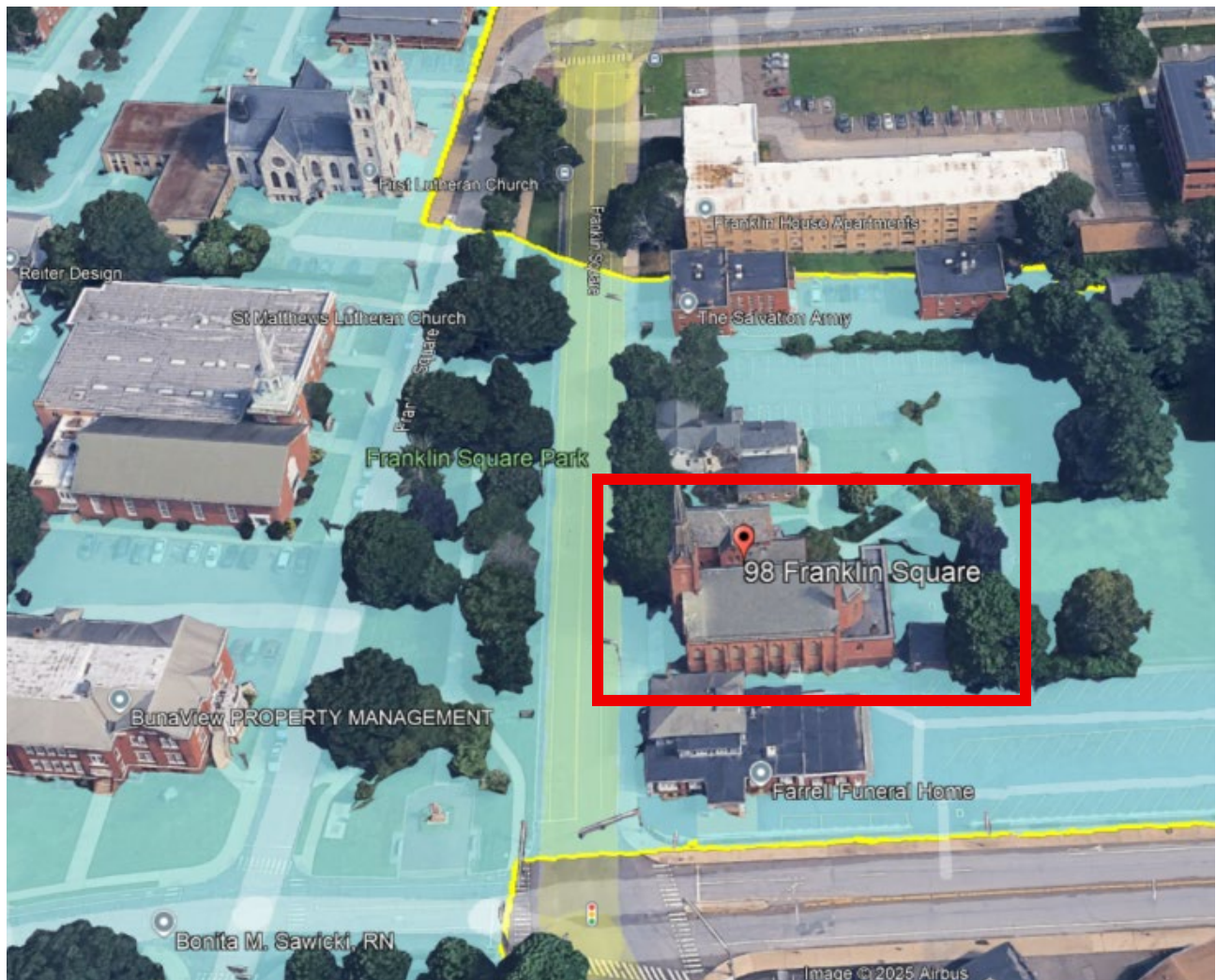
Location of 98 Franklin Square, St. Peter's Church, outlined in red.