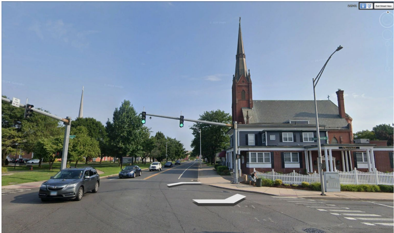
Franklin Square, New Britain, view looking north. St. Peter's Church to the right. Google Earth , July, 2024.