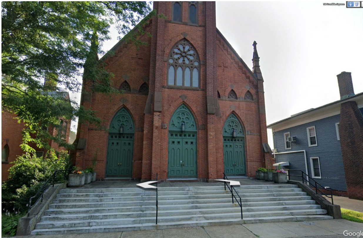
St. Peter's Church, 98 Franklin Square, New Britain, camera facing east, google Earth , July 2024.