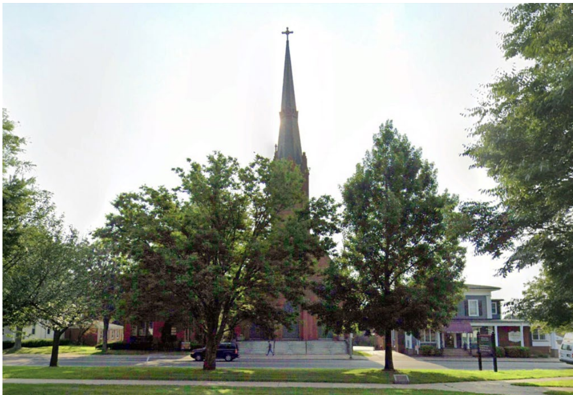
St. Peter's Church, 98 Franklin Square, New Britain, camera facing east, google Earth , July 2024.