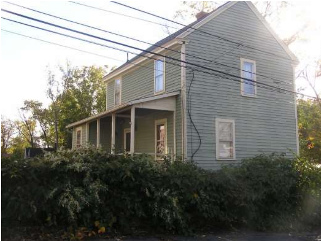
2283-2289 Main Street Rear, camera facing southwest (October 2021).