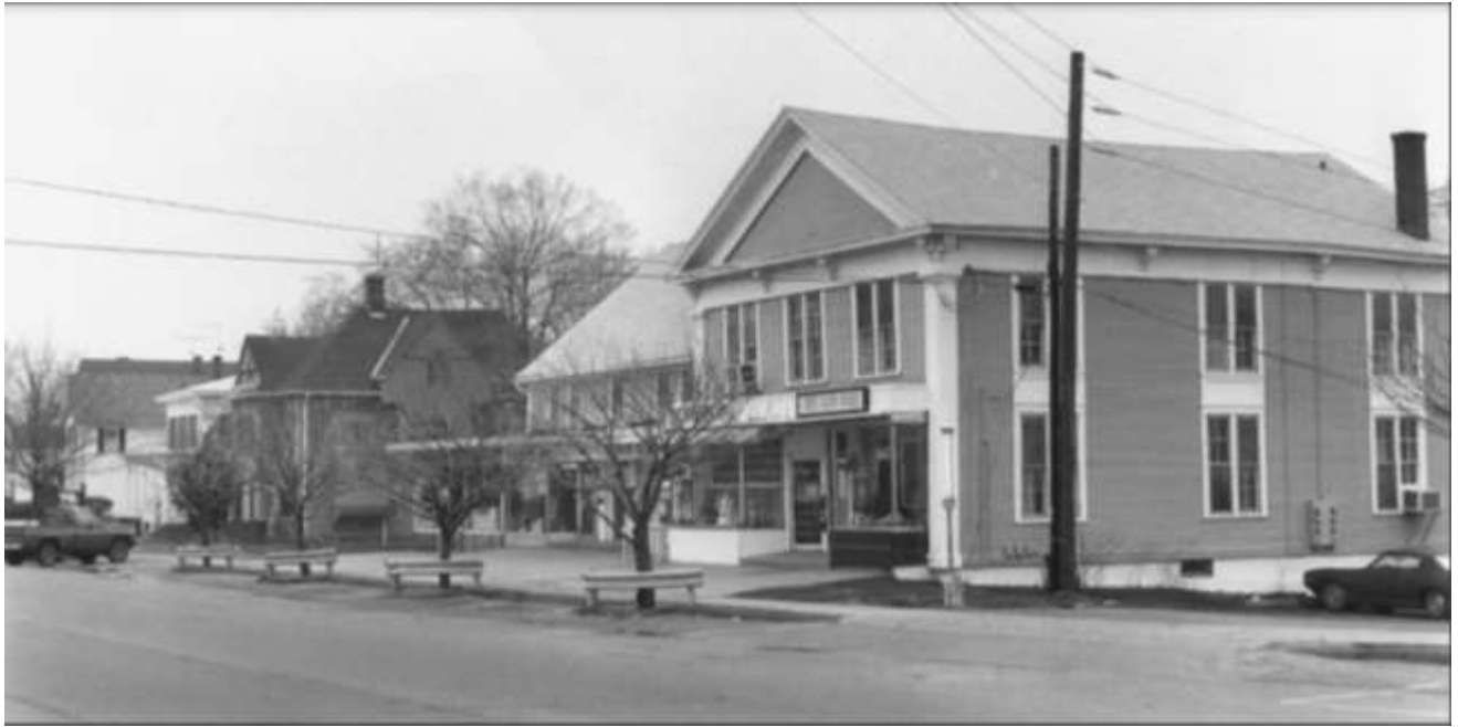
National Register photo of 2283-2289 Main Street (identified as 2281-2289 Main Street). March 1983.