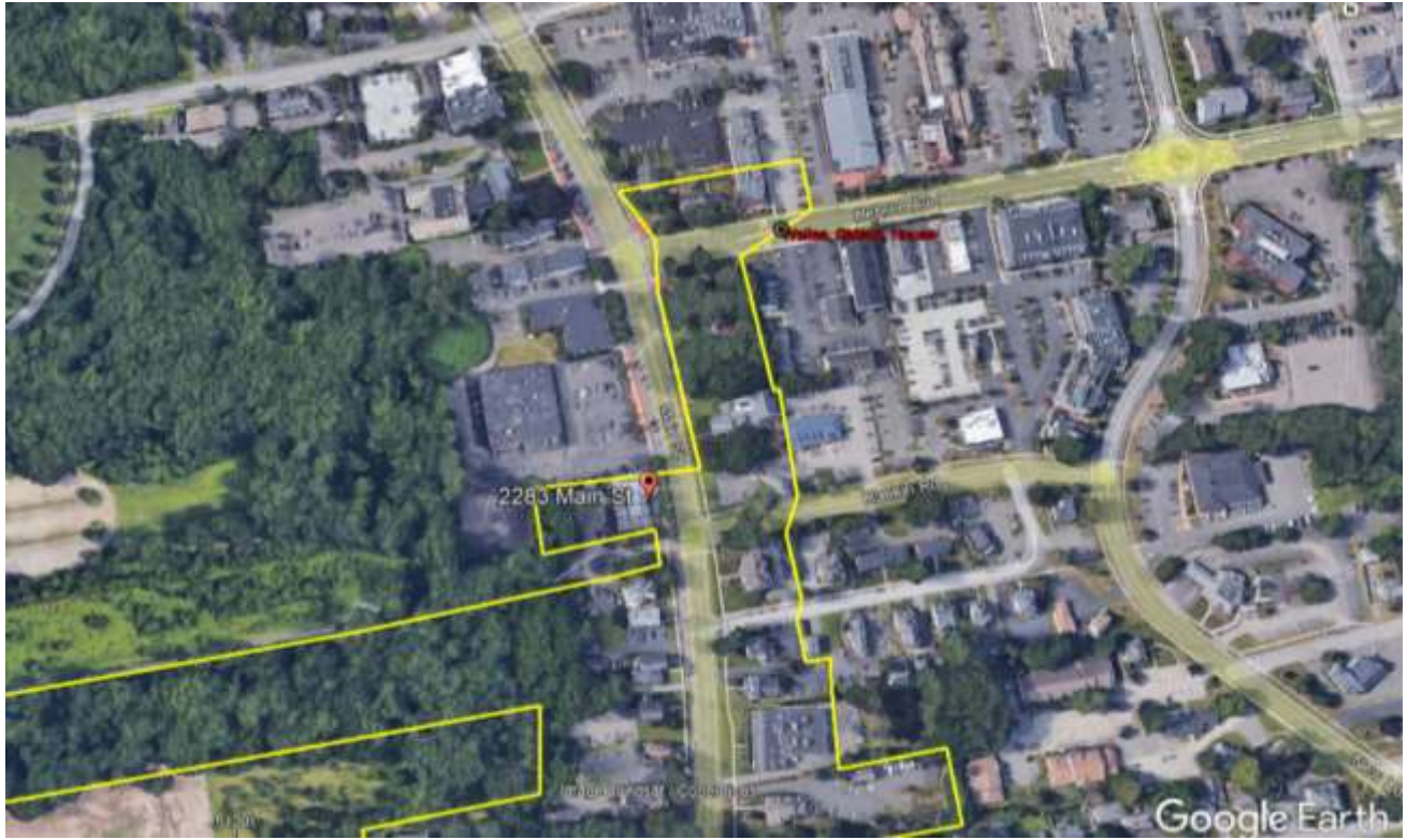
Detail of National Register district boundary, showing location of 2283 Main Street at Northwest end of district.