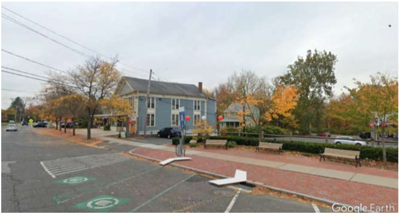
Main Street with 2283-2289 main street to the right, facing southwest (google earth, 10/2020).