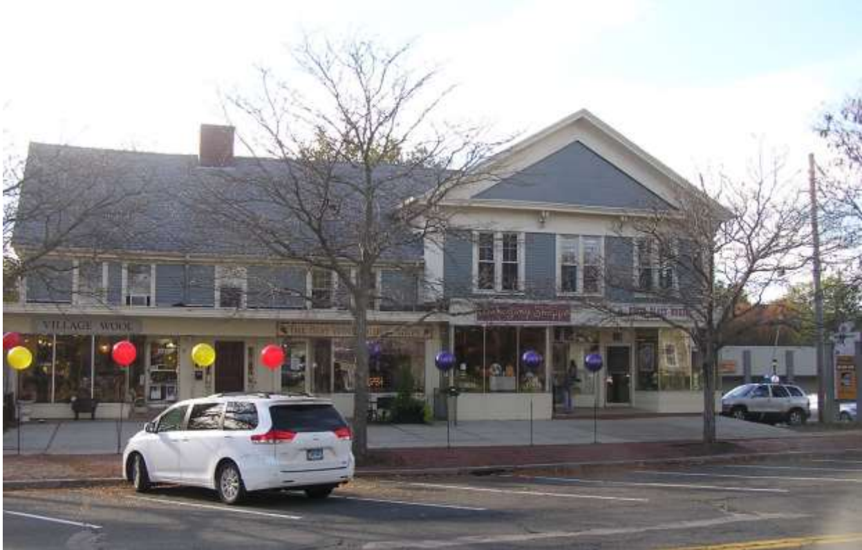
2283-2289 Main Street, facing west (October 2021).