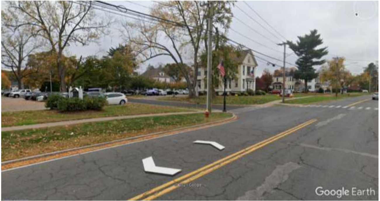
Main Street looking from 2283-2289 Main Street, facing southeast (google earth, 10/2020).