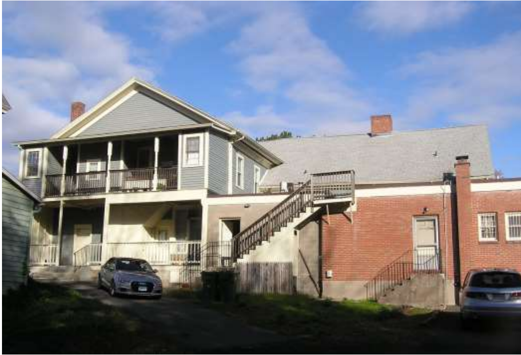
Rear elevations of 2283-89 Main Street, camera facing east October 2021).