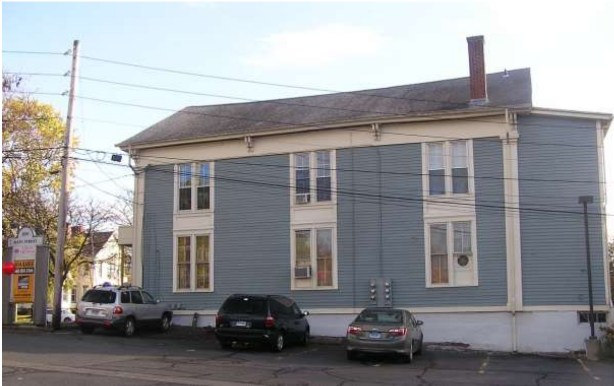
North elevation of 2283-89 Main Street, camera facing south (October 2021).