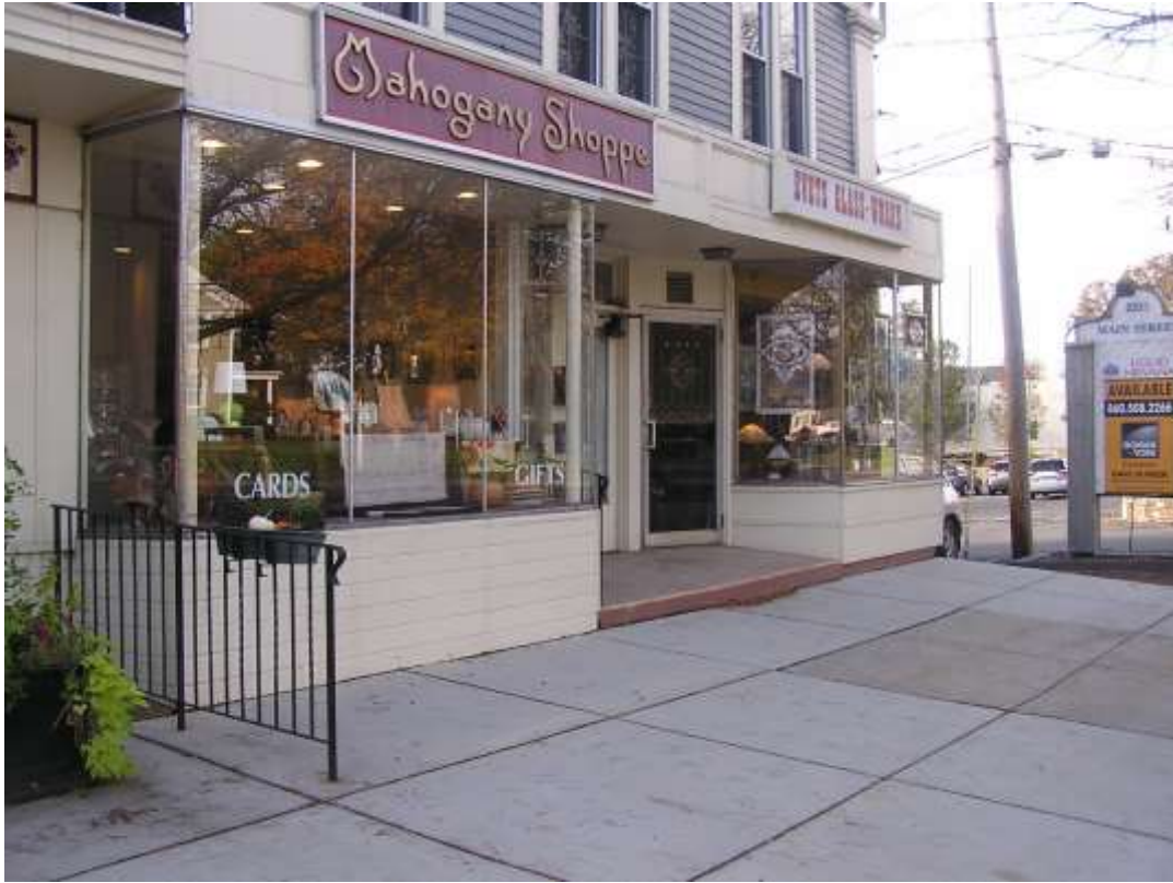
Active store fronts of 2283-2289 Main Street. Upper floor appeared vacant (October 2021).