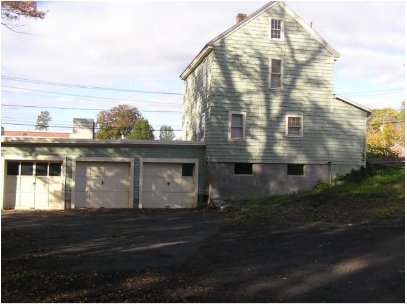
South elevation of 2283-2289 Main Street Rear, camera facing north (October 2021).