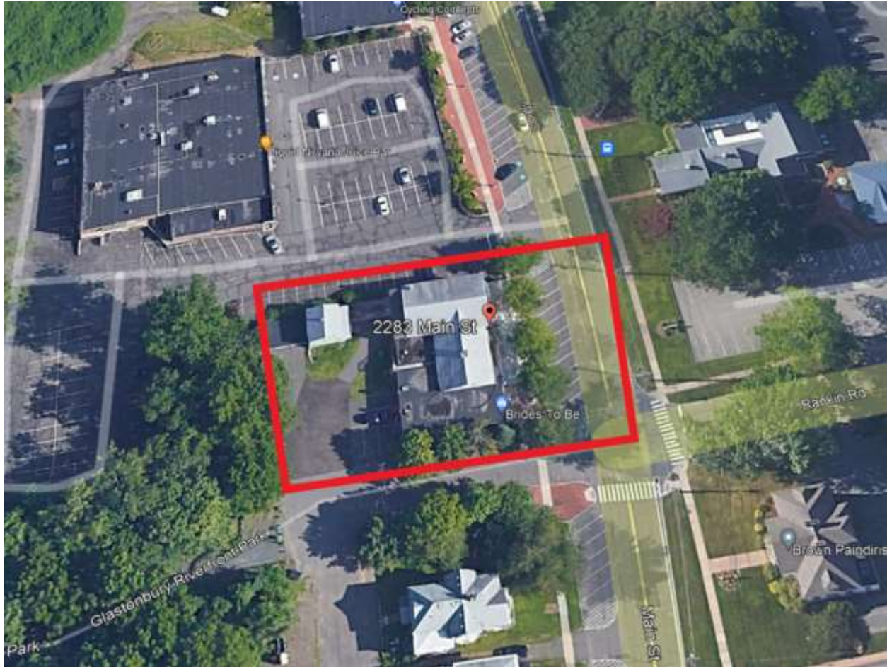
Location of 2283-2289 Main Street and 2283-2289 Main Street Rear, outlined in red (google earth, 7/4/2019).