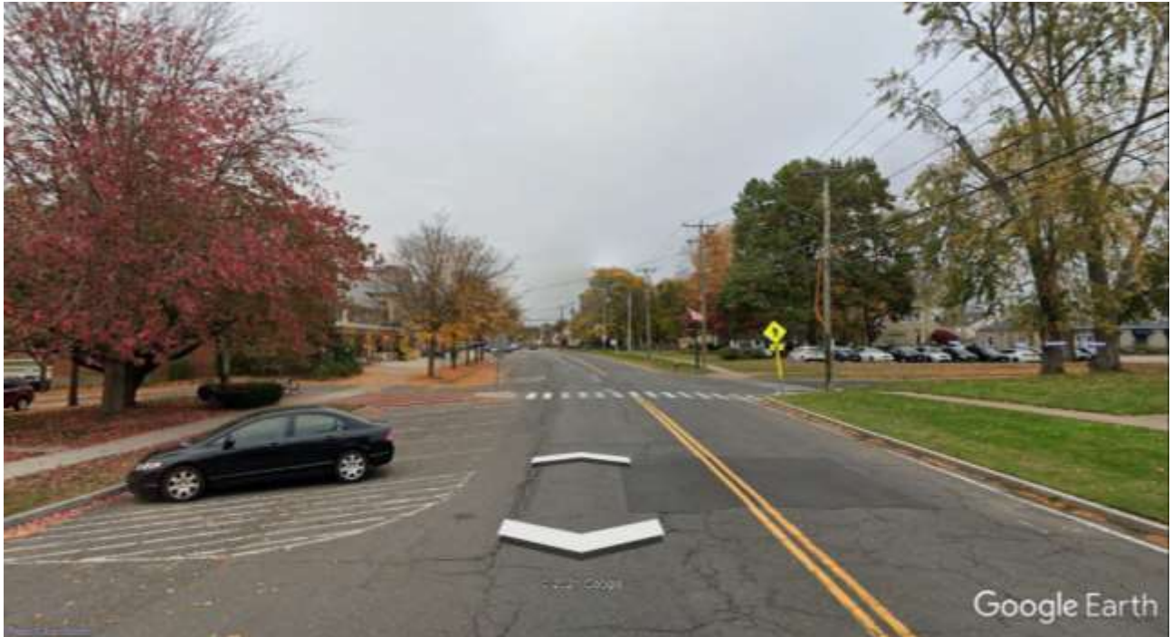
Main Street looking north, 2283-2289 Main Street in the upper left.