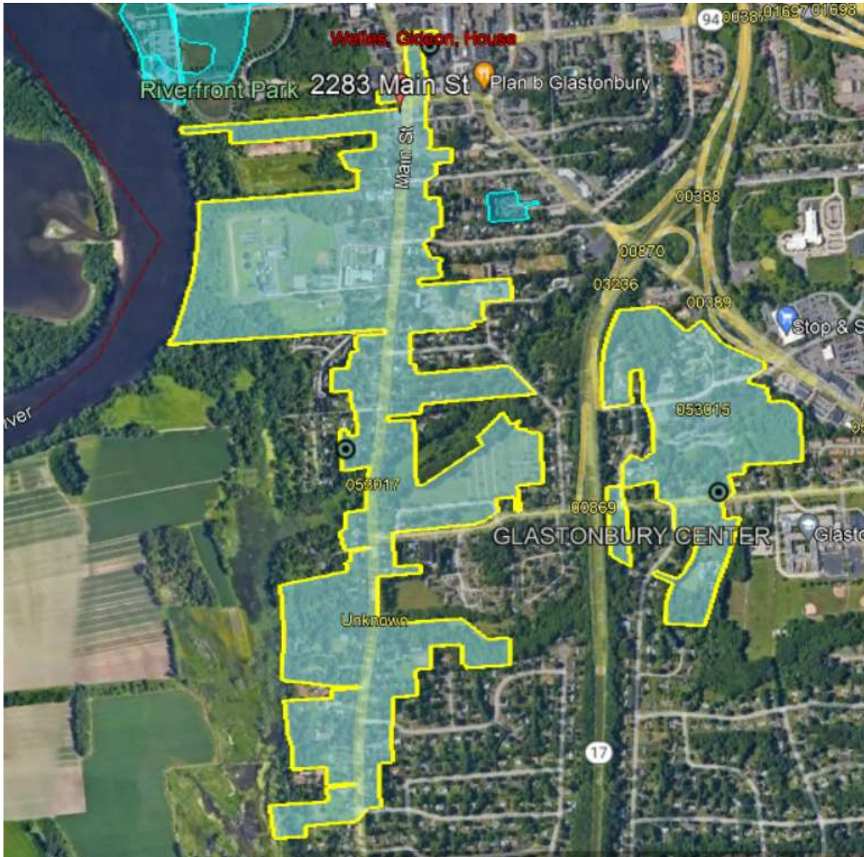
Location of 2283-2289 Main Street and 2283-2289 Main Street Rear, Glastonbury, within the Glastonbury National Register Historic District, map oriented north (google earth, 7/4/2019). National Register boundary shown in yellow.