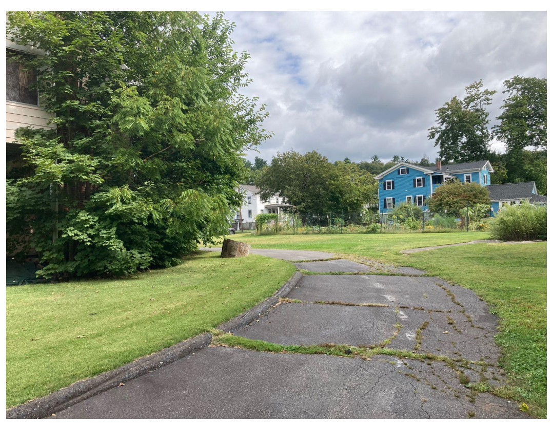
View east along driveway.