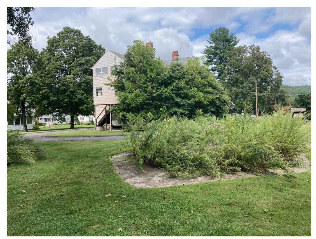
View east from rear of lot toward overgrown swimming pool.