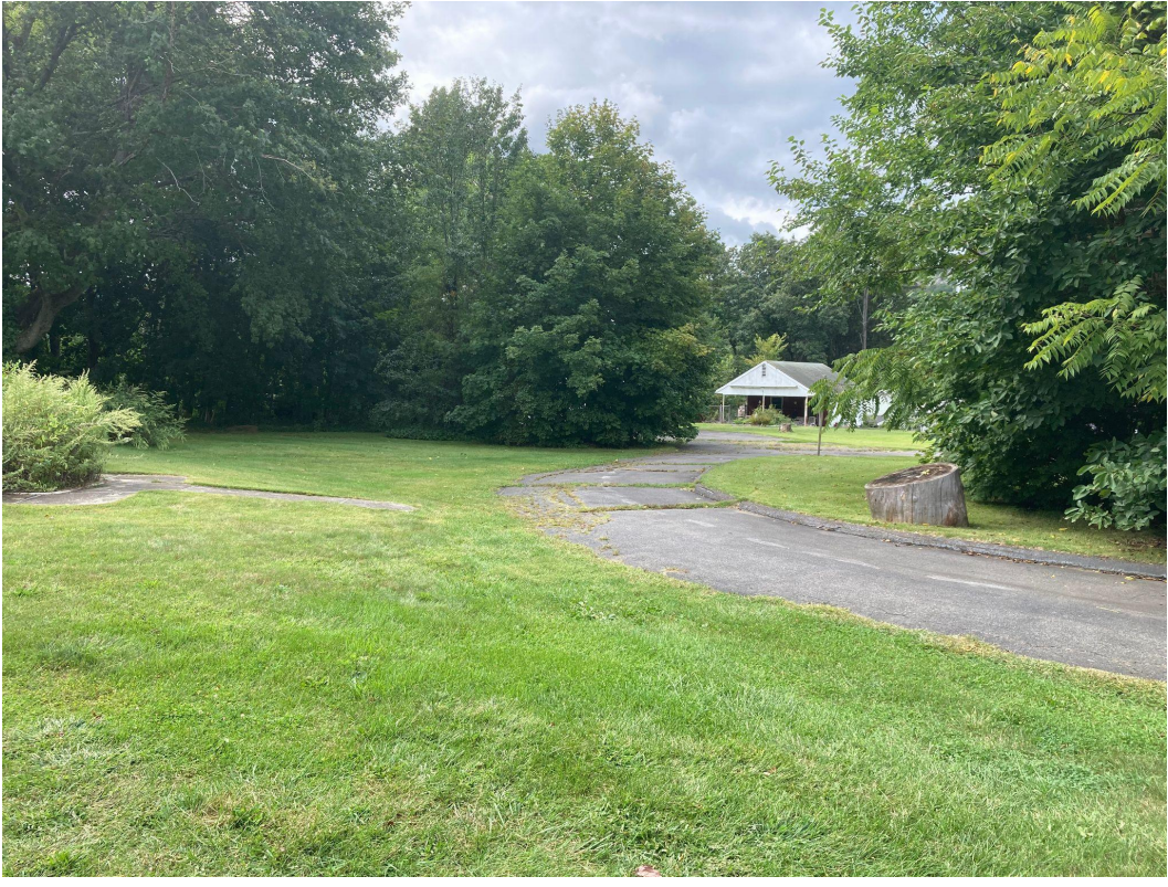
View northwest along rear driveway toward garage.

CONTINUATION SHEET Tracey S. Lewis House (#06371) / 37 Wolfe Avenue, Beacon Falls