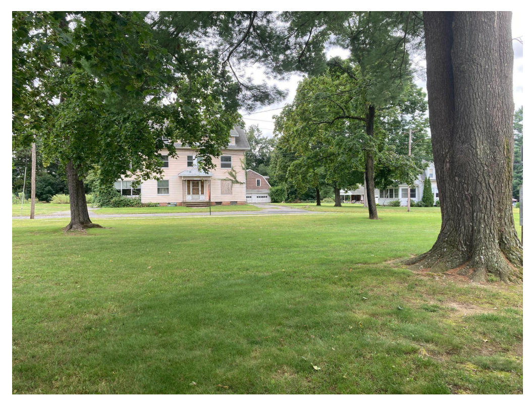
View southwest to Tracy Lewis House from park.