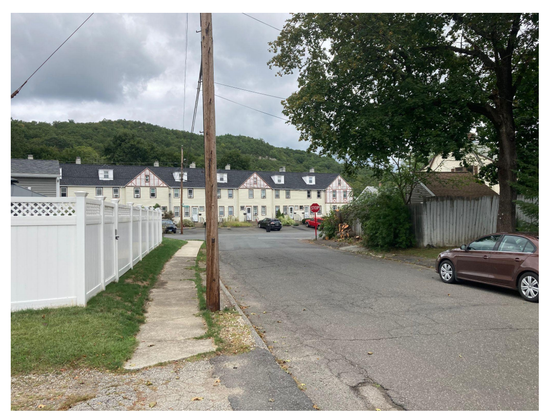
View north along North Circle.