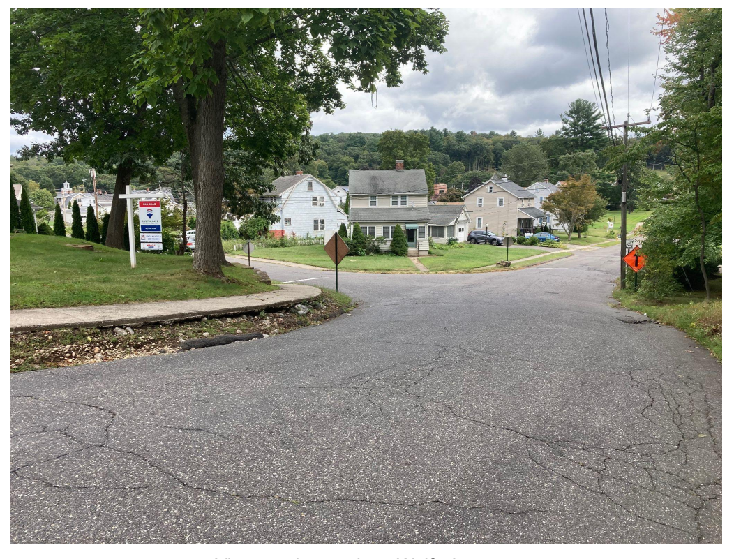
View southeast along Wolfe Avenue.