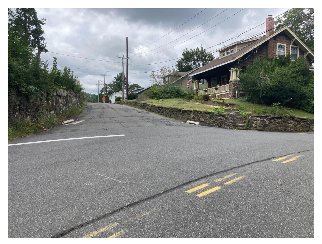
View west along Wolfe Avenue from intersection at Burton Road.