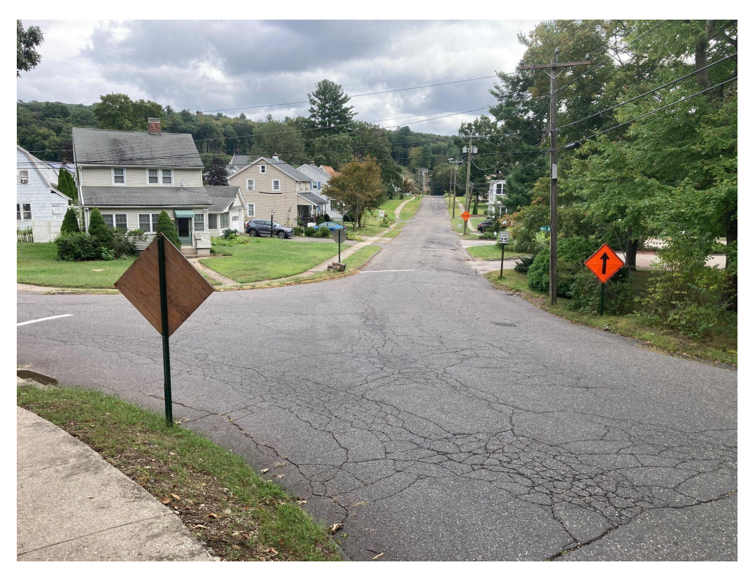
View north along North Circle.