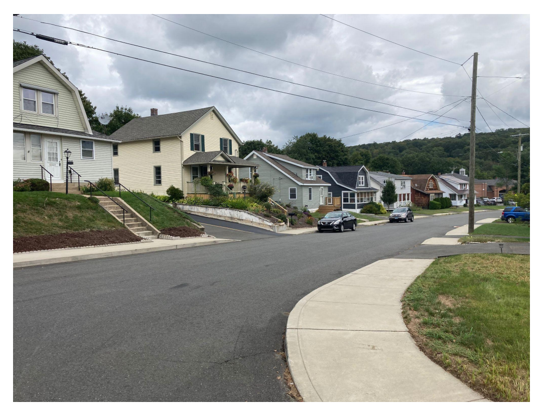
View east along Highland Avenue.