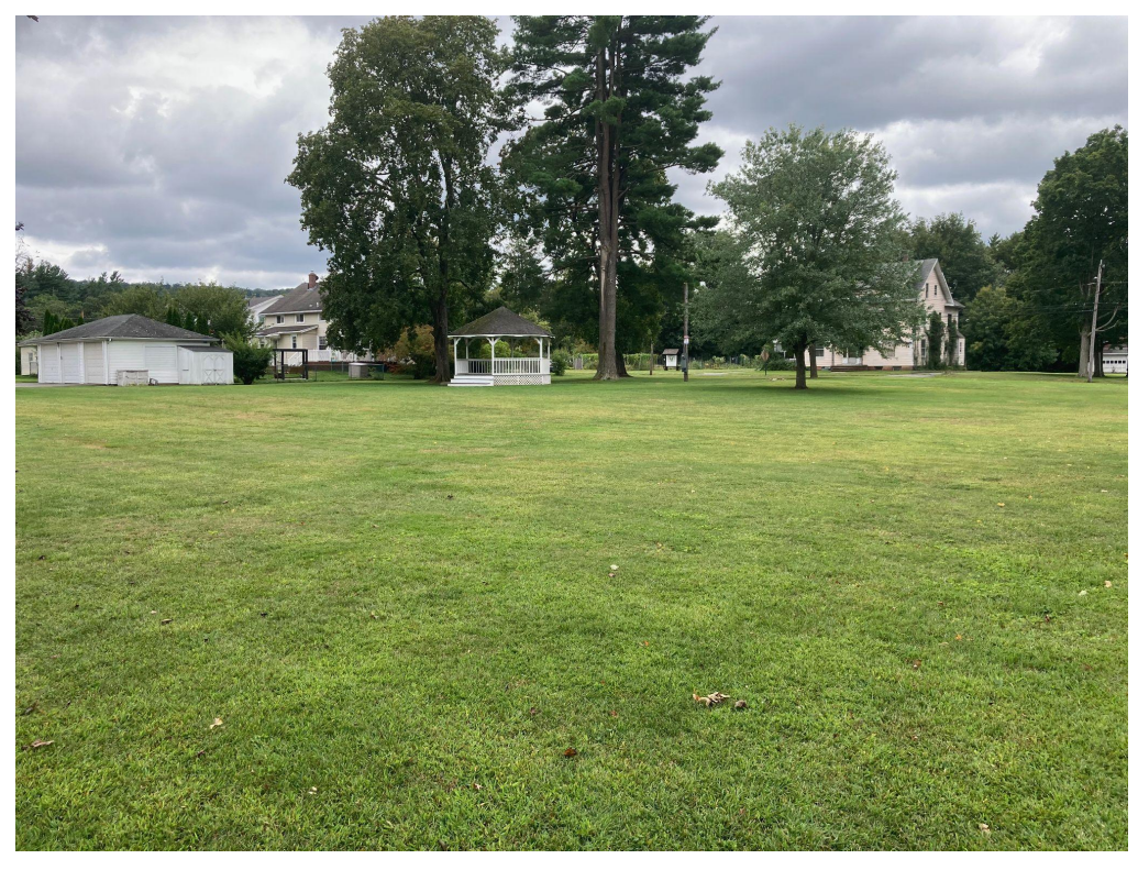
View south into park area from Maple Avenue.