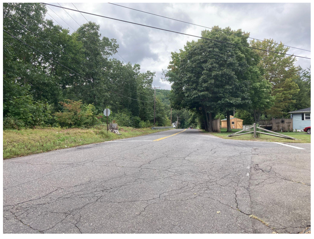
View from Wolfe Avenue.