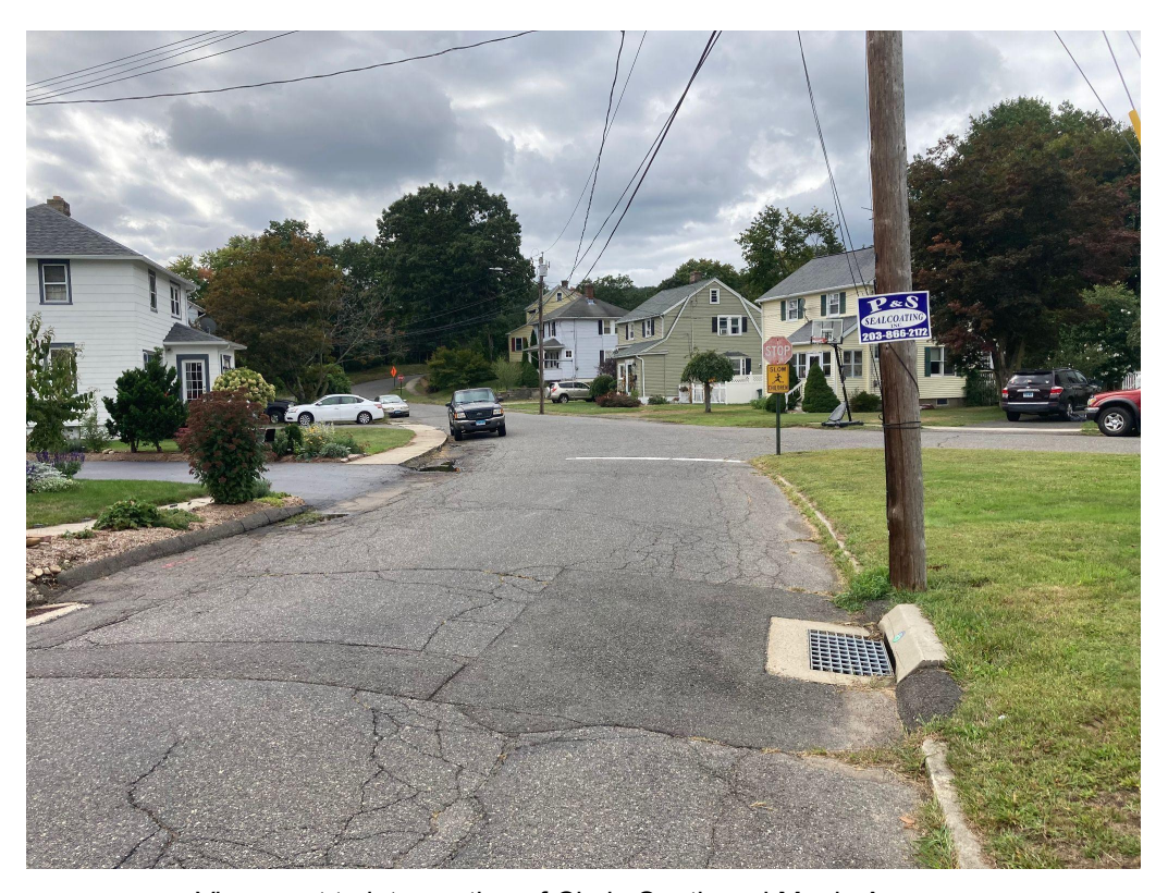
View west to intersection of Circle South and Maple Avenue.