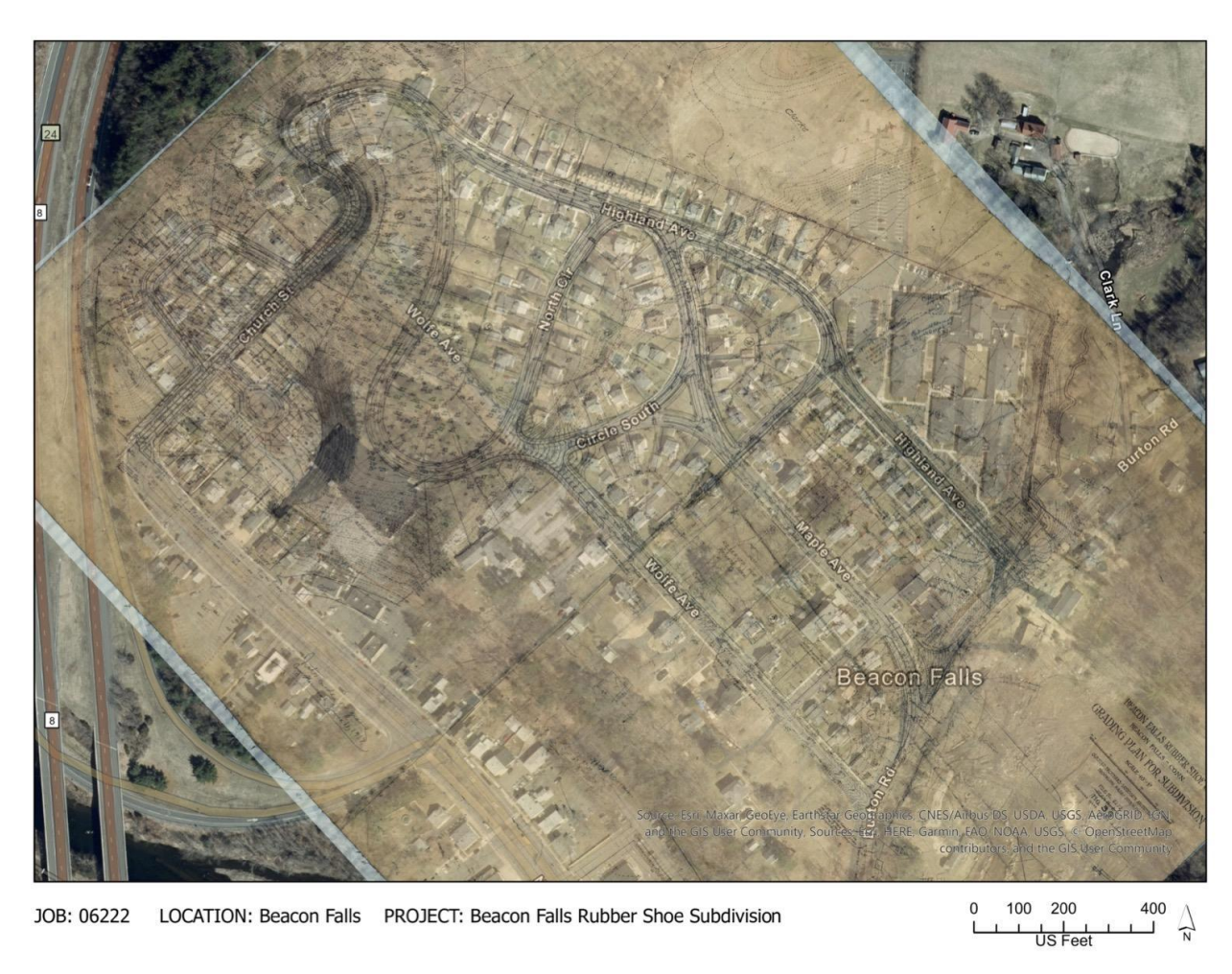
Aerial photograph overlaid with Olmsted firm plan.