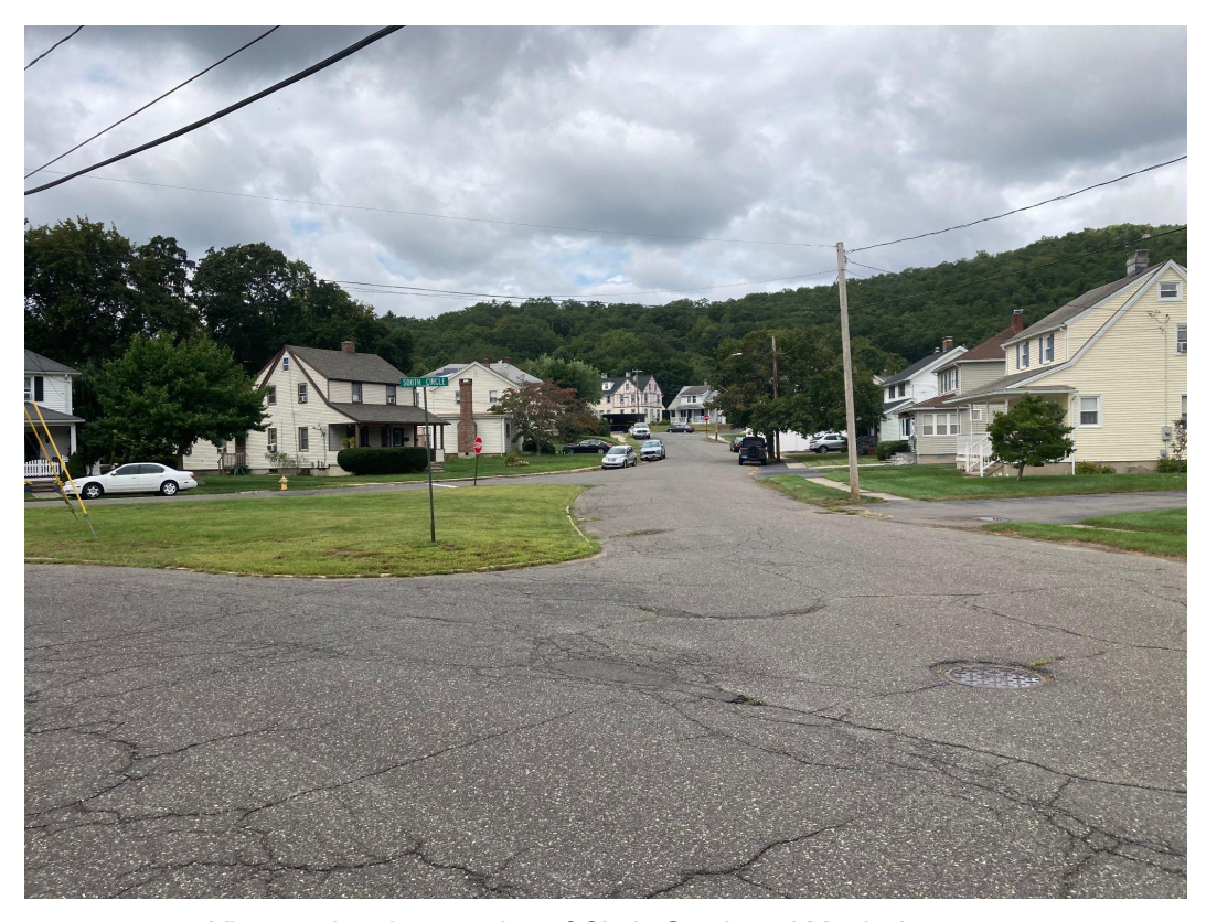
View north to intersection of Circle South and Maple Avenue.