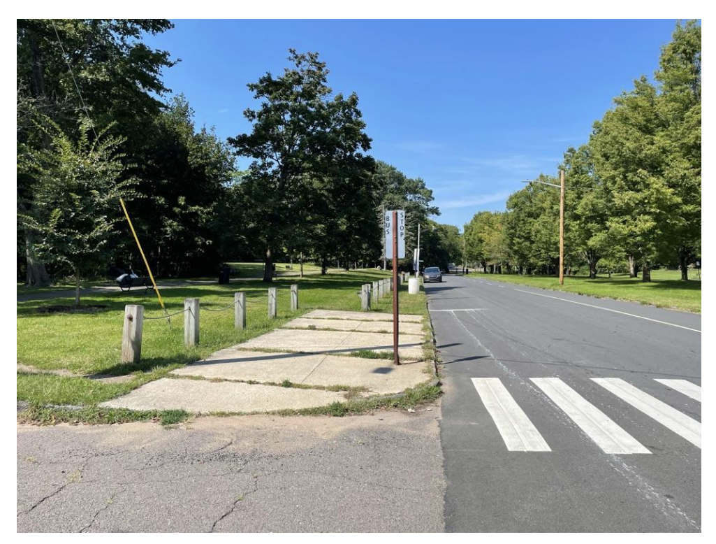
View looking northwest along the south side of Edgewood Avenue and Edgewood Park at Hobart Street. (All photographs taken by the author in 2021 unless otherwise noted)