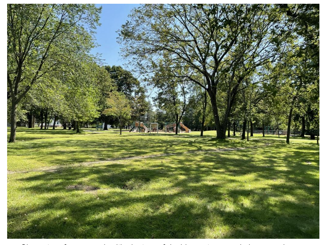
Character of upper park with clusters of deciduous trees and playground area.

Wooden steps to accommodate pedestrians who want to circle back to upper park near Hobart Street.