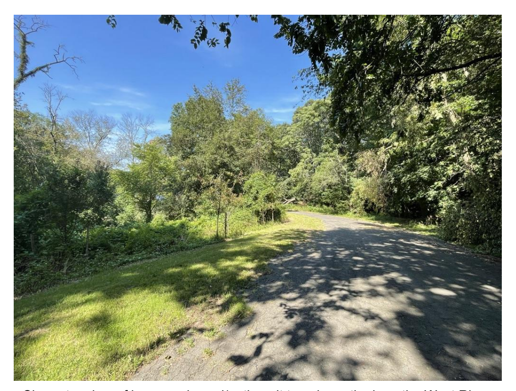
Character view of lower park road/path as it travels north along the West River.