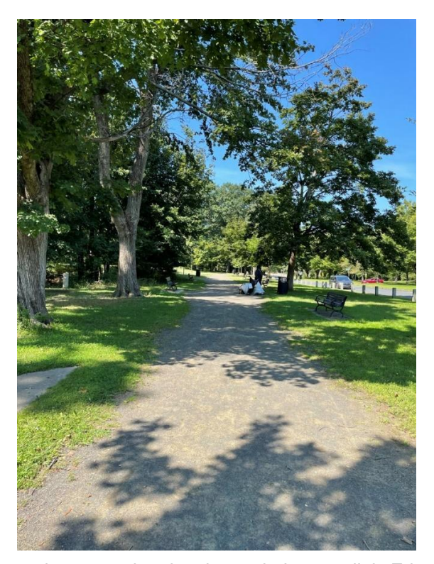
View looking west along gravel pedestrian path that parallels Edgewood Avenue.