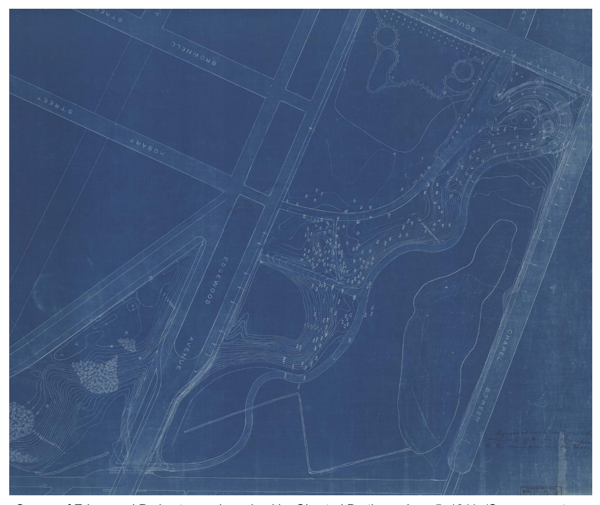
Survey of Edgewood Park, stamped received by Olmsted Brothers, June 5, 1911.