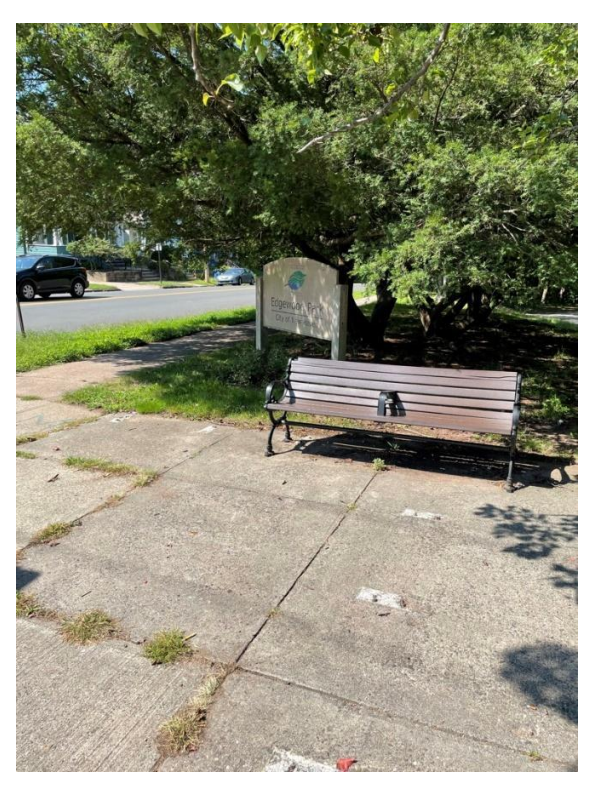
Park entrance at Ella T Grasso Boulevard with sign and typical park bench.