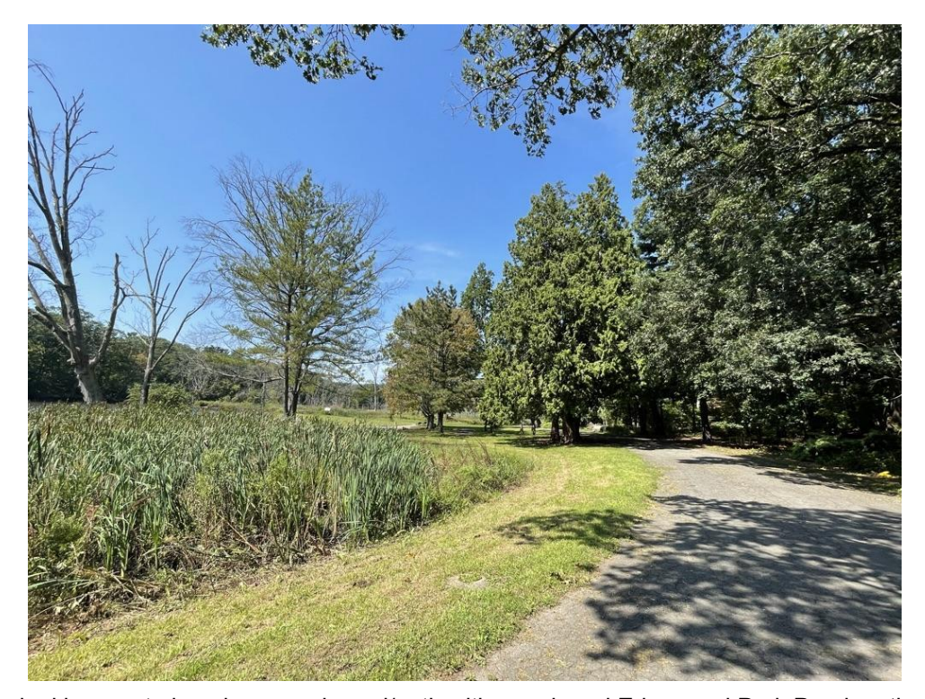
View looking west along lower park road/path with marsh and Edgewood Park Pond on the left.