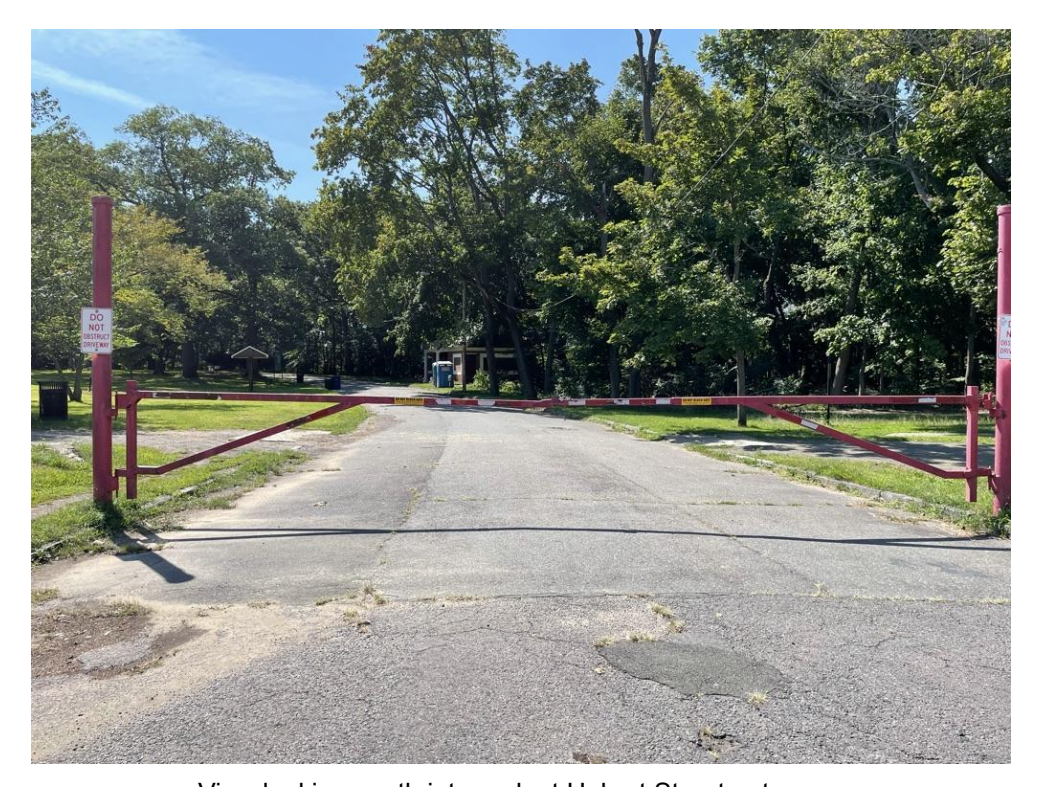
View looking south into park at Hobart Street entrance.