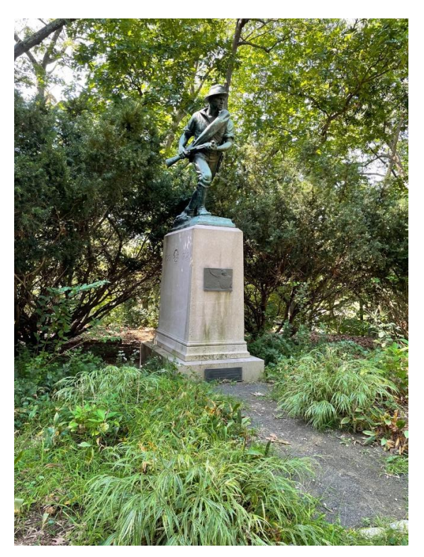
Spanish American War Memorial statue at upper level of Edgewood Park.