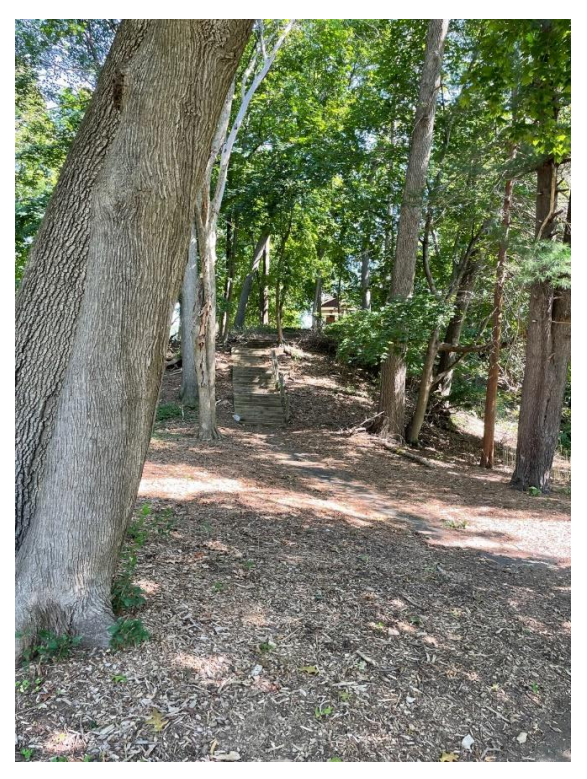
View of steep, wooded bank that is the transition along the upper to lower park. Note wooden stairs in middle distance to accommodate informal foot traffic on slope and ranger station in far distance.