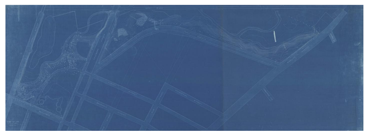
Map No. 641 of Edgewood Park, date not legible.