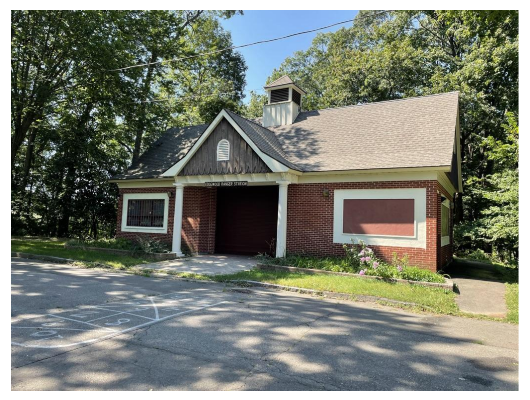
View of park façade of Edgewood Park Ranger Station.