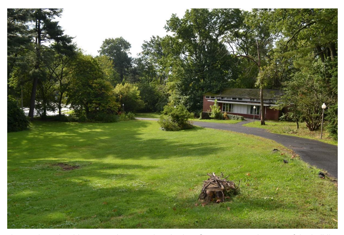
View southeast along the driveway as it approaches Asylum Street past another one of the buildings added to the property as part of the Hartford College for Women.