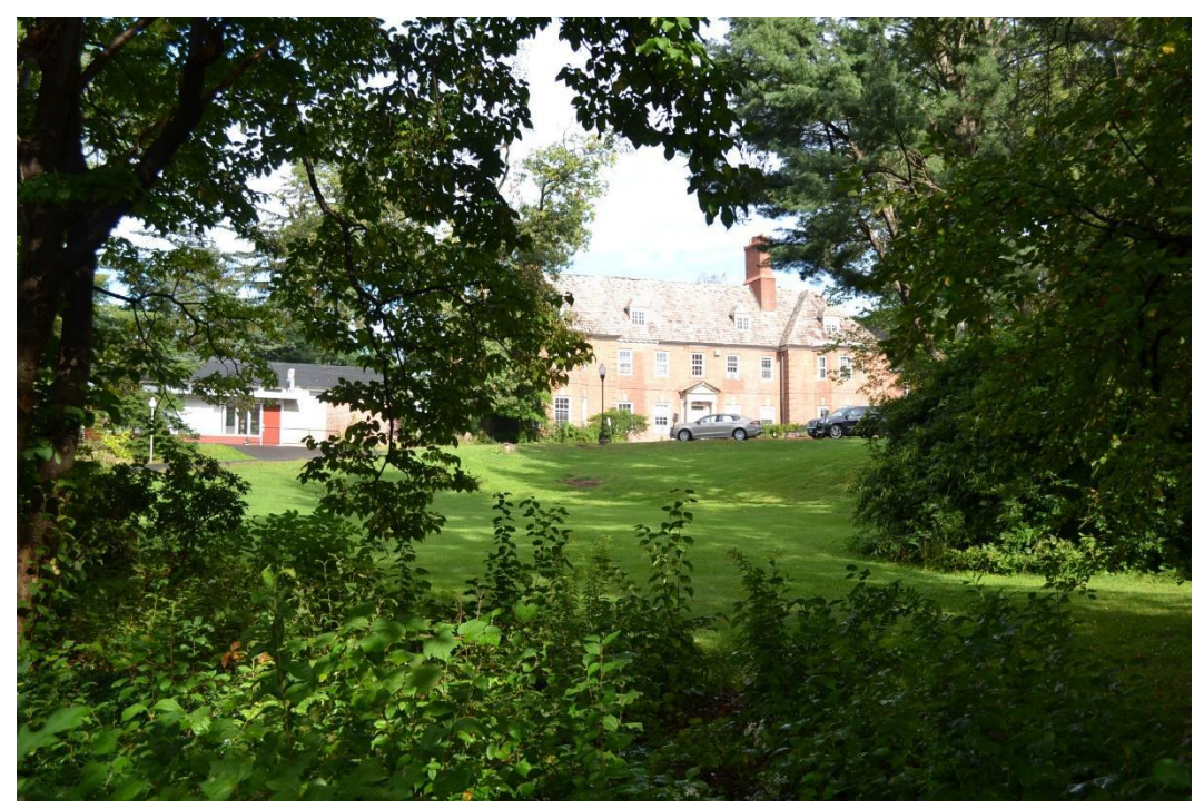
View northwest toward the Seaverns residence from Asylum Avenue near its intersection with Elizabeth Street. (All photographs taken by authors in 2021 unless otherwise noted)