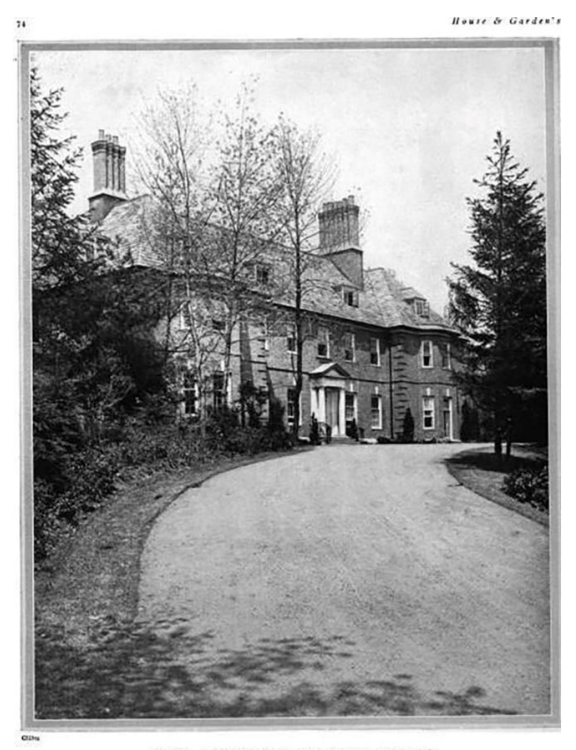
THE APPROACH TO THE HOUSE

CONTINUATION SHEET Charles F.T. Seaverns House (#06568) / 1265 Asylum Street, Hartford