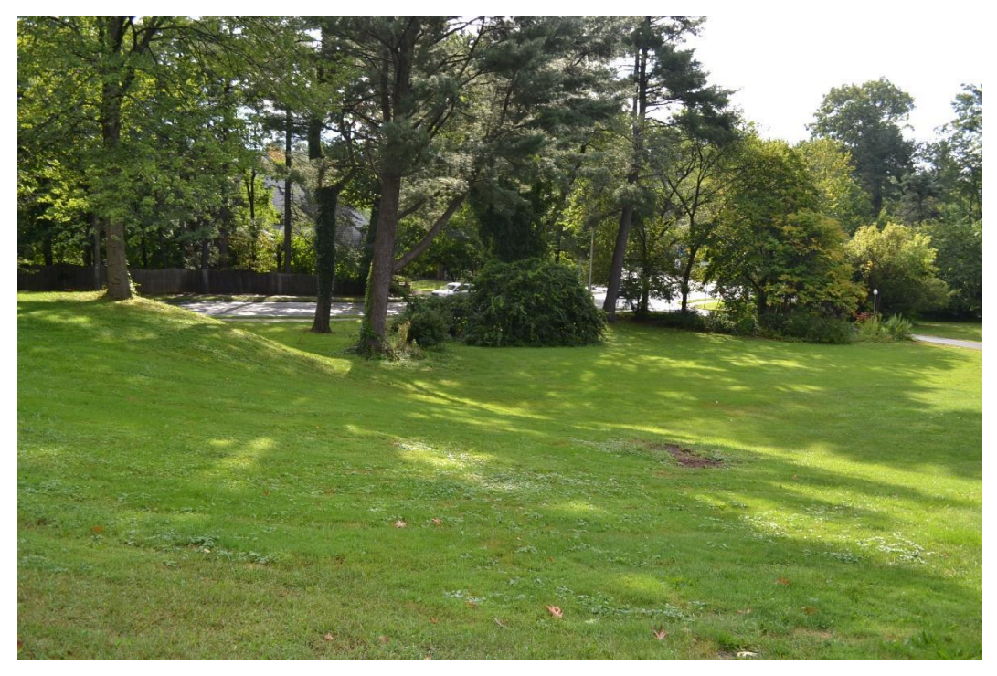
View southeast across the turf lawn and plantings between Asylum Avenue and the entrance drive to the house.