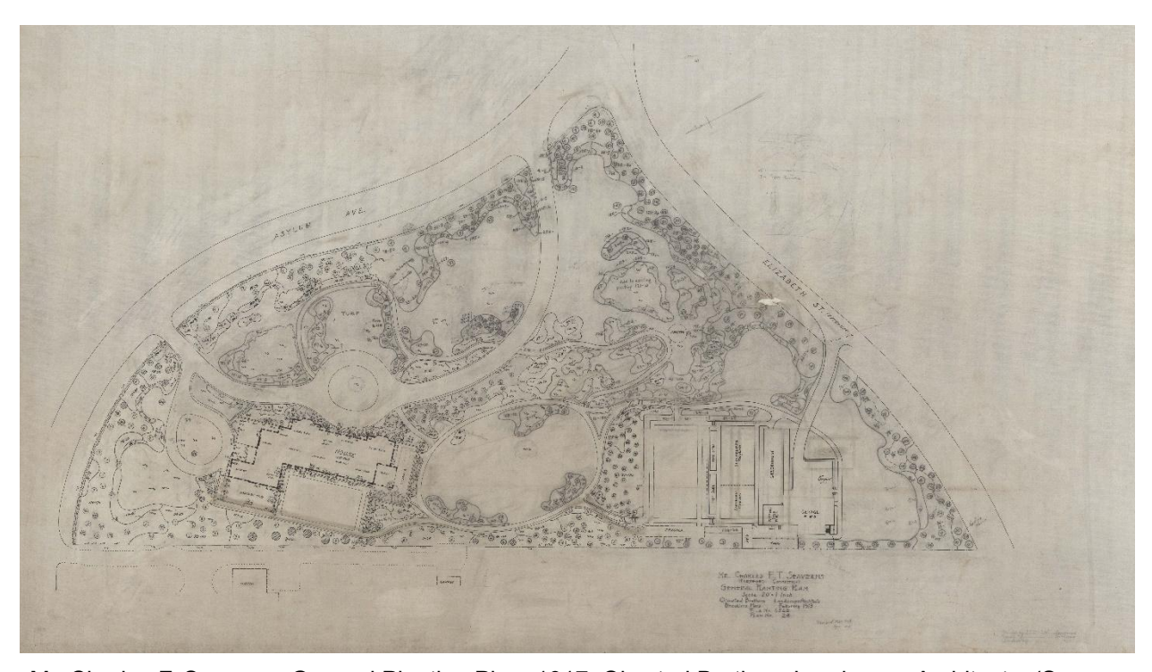
Mr. Charles F. Seaverns General Planting Plan, 1917, Olmsted Brothers Landscape Architects.