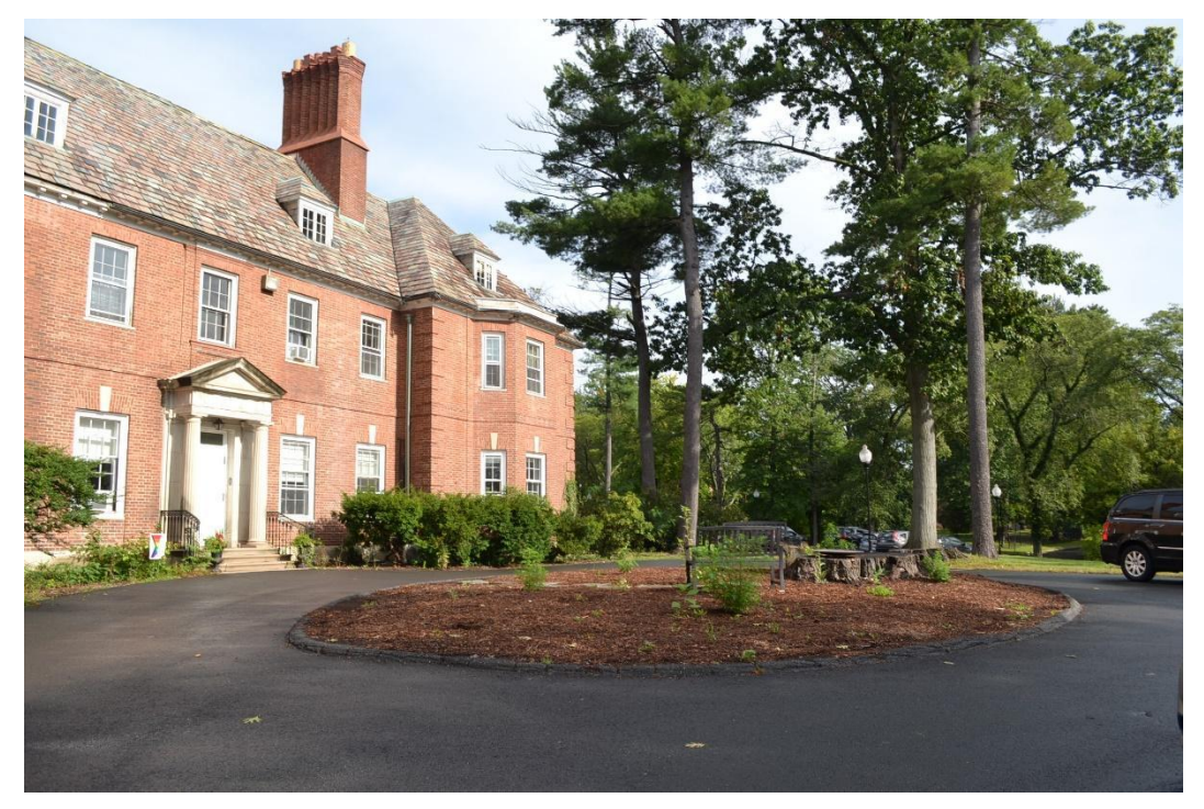
View northwest toward the principal façade of the Seaverns residence from entrance drive.