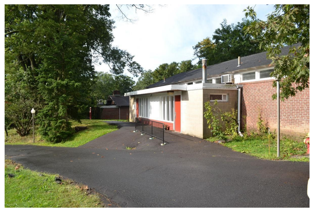
View south along the driveway past one of the buildings added to the property as part of the Hartford College for Women.