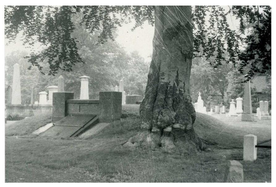
Photograph of the tomb from the southeast, 1958.