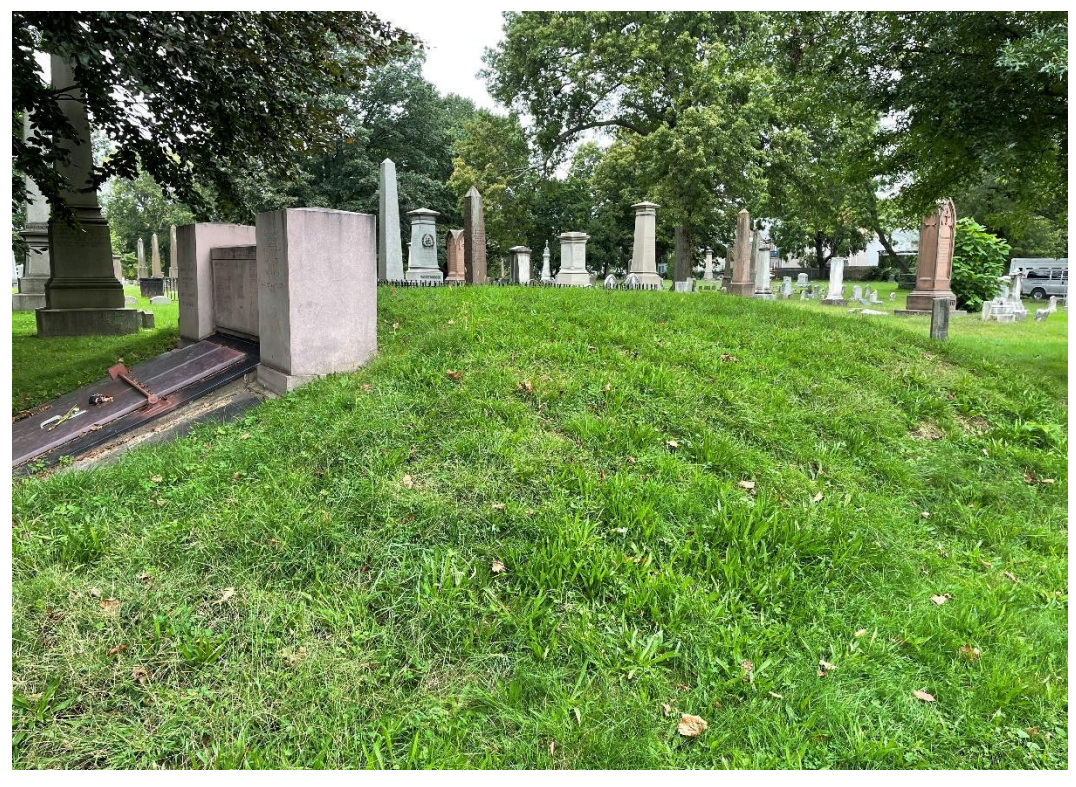
View of the side of the Olmsted vault.