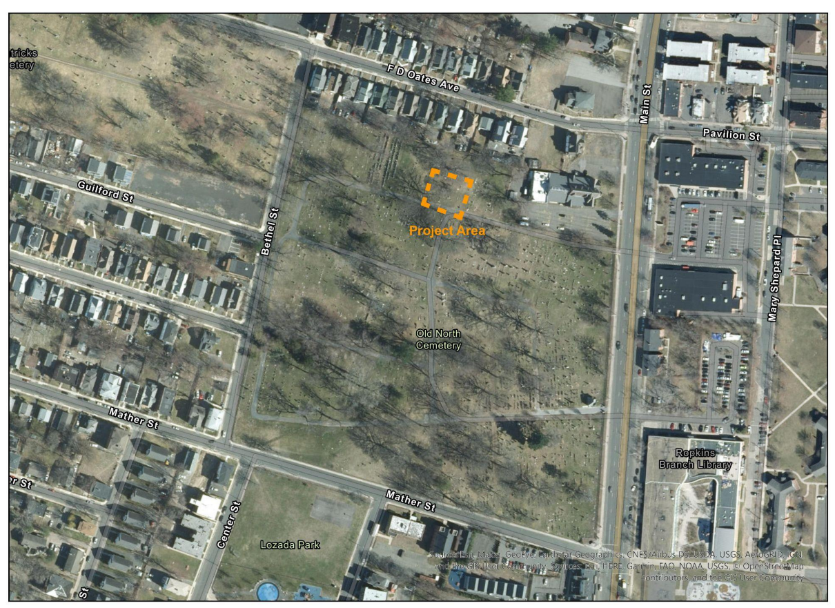
JOB: 02933 LOCATION: Hartford PROJECT: Olmsted Tomb

CONTINUATION SHEET Olmsted Tomb (#02933) / Old North Cemetery, 1821 Main Street, Hartford