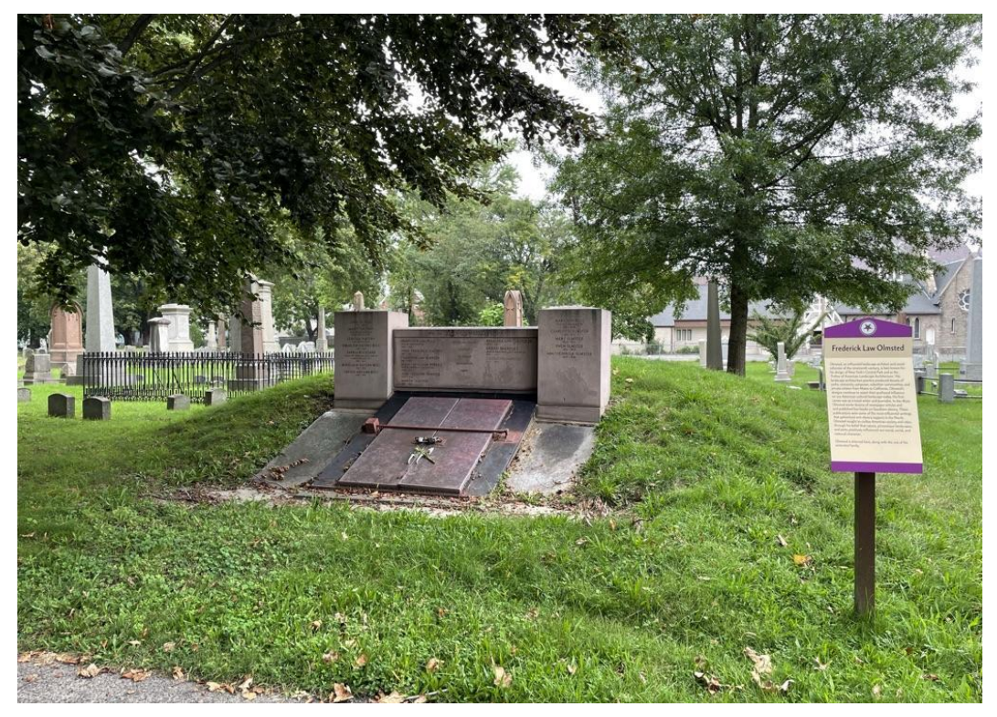
View of face of Olmsted vault at Old North Cemetery, Hartford.

CONTINUATION SHEET Olmsted Tomb (#02933) / Old North Cemetery, 1821 Main Street, Hartford