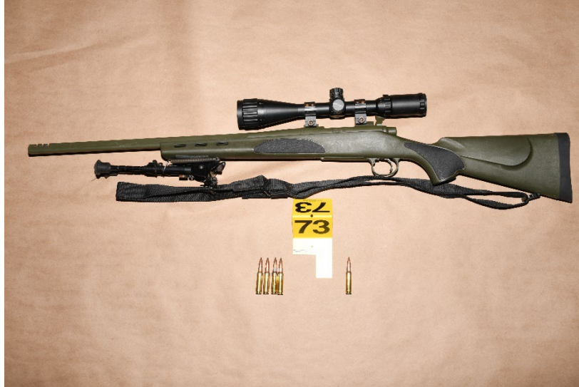
Green Remington w/tripod