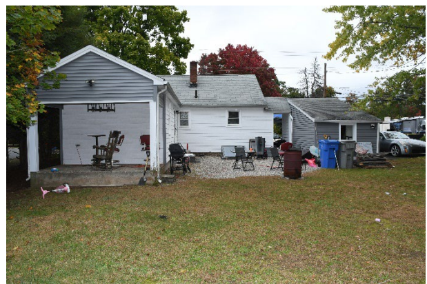
310 Redstone Hill Road Rear