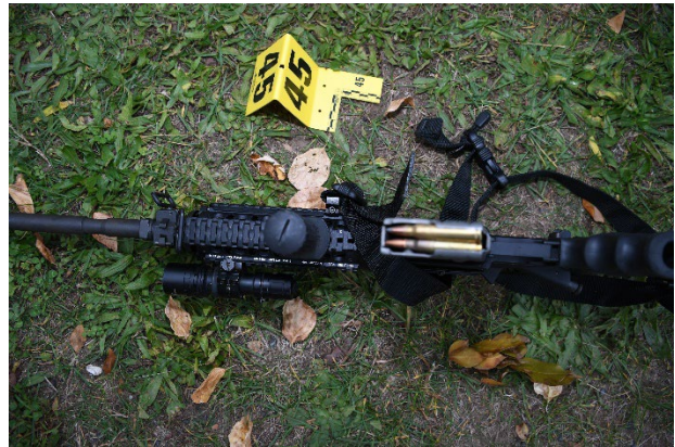
Stag Arms AR-15 Magazine inserted upside down