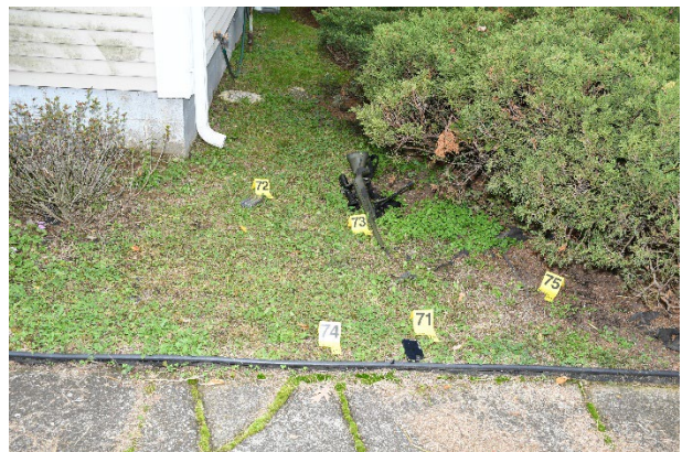
Remington near bushes