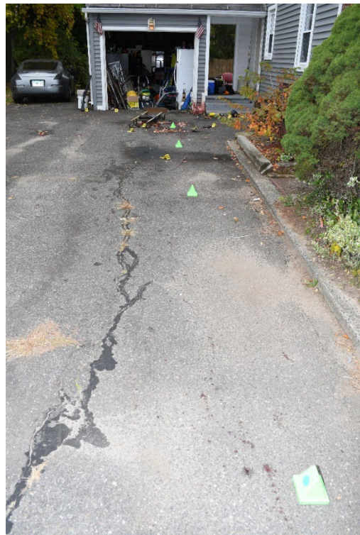
310 Redstone Hill Road Driveway