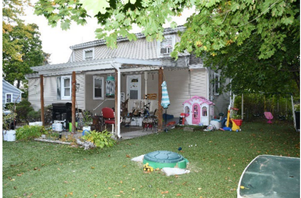
328 Redstone Hill Road Back porch