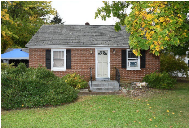
310 Redstone Hill Road Nicholas Brutcher's house – front