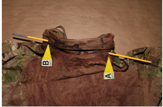
Camouflage shirt w/trajectory rod