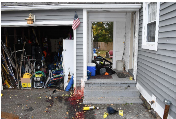
310 Redstone Hill Road Breezeway