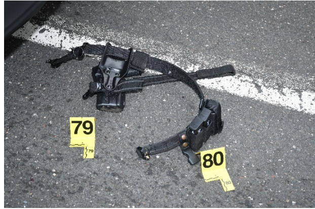
Officer Iurato's duty belt