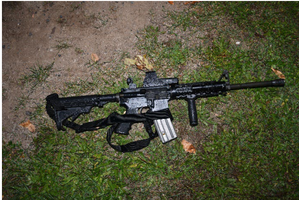
Stag Arms AR-15