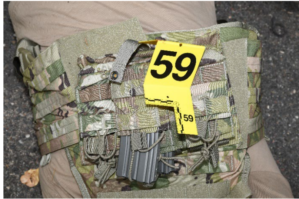
Nicholas Brutcher's utility belt