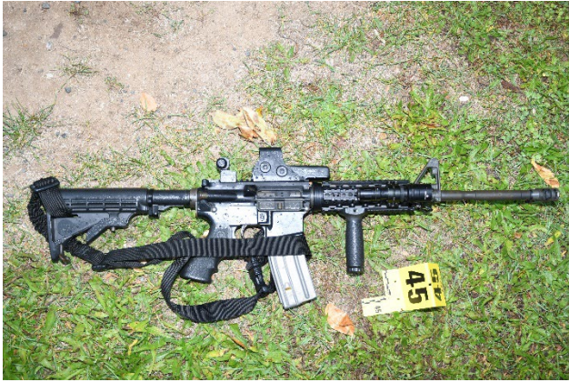
Stag Arms AR-15