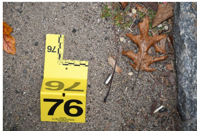
Close up shell casing