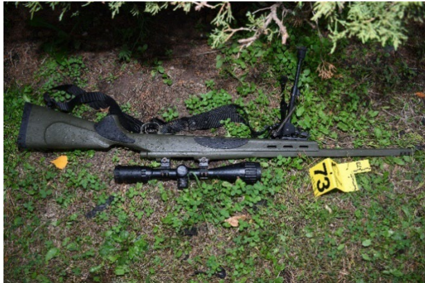
Remington with tripod