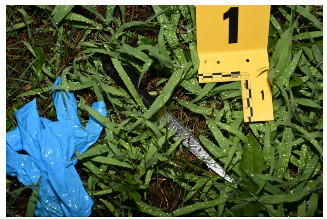
[Knife on the ground]