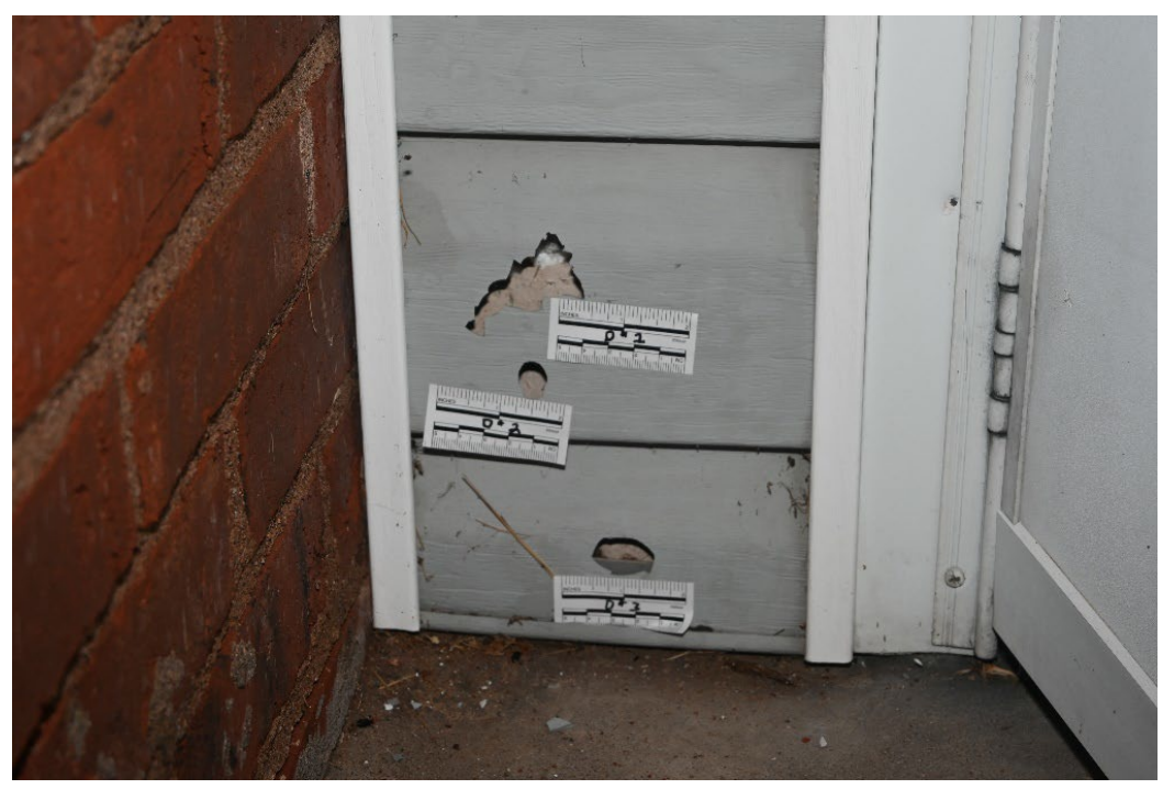
[Bullet defects in siding of apartment]