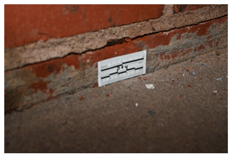
[Bullet defect in brick wall]