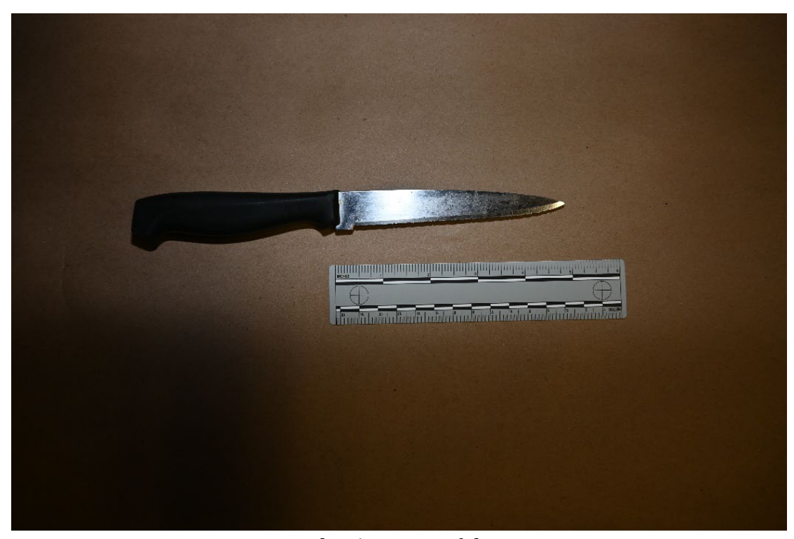
[Evidence 1 Knife]