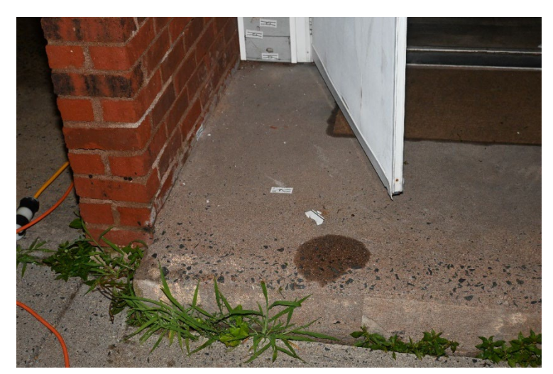
[Bullet defect in concrete front stoop]