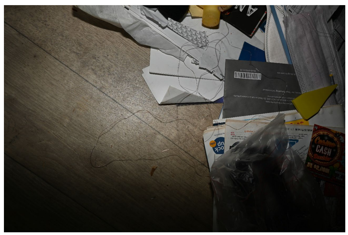
[Taser wire in apartment]