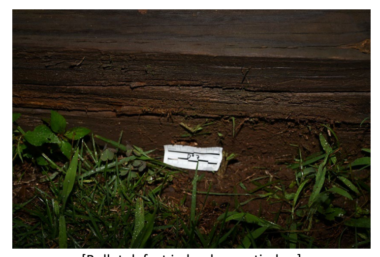
[Bullet defect in landscape timber]