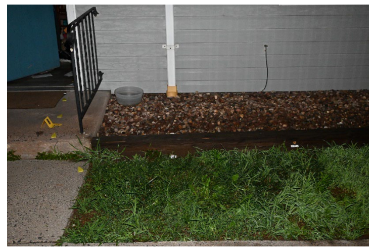
[Bullet defects in landscape timber]