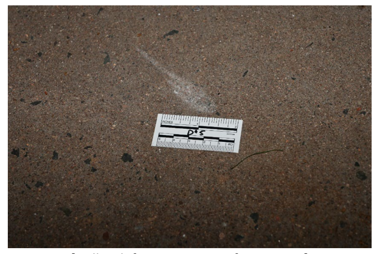
[Bullet defect in concrete front stoop]