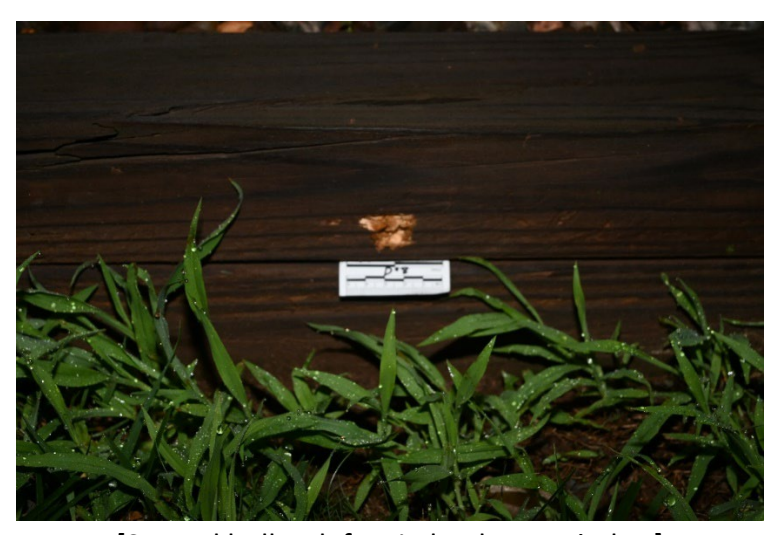
[Second bullet defect in landscape timber]