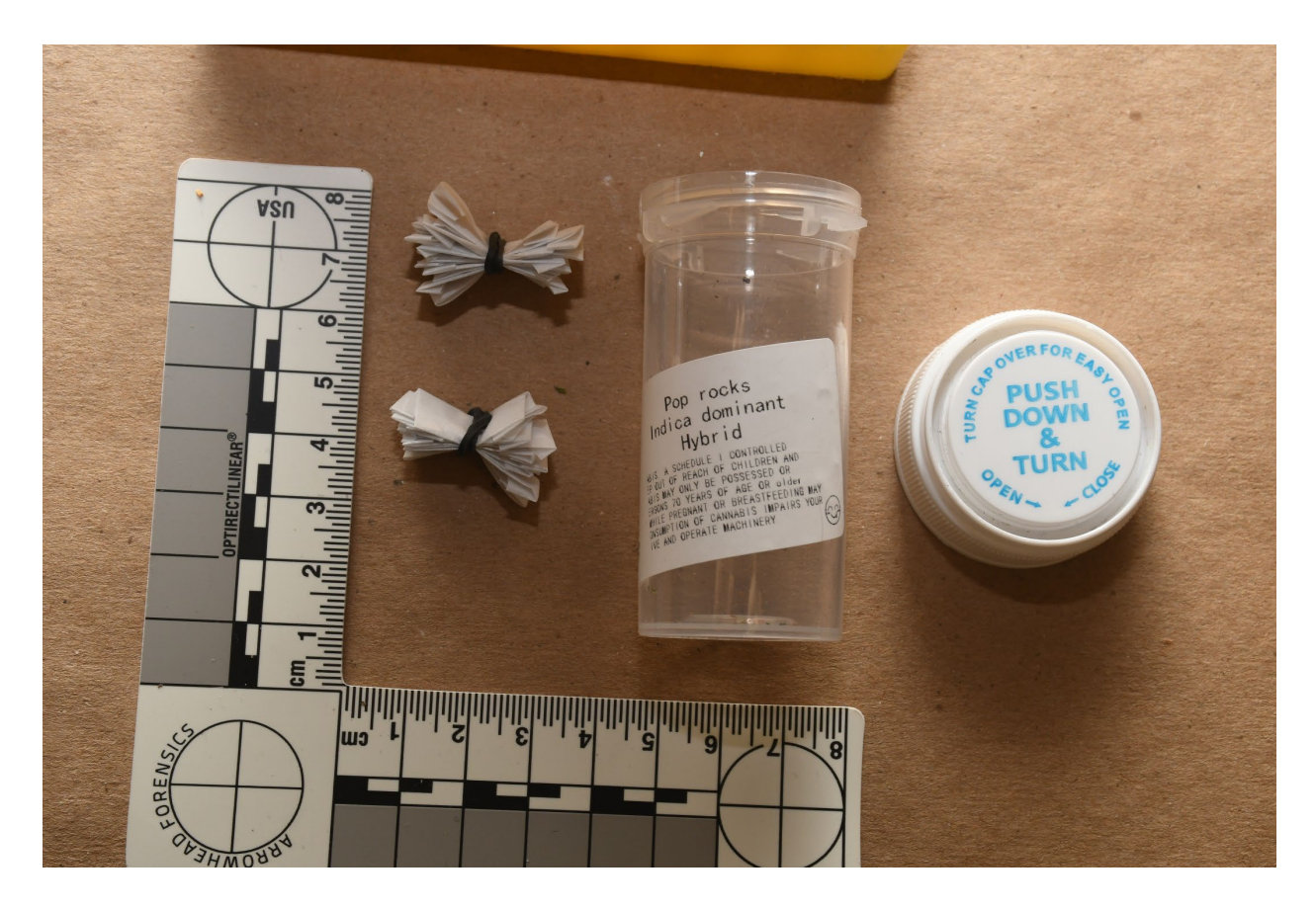
[Suspected fentanyl seized from crashed Honda]

The Honda Accord that Gambardella crashed was seized, towed, and examined by WDMCS. Among the items found therein were a glass crack pipe, a scale, $106 cash, and a clear medication bottle containing two bundles of wax folds containing a white substance. The substance was later turned over to the East Haven Police Department and field-tested positive for fentanyl.