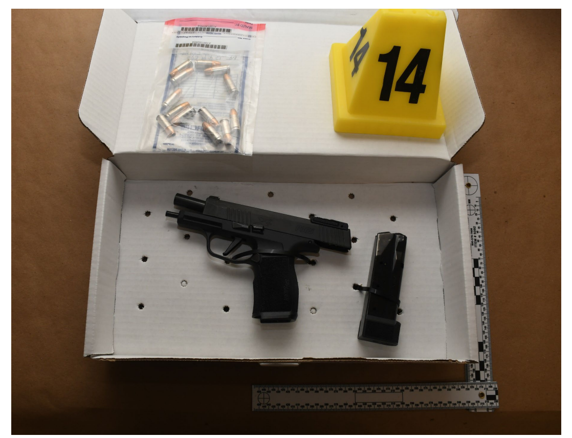
[Lieutenant Finoia's pistol and unused bullets]