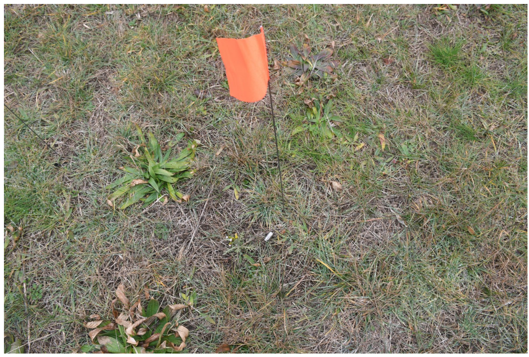
[Close-up view of casing]