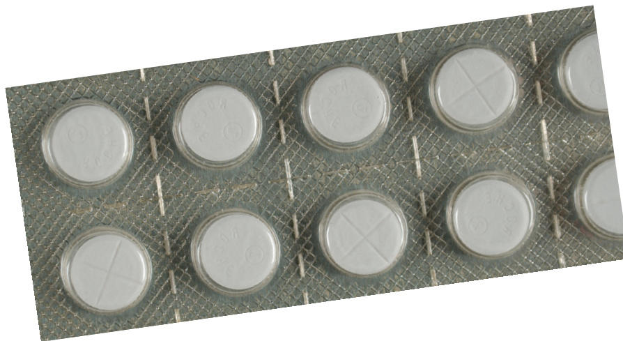
Blister pack of Rohypnol® tablets

Rohypnol® is a Schedule IV substance under the Controlled Substance Act. Rohypnol® is not approved for manufacture, sale, use or importation to the United States. It is legally manufactured and marketed in many countries. Penalties for possession, trafficking, and distribution involving one gram or more are the same as those of a Schedule I drug.