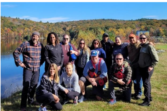
Careline supervisors and primary investigators on a group outing at the DCF's Wilderness School.

"There's nine of us primaries who get sent out on critical same-day responses. We typically respond to hospitals or requests to assist law enforcement."