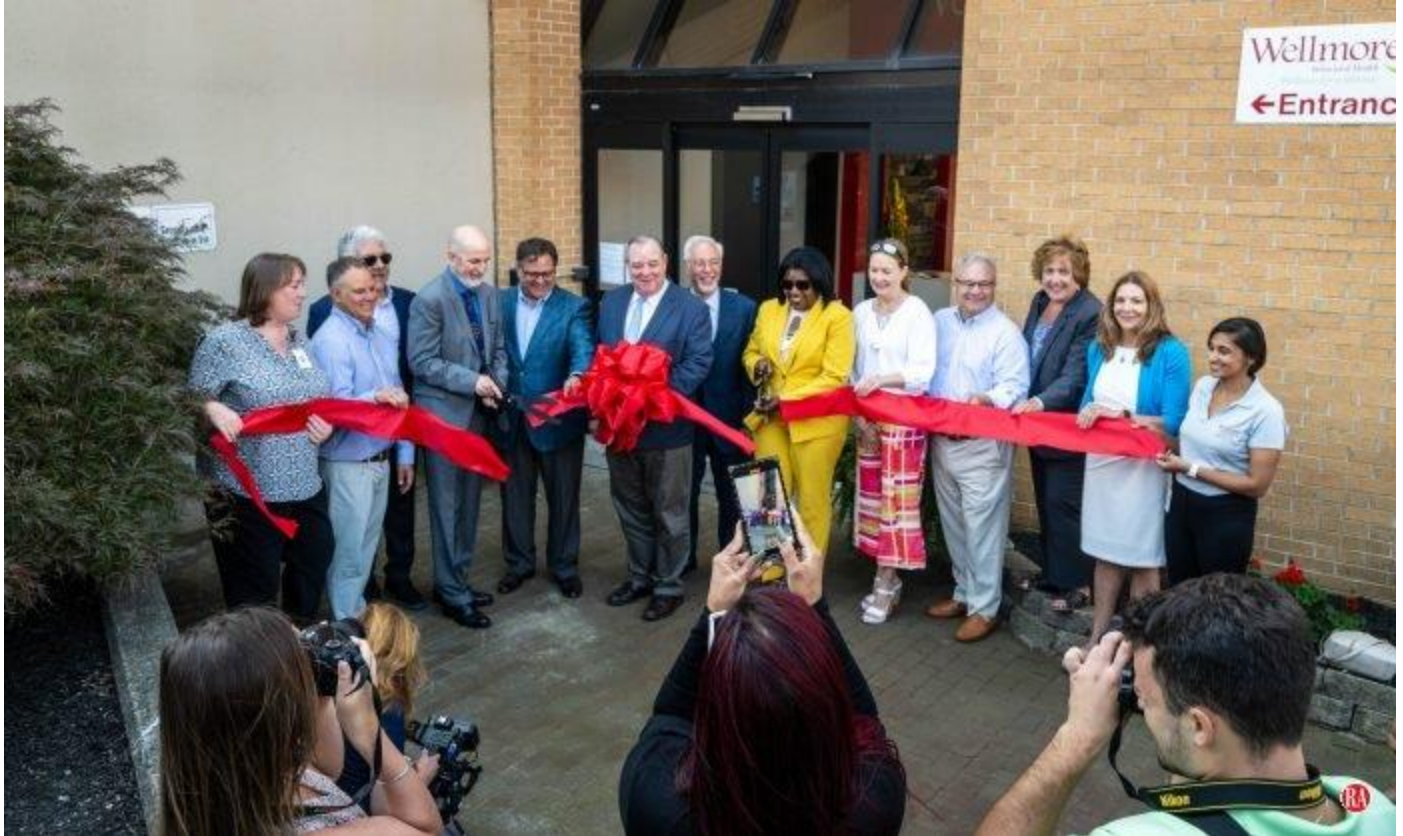
WATERBURY, CT 082223JS05 Dignitaries officially cut the ribbon during a ceremony for the opening of the state first Urgent Crisis Center for Youth Tuesday at Wellmore Behavioral Health in Waterbury.

"I couldn't be happier to work myself out of a job." This is what I said standing alongside