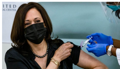
Kamala Harris, U.S. vice president

"Literally, this is about saving lives. I trust the scientists. And it is the scientists who created and approved this vaccine. So I urge everyone: When it is your turn, get vaccinated. It's about saving your life, the life of your family members, and the life of your community."