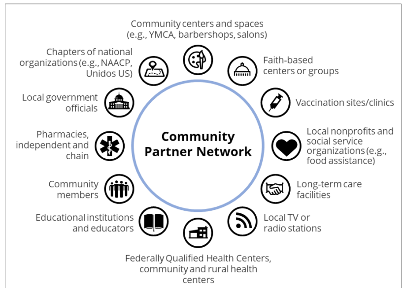
Figure 3: Community partner network example for Black and Hispanic/Latinx Communities