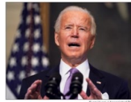
President Joe Biden delivers remarks on COVID-19 Tuesday in the State Dining Room of the White House, in Washington.