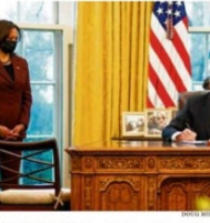
MONDAY, JANUARY 25 — Making his mark

A quieter White House. Discipline. COVID tests. A daily press briefing. But the deep partisan division remains