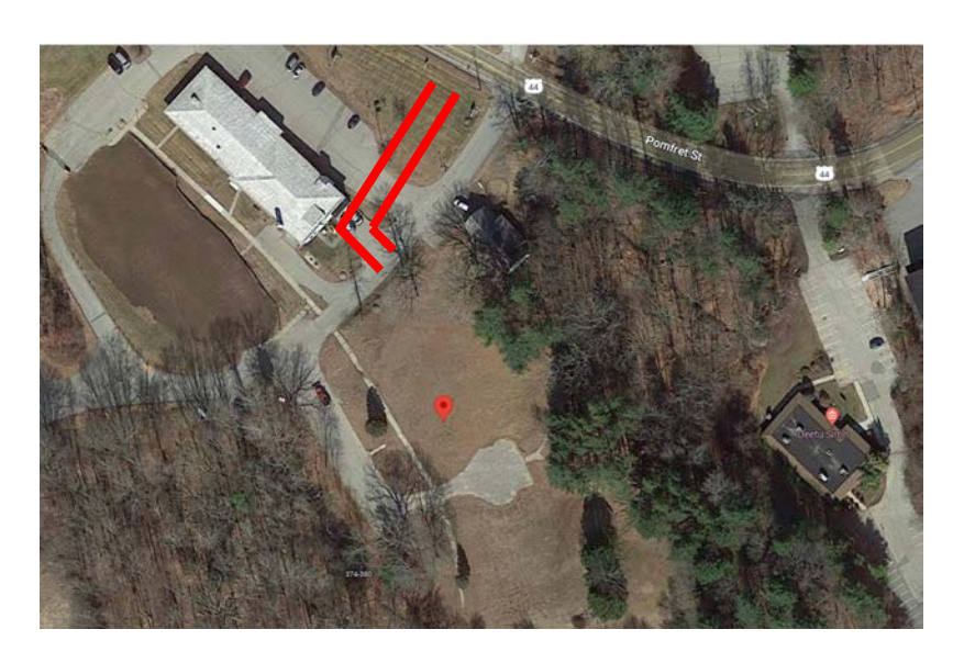
General Direction of Easement Area.

This easement is being provided for the purposes of extending natural gas service to the new CTARNG New Readiness Center in Putnam.