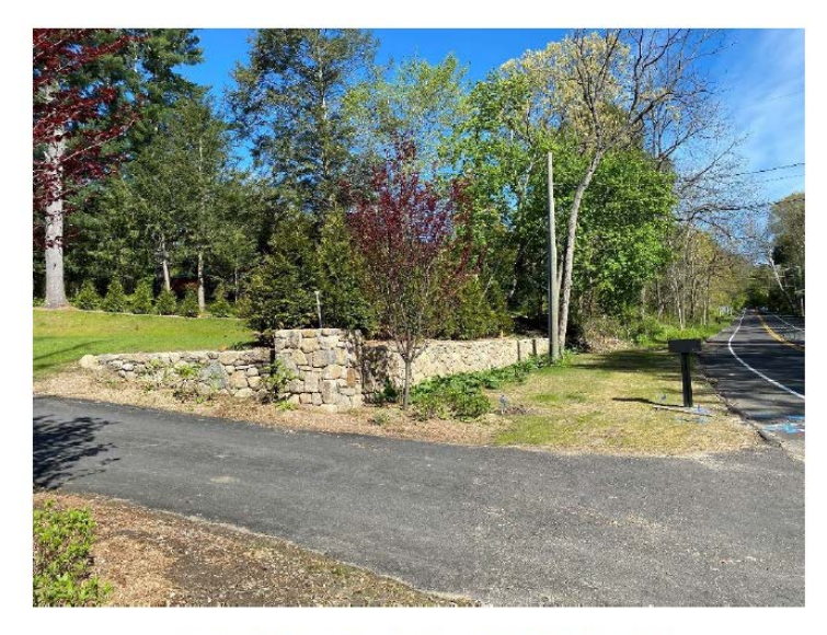
View of Release Area & Sole Abutter looking West

The property was acquired by the Department of Transportation in 1926 for the construction of Route 33.