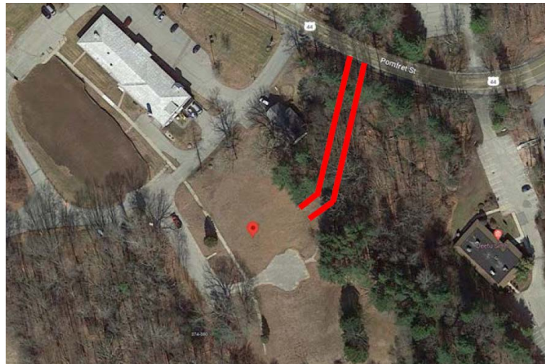
General Direction of Easement Area.

RECOMMENDATION: Staff recommend Board approval for the granting of an Electric Distribution Easement to The Connecticut Light & Power Co d/b/a Eversource Energy pursuant to CGS 4b-22a(1), for the following reasons: