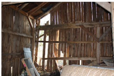
Interior Pre-restoration (2013)