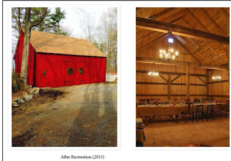
After Restoration (2013)