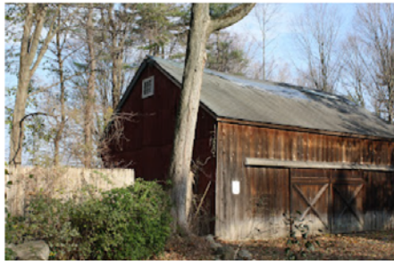
Exterior Pre-restoration (2013)