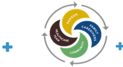
Community-based care coordination through expanded care team