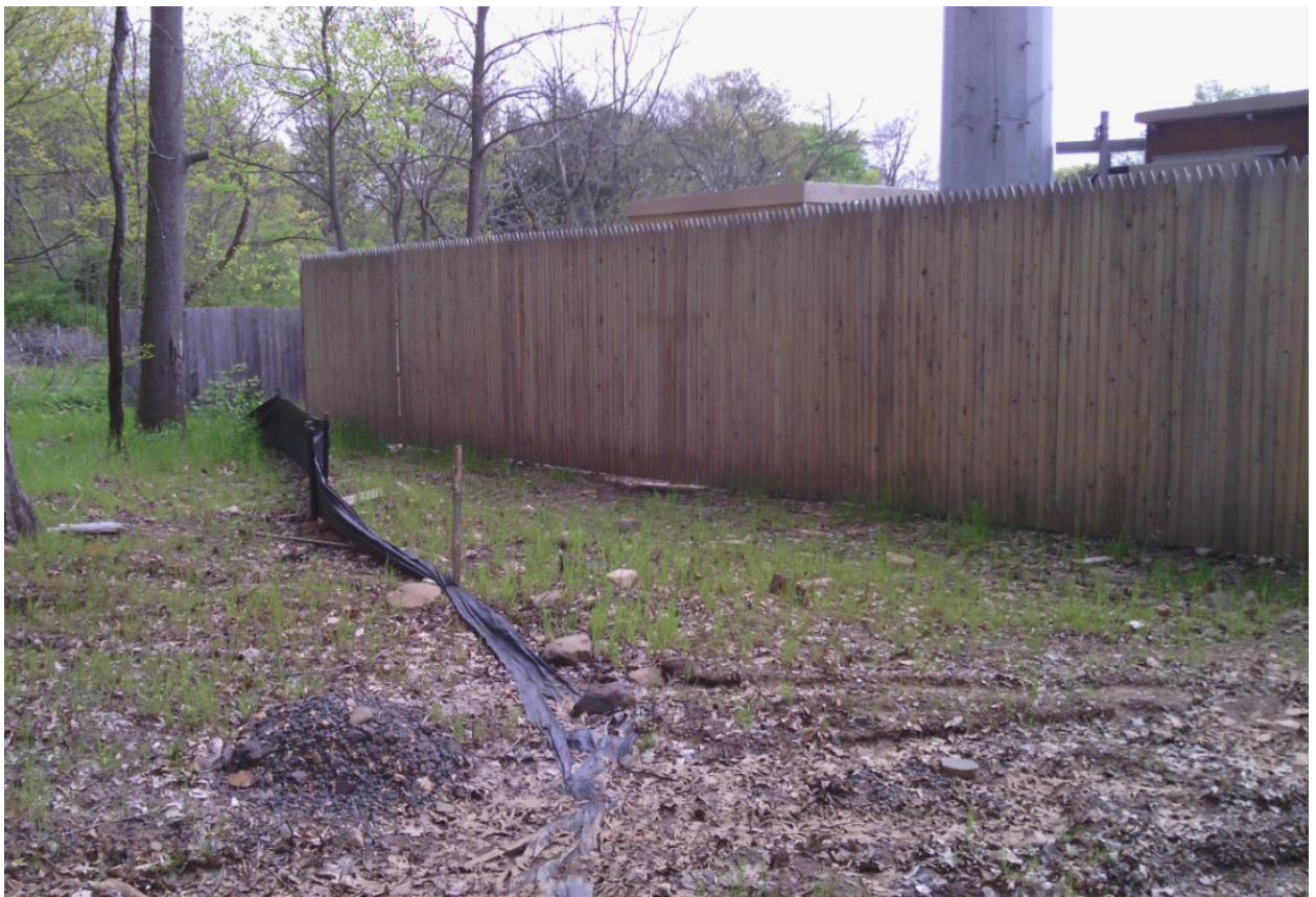
Compound – rear view