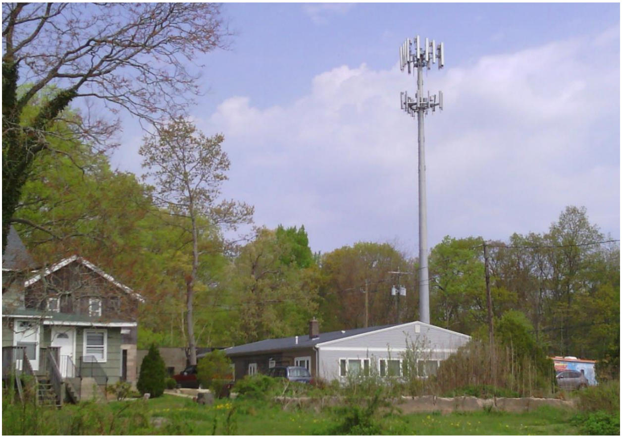
View of facility from across street- south.