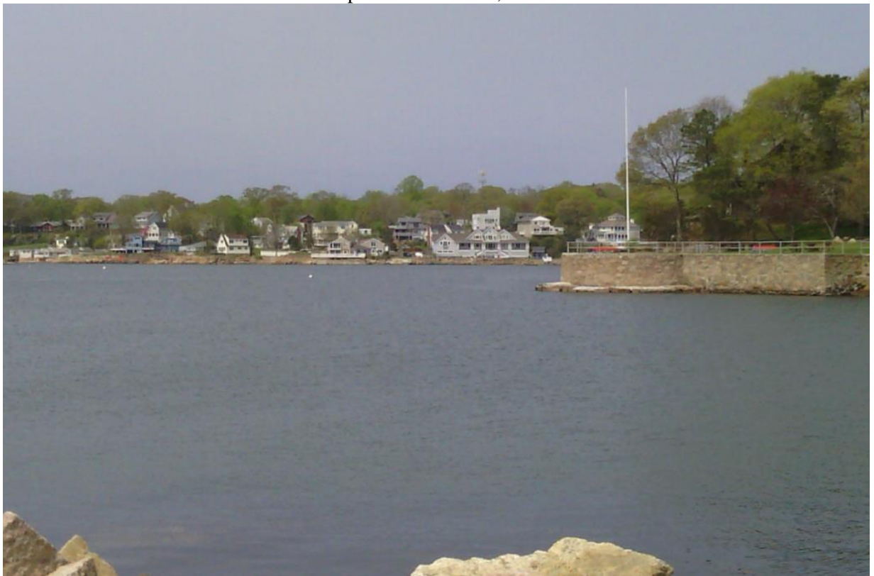
View of tower from Parker Memorial Park, 0.7 miles east.