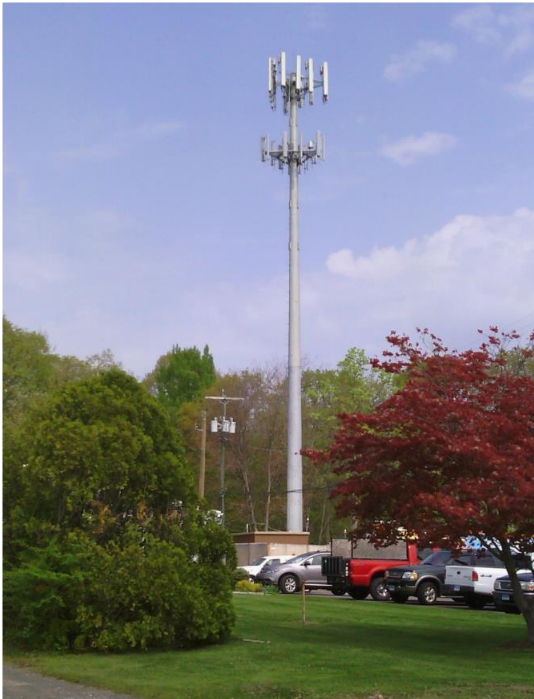
View of Facility from Short Beach Road, from front of adjacent residential property.