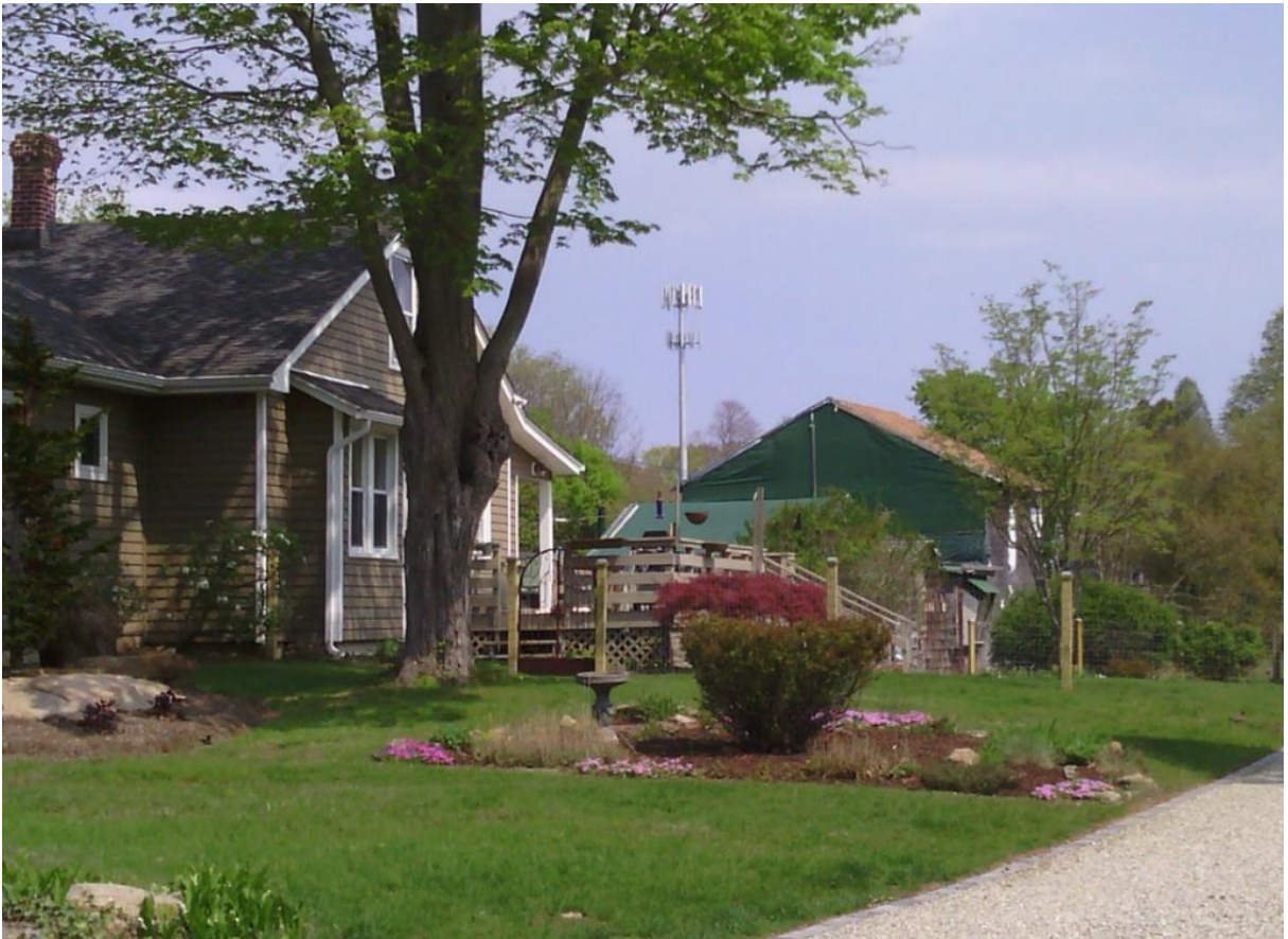
View tower from Lanphiers Cove Road, 0.18 miles south of site.