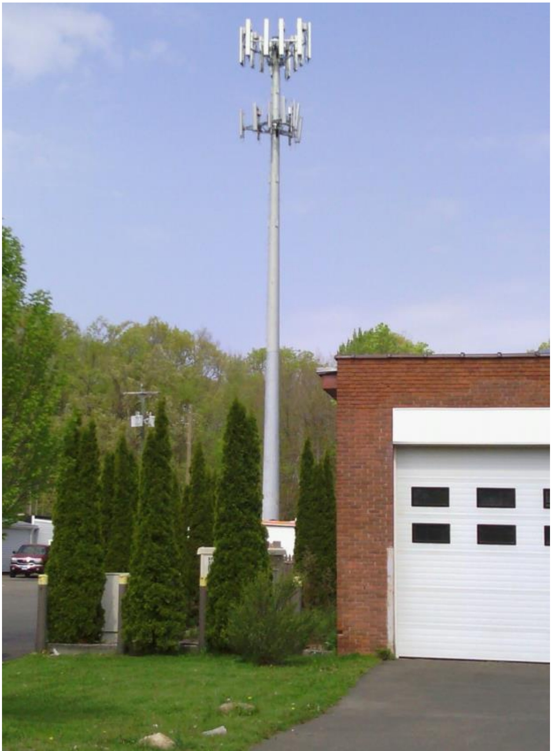
View of facility from across the street - east.