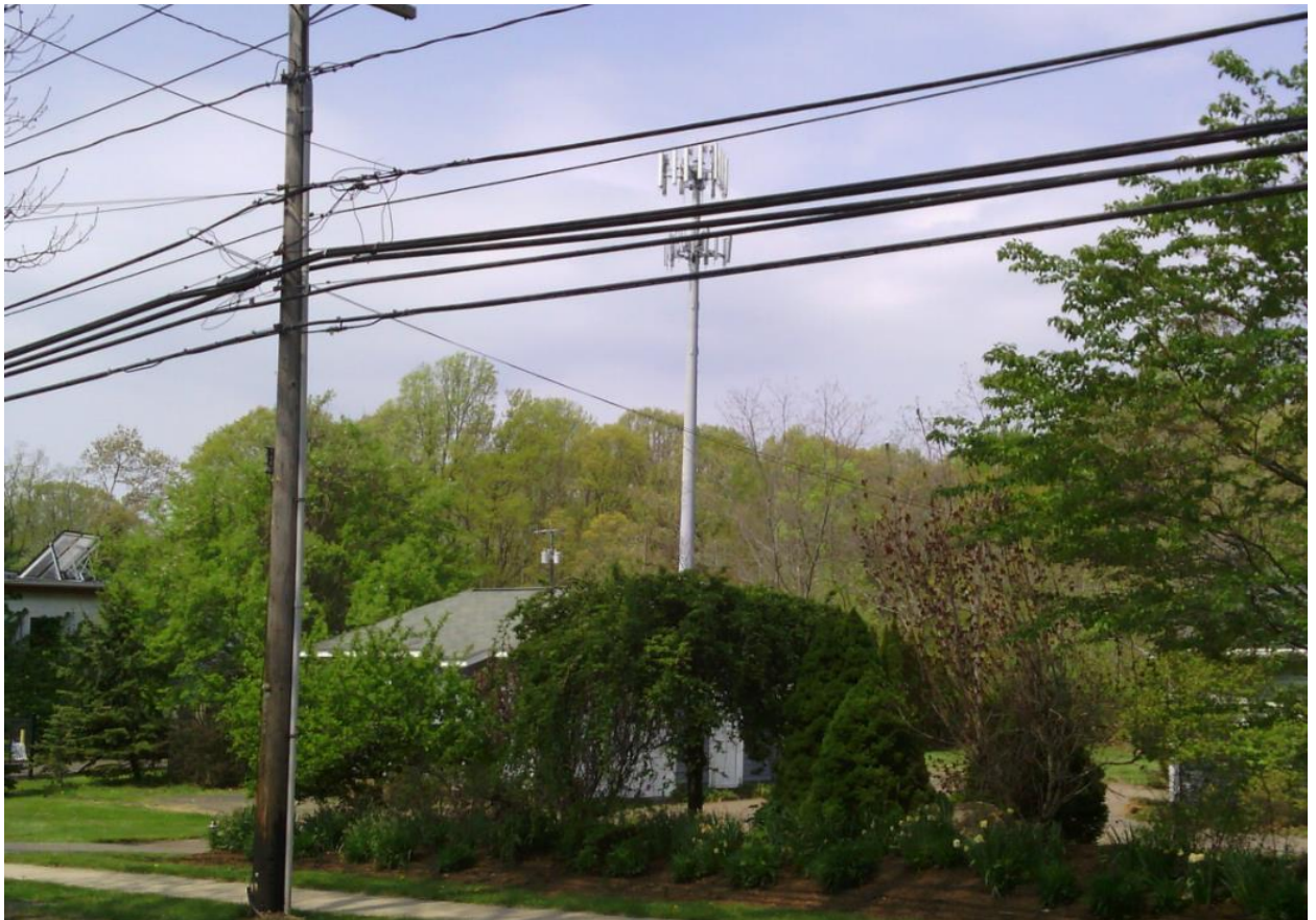
View of facility from across street- northeast.