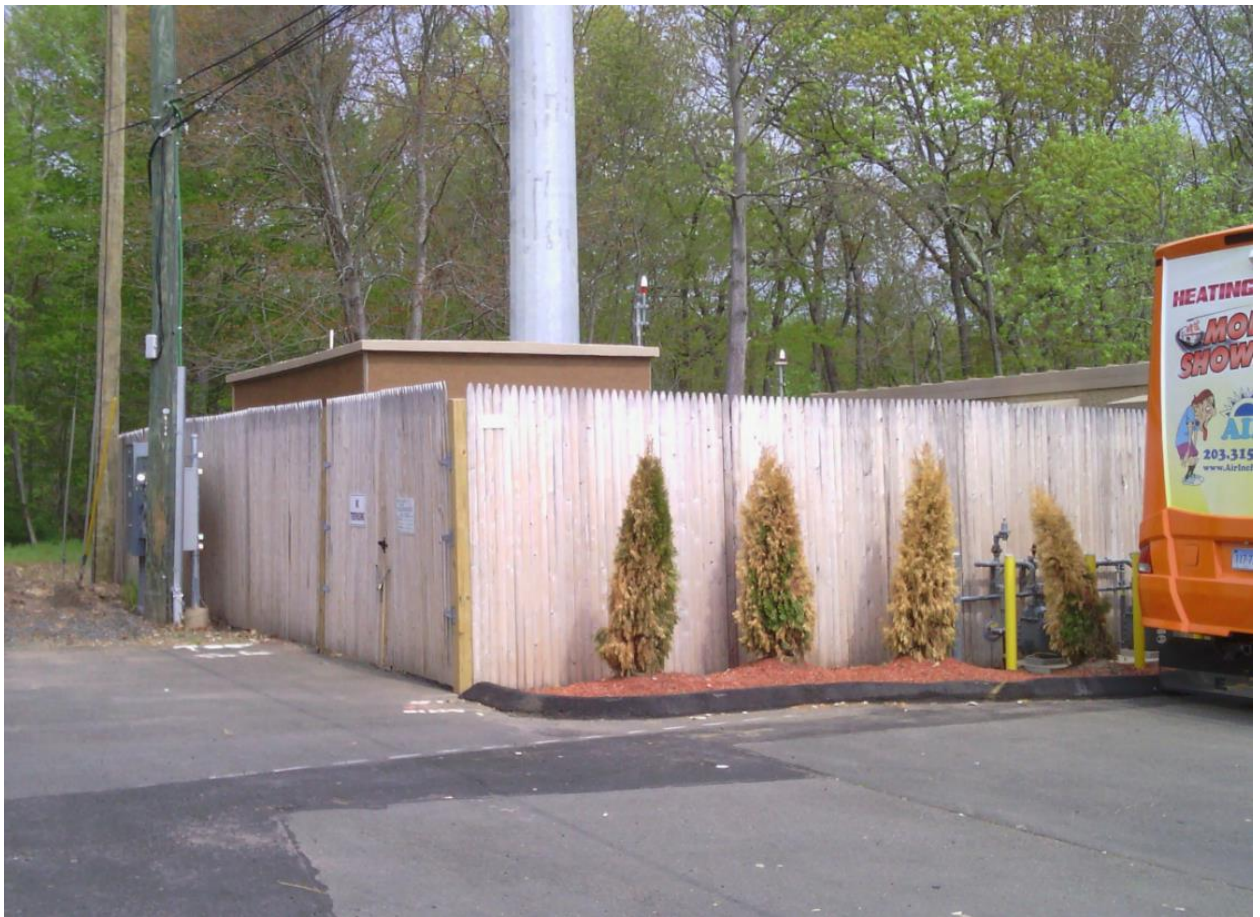
Compound- front view