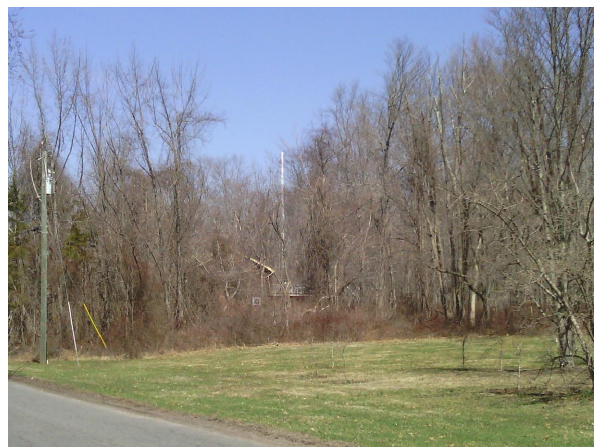
View of tower from Great Oak Lane, 0.17 miles to southwest.