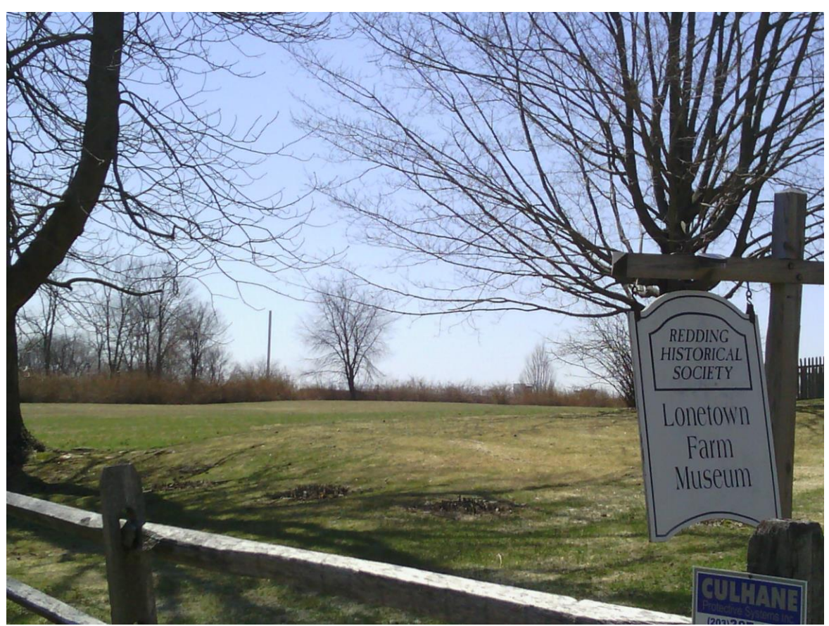
View tower from historical property on Route 107, 0.3 miles northeast of site.