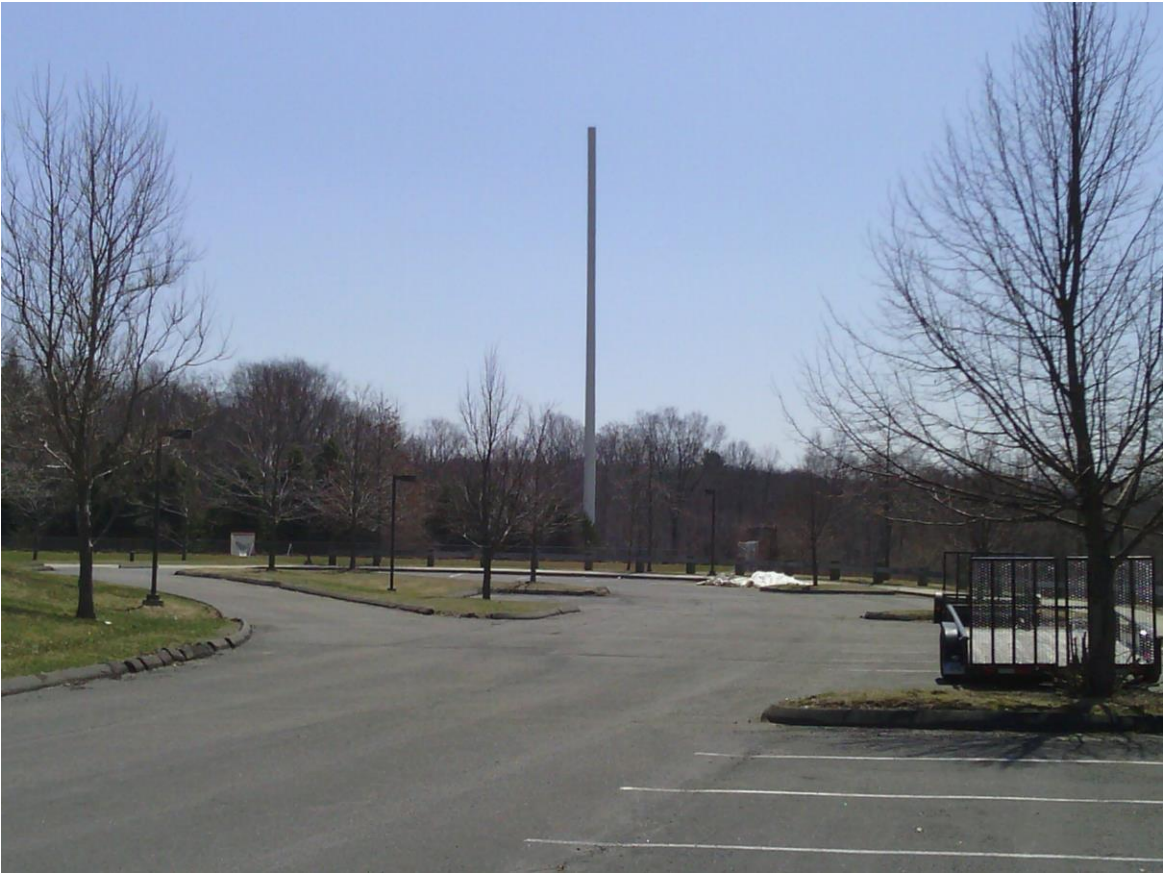
View of tower from school property, 0.16 miles north of site.