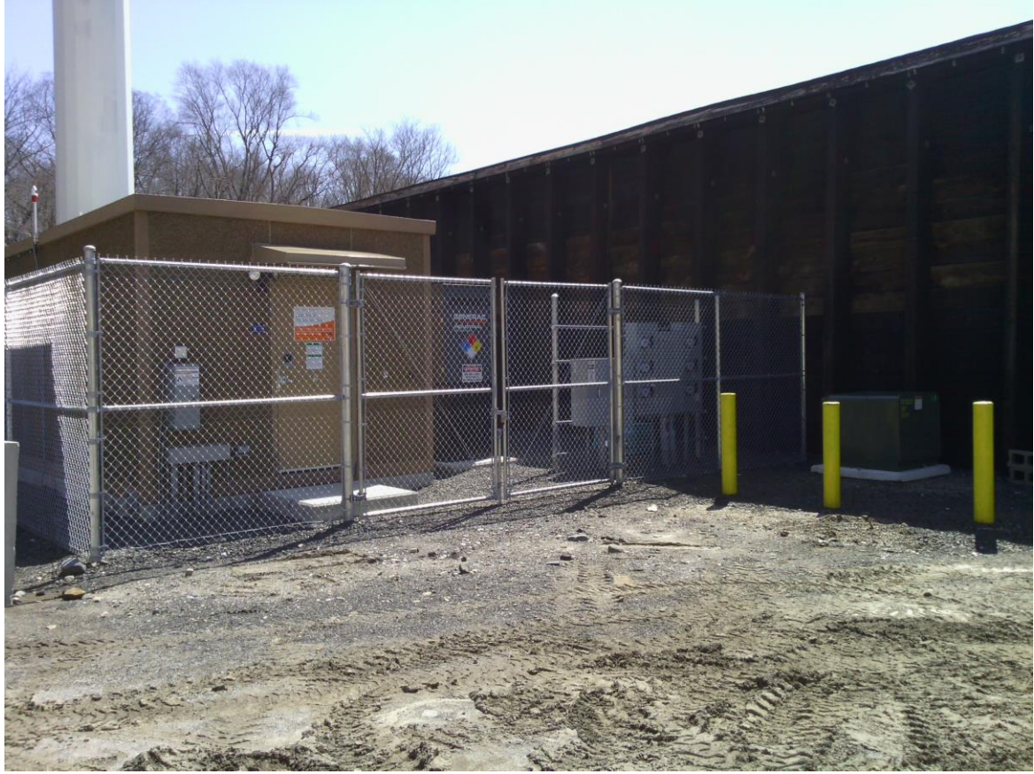
Compound view – west side.