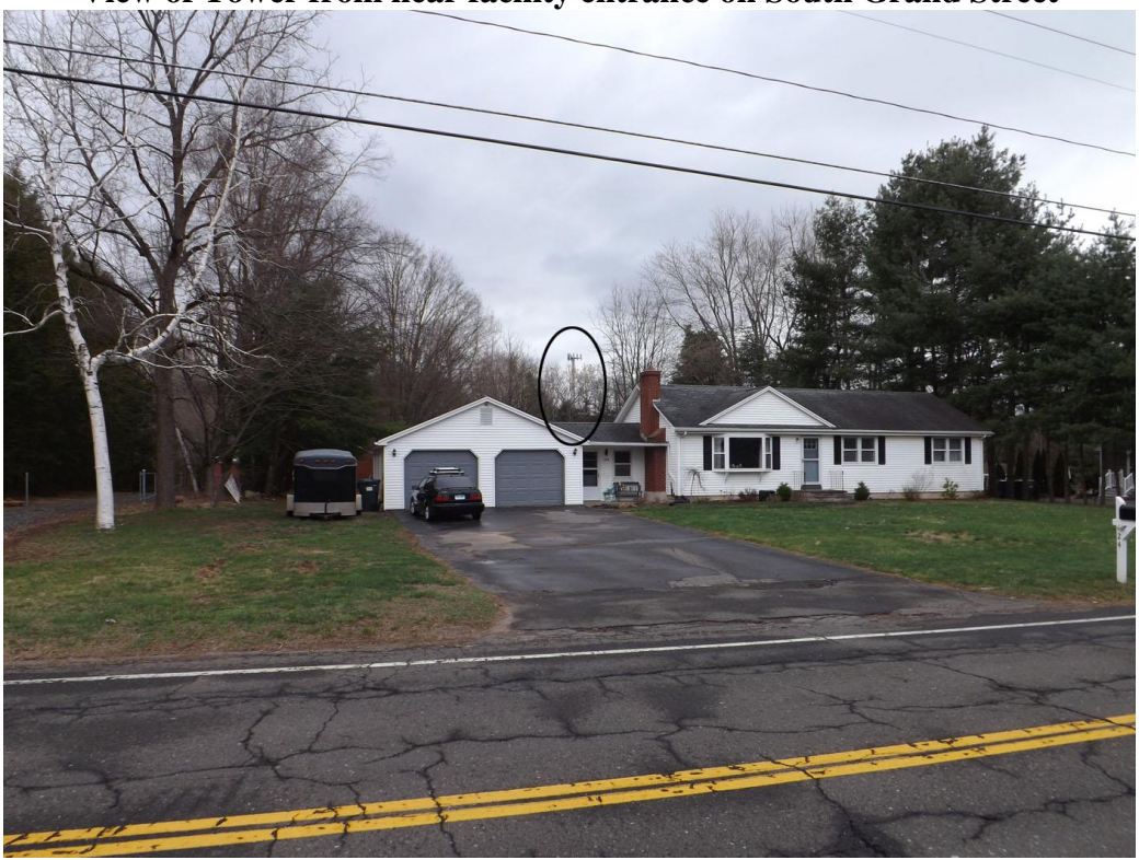
View of Tower from near facility entrance on South Grand Street

Docket 403: Suffield Post-Construction Report Page 4