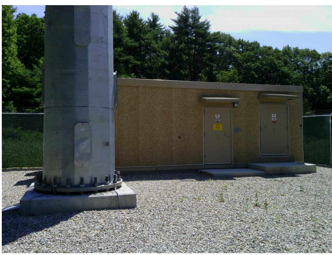
Interior compound view. Fuel tank behind shelter.