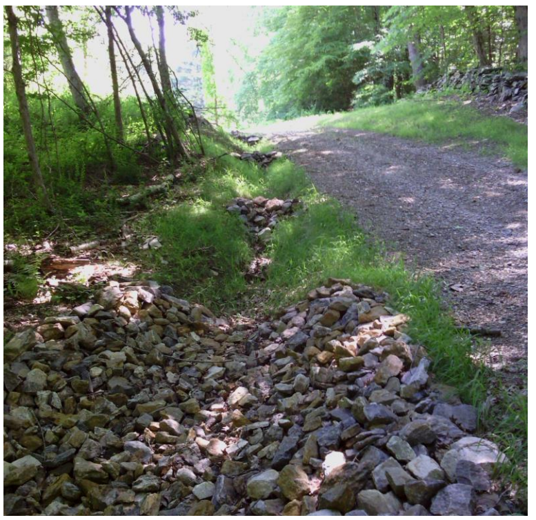
Check dams and ditch protection along access road.