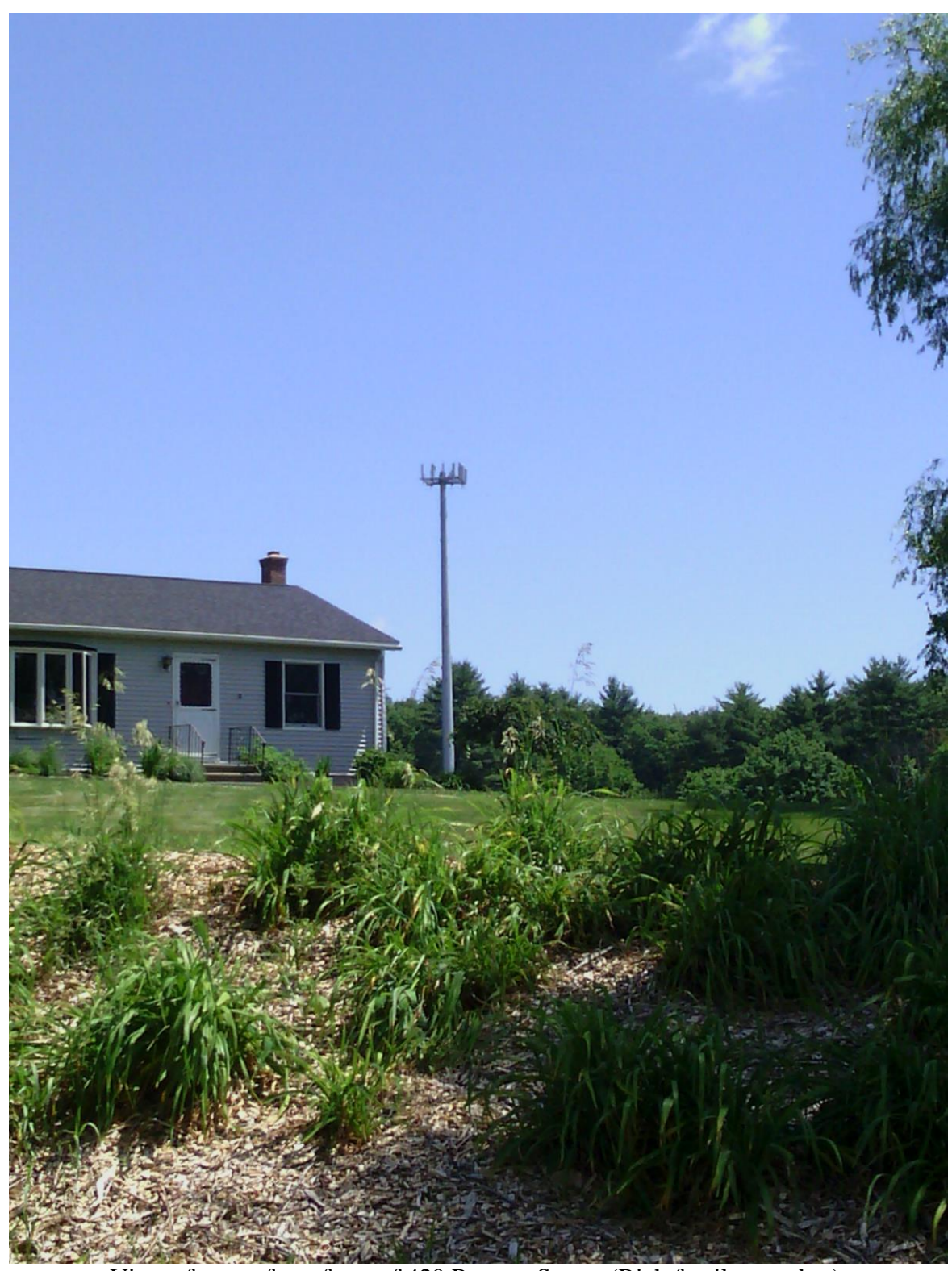
View of tower from front of 429 Propect Street, (Rich family member).