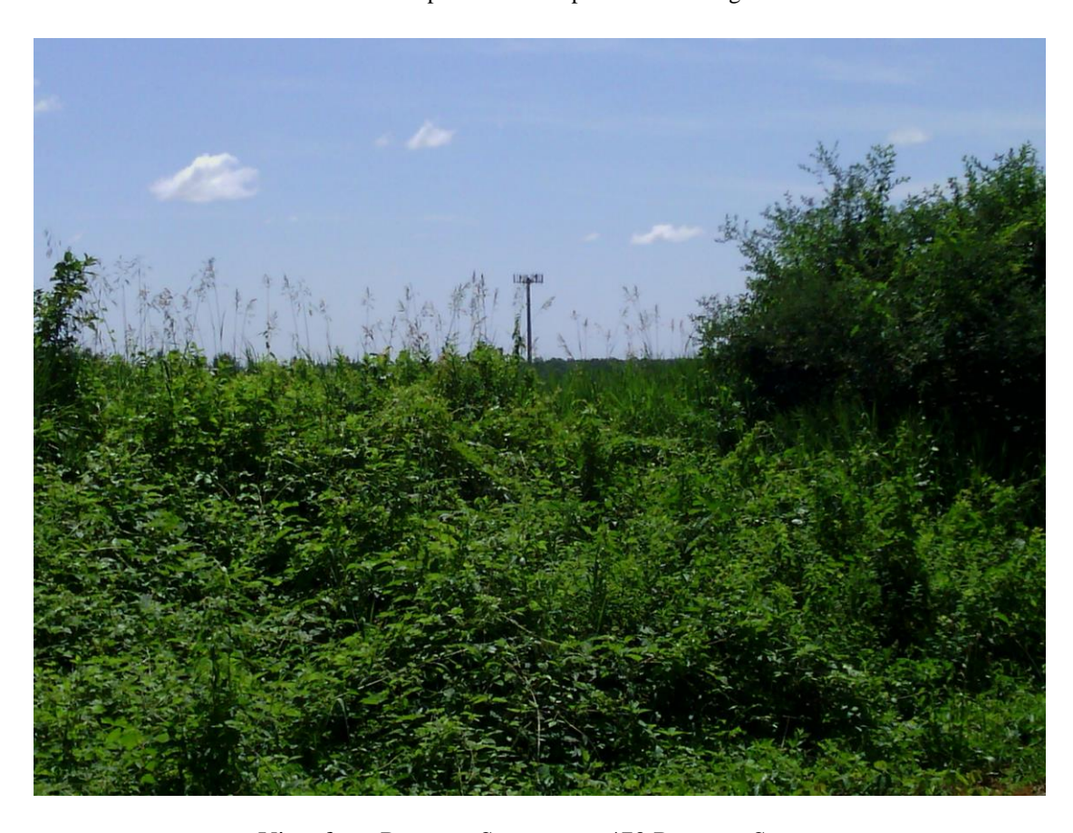
View from Prospect Street, near 470 Prospect Street.