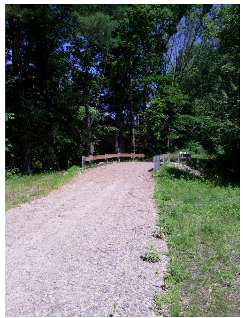
Access road over box culvert