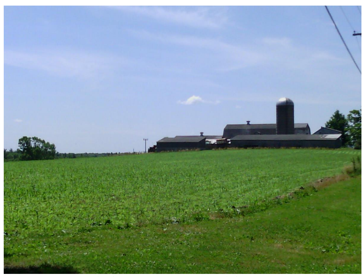
View from Prospect Street. Kuper Farm in foreground.