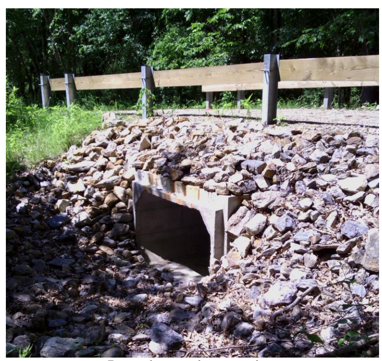
Box culvert outlet protection.