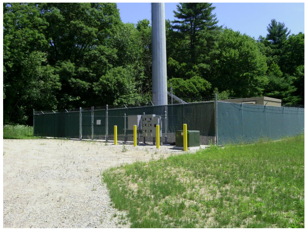
Compound – front view