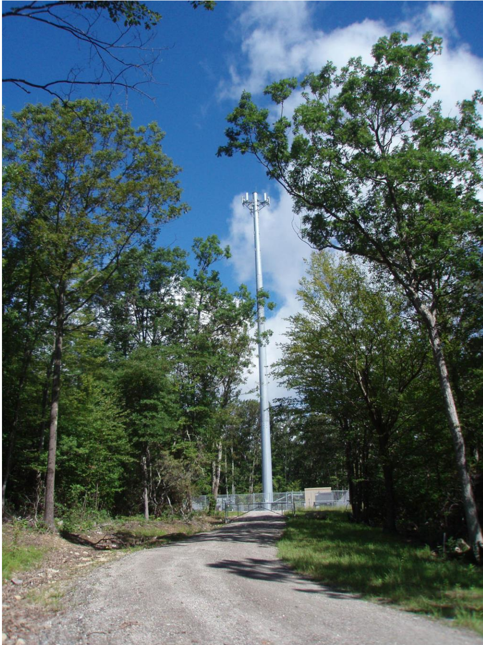
View of tower