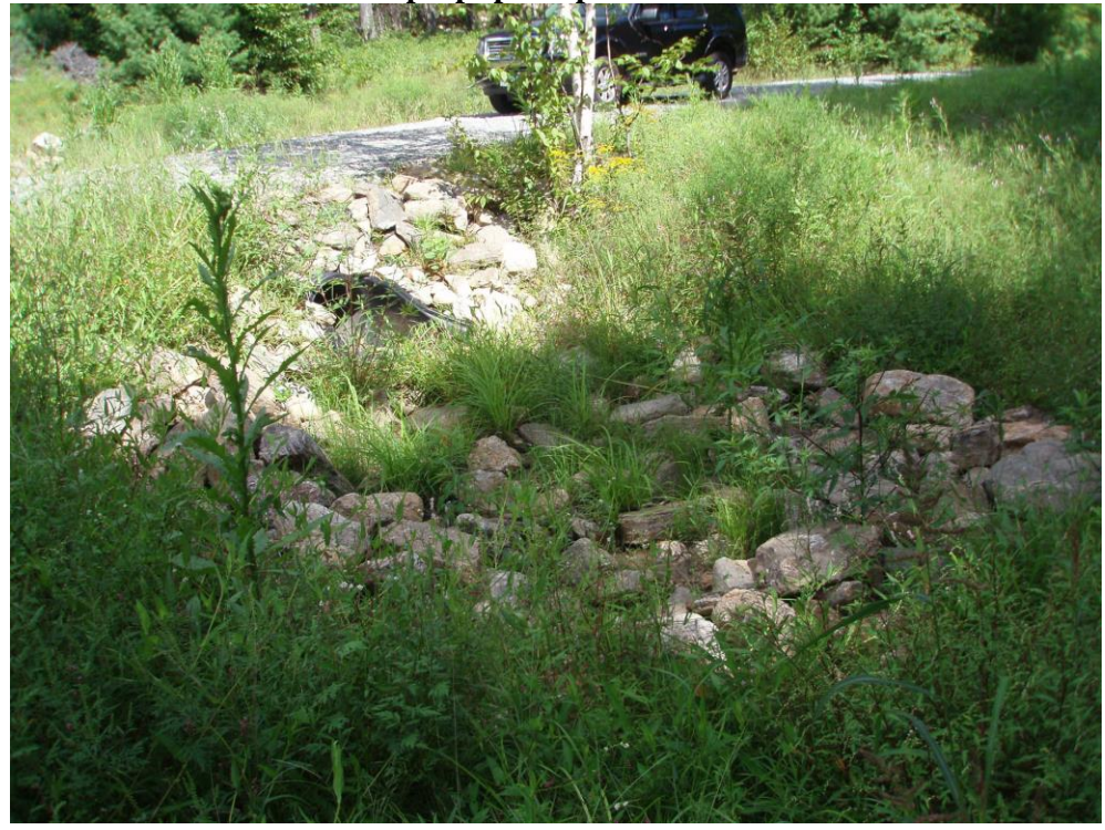
Culvert and riprap splash pad next to access drive

Culvert and riprap splash pad near access drive entrance