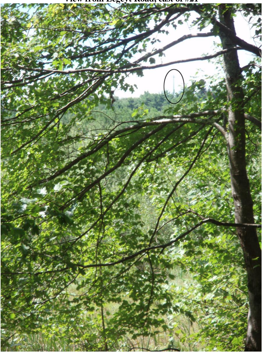
View from Legeyt Road, east of #21