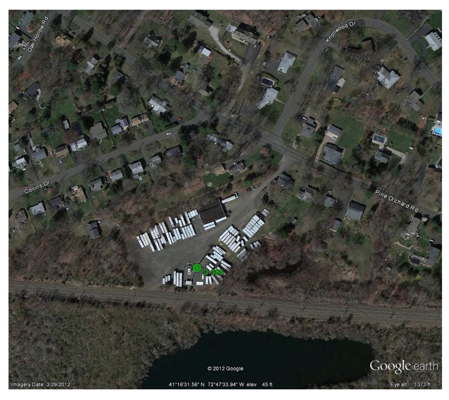
Site location at 121 Pine Orchard Road.