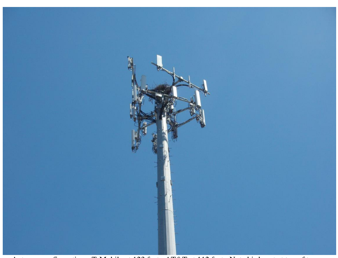
Antenna configuration - T-Mobile at 123 feet. AT&T at 112 feet. Note bird nest at top of tower.