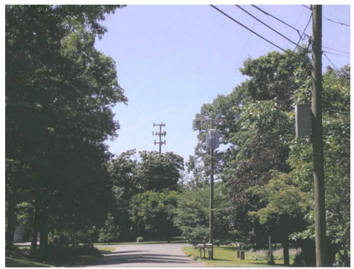
Predicted view of tower.