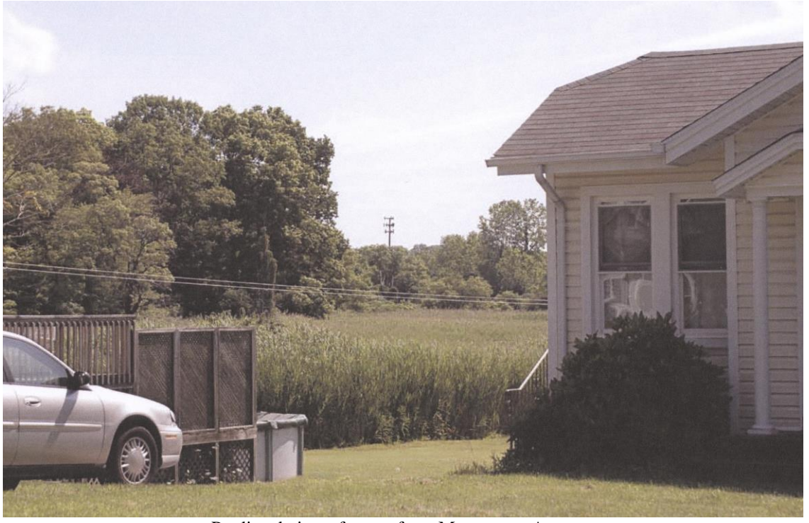
Predicted view of tower from Montowese Avenue.