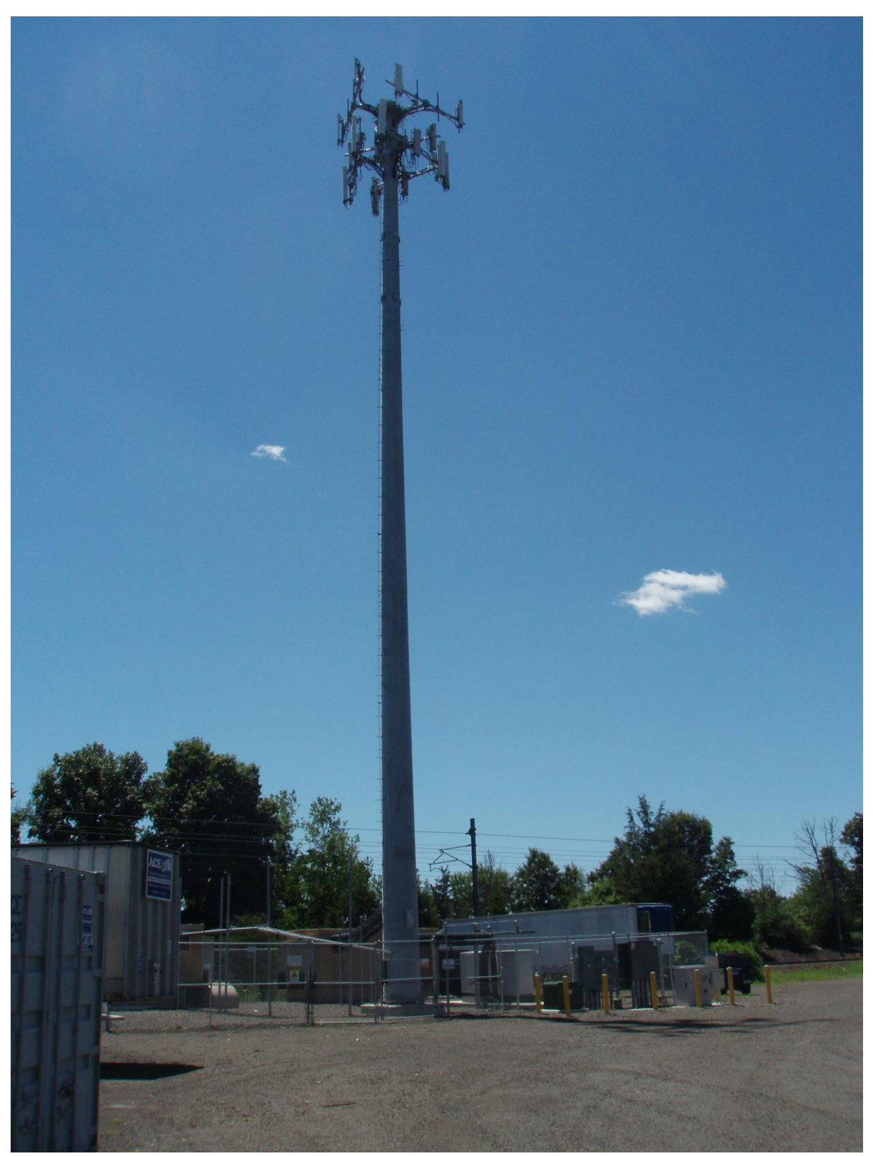
Site view from truck yard. Amtrak rail line located behind the site.