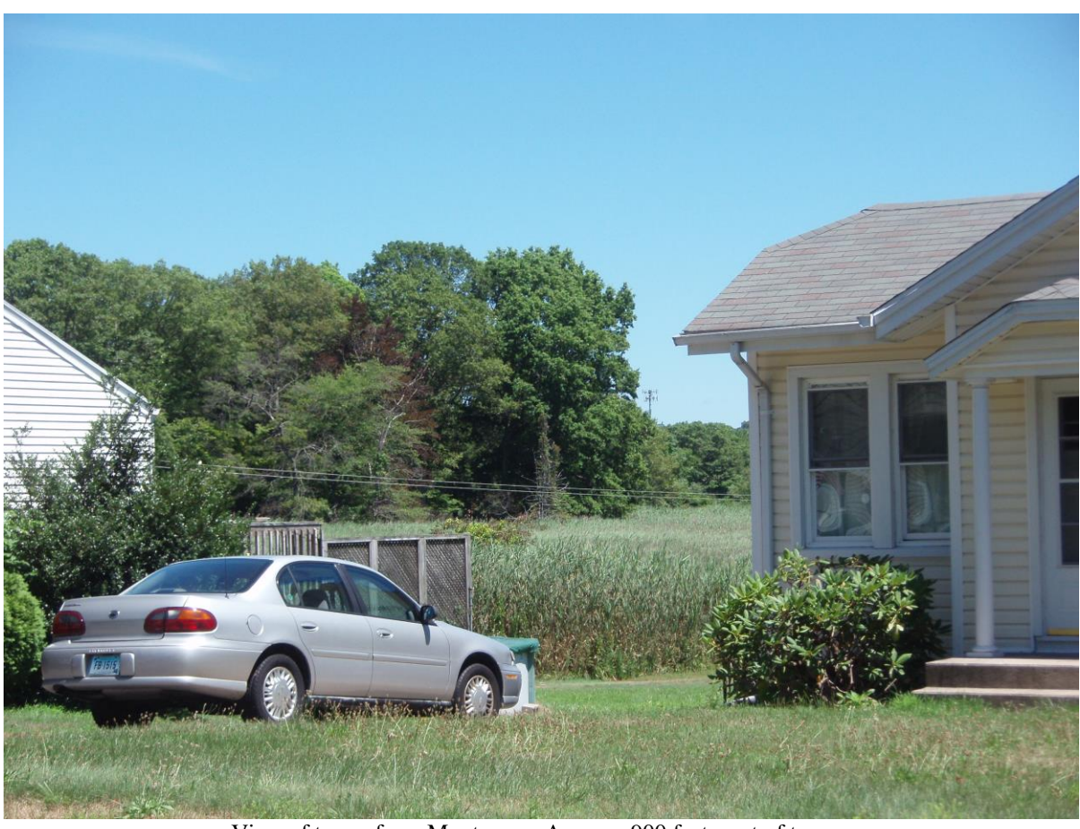
View of tower from Montowese Avenue, 900 feet west of tower.