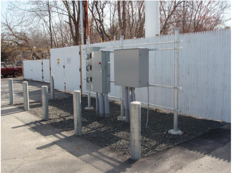
Utility board with bollard protection. Fenced area to far left is for plaza trash bins.