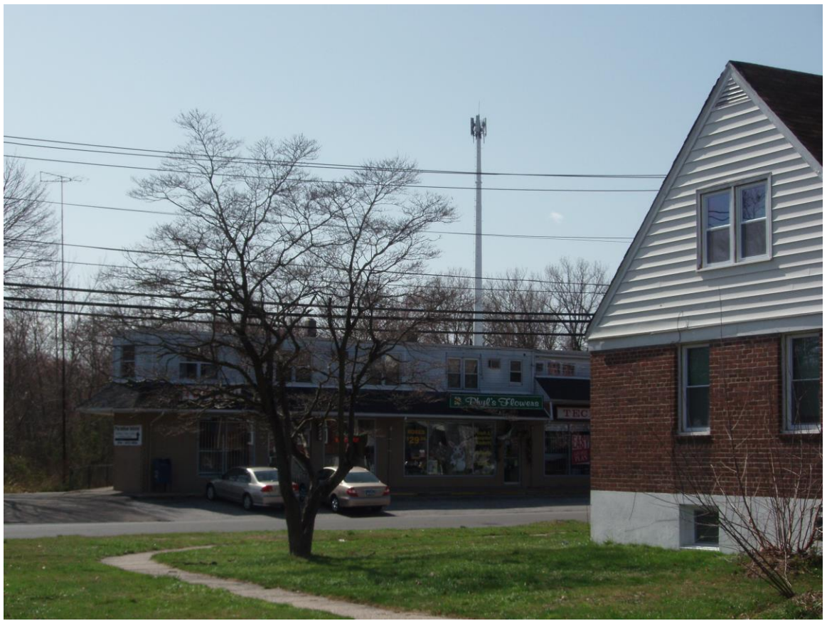
Actual view of tower.