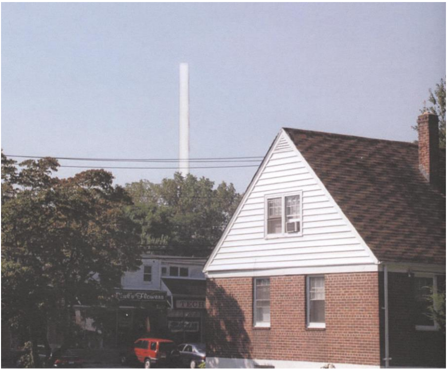
Predicted view of tower from Stonybrook Road and Broadbridge intersection, 380 feet northeast of site.