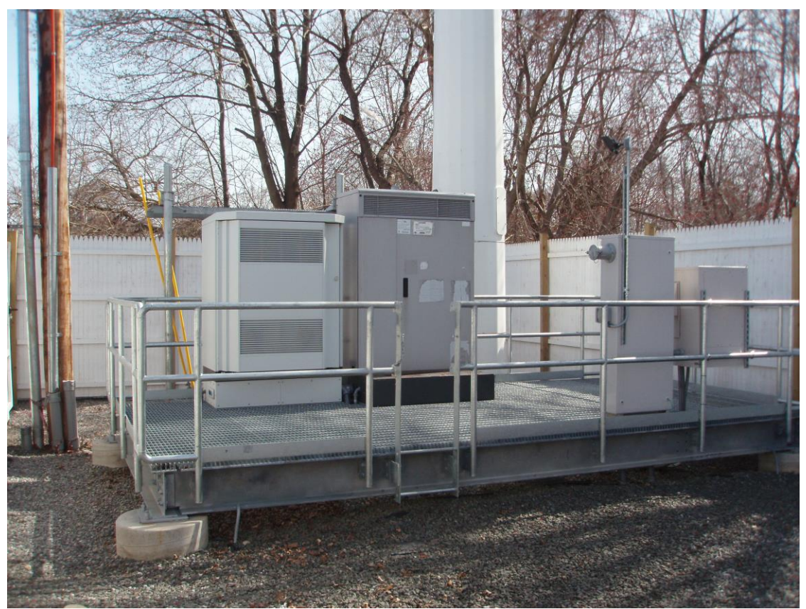
T-Mobile's radio equipment