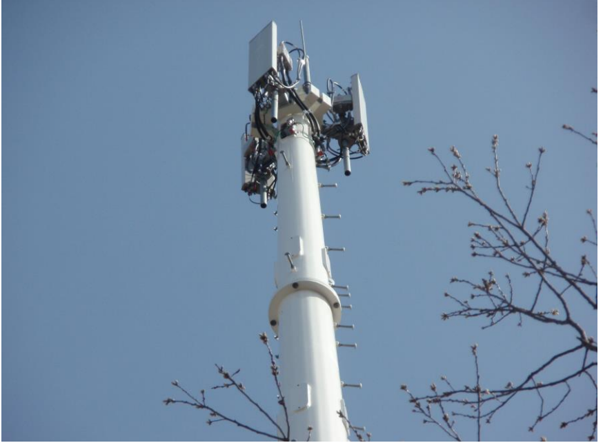
T-Mobile's antenna installation