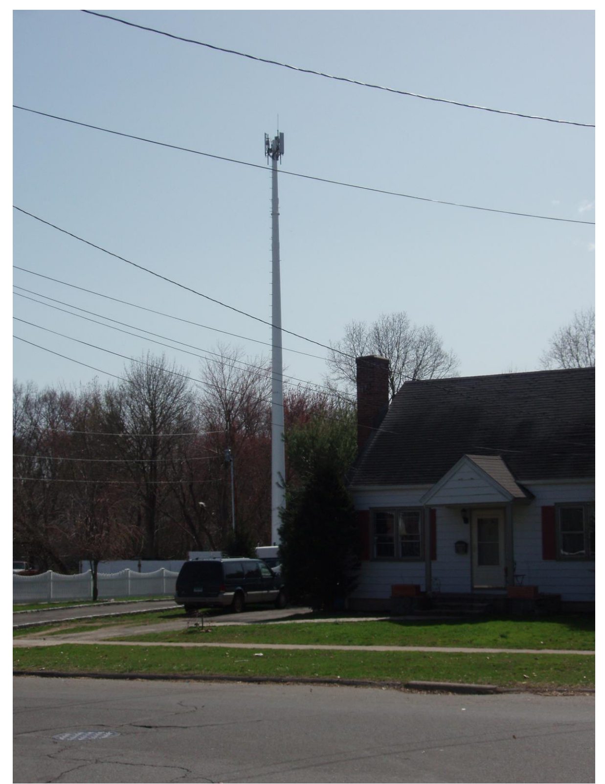
View of site from Stonybrook Road at Eaton Street. Houses are located across the street and one house is behind the white house in the photo above. The plaza is to the left, out of view.