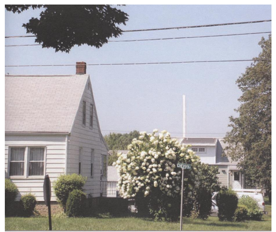
Predicted view of tower from intersection of Marcroft Street and Chevvy Street, 900 feet east of tower.