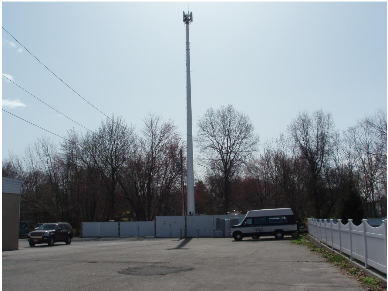
Site view from Stonybrook Road. Commercial plaza is to left, property line to right (white fence)