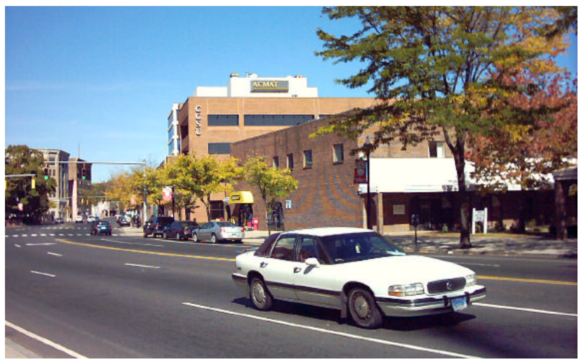
Figure 4. CCSU building along Main Street in New Britain. CCSU building houses meeting room used by Connecticut Siting Council.