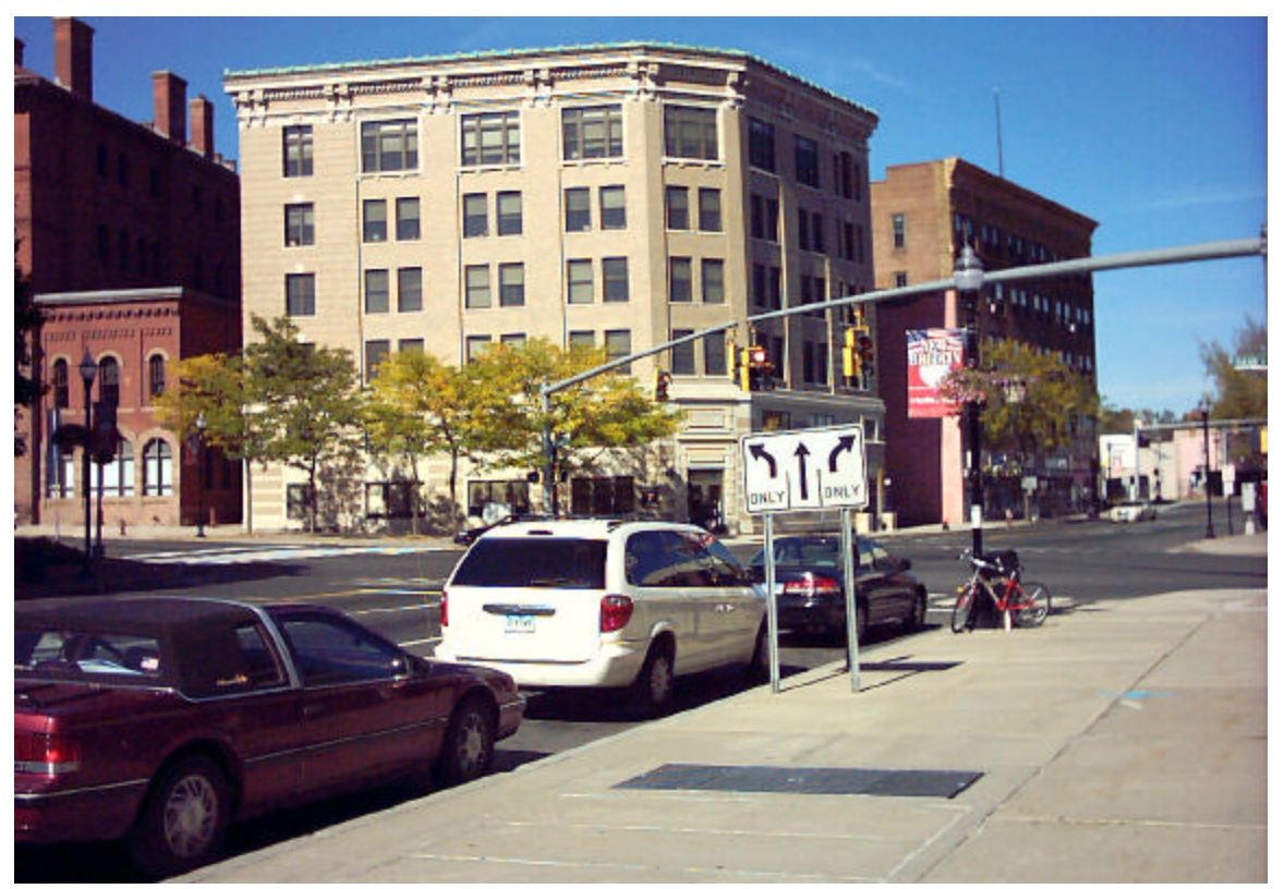
Figure 3. On the east side of Main Street in New Britain, looking northwest across Main Street toward Bank Street.