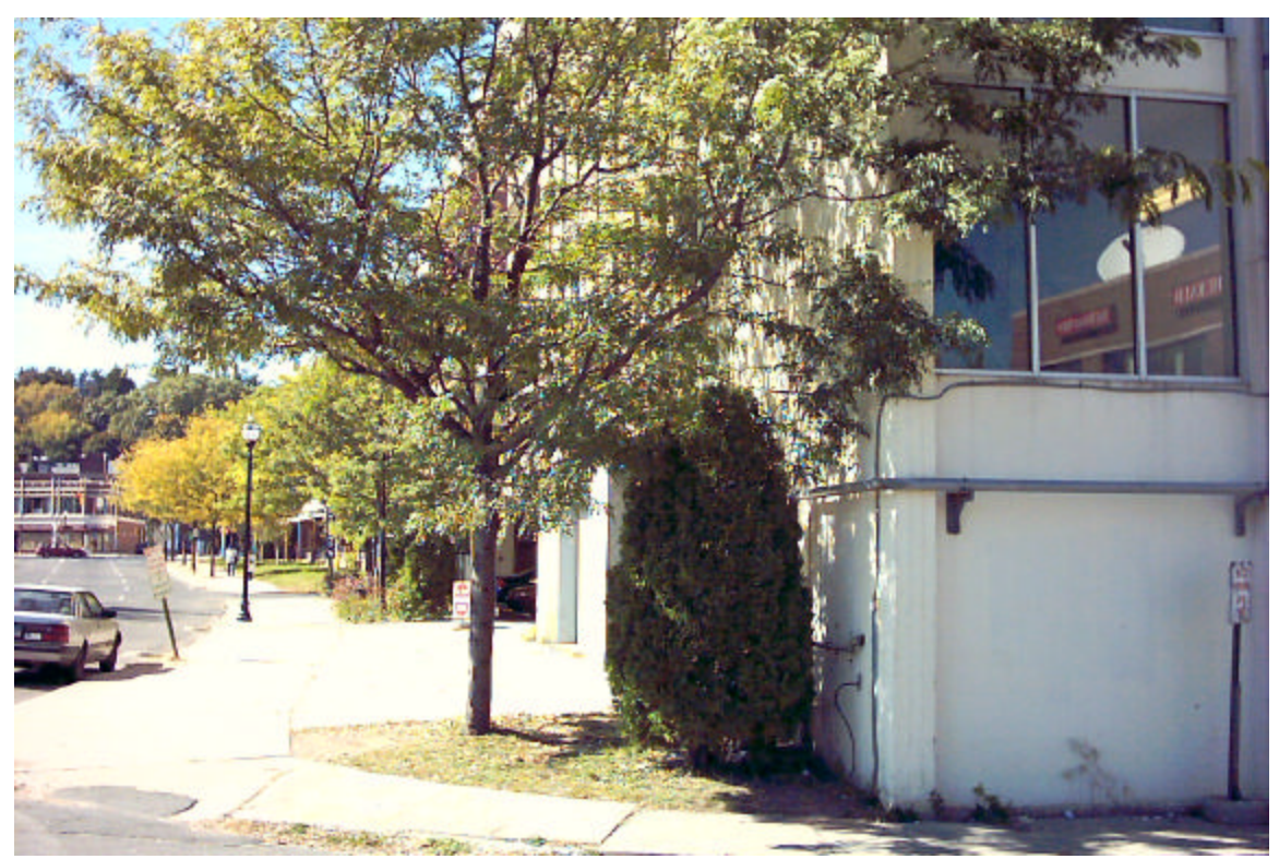
Figure 2. Walking path along north side of Chestnut. Southeast edge of parking garage.