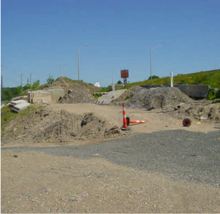
Several stockpiles of material remain along the Rt. 7 off-ramp near sta. #1. Containment has not been provided but erosion/migration issues were not observed.