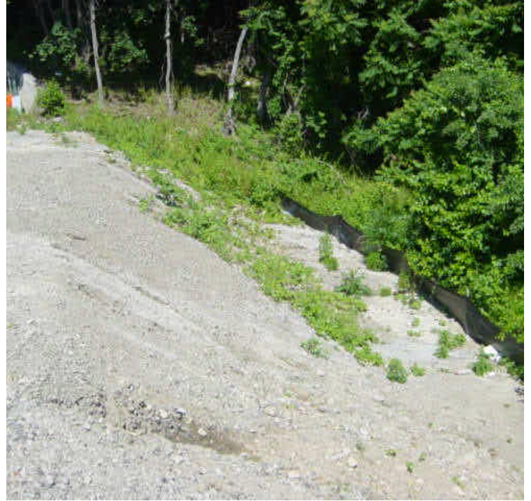
Sediment and debris continues to accumulate along the silt fence near sta. #14-16. Gullies have formed in several areas and portions of the slope are beginning to erode.