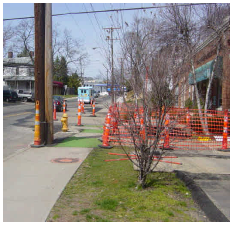
Trenching continues near sta. #50-51. Steel plates are in place in the roadway and adjacent parking lot.