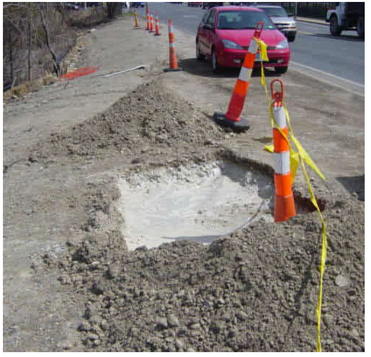
A concrete washout area was observed near sta. #16. Attempts were made to contain the area but additional controls are needed. The dirt berms should be built up if the area will be used further.