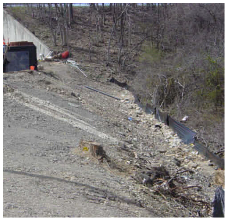
Silt fence remains in place along the slope between sta. #15-18. Sediment and debris are beginning to accumulate along the fence.