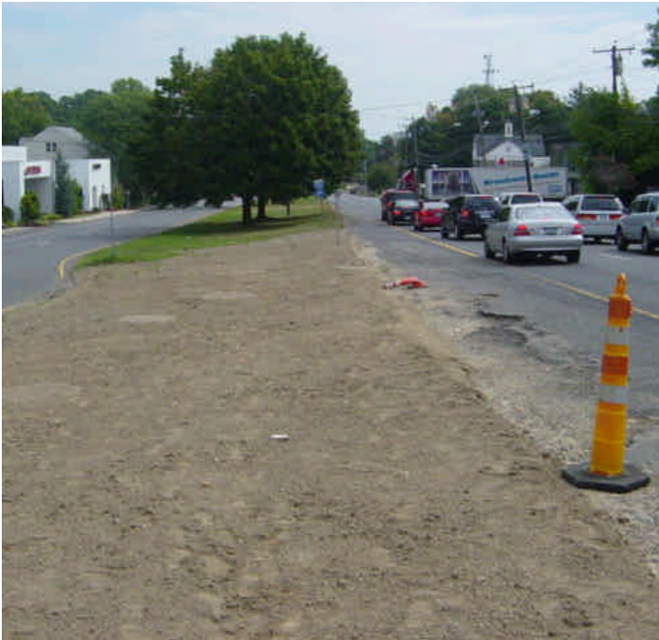
Topsoil remains over the area near sta. #316-318. The area has not yet been seeded or mulched and the bituminous curbing has not yet been replaced.