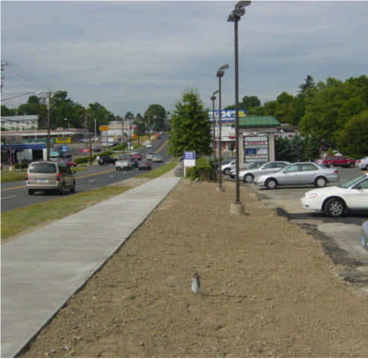
Topsoil has been spread in the area near sta. #130. Light poles and sidewalk have also been restored. Continue to stabilize with mulch and vegetation.