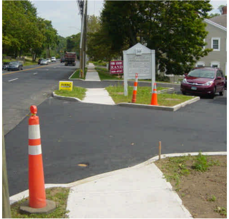
The area near vault #12 has been restored.